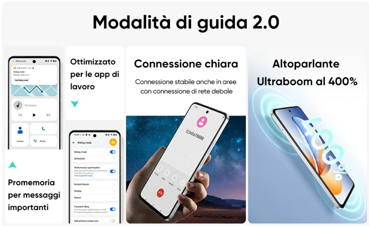
Image 4.1: Visual representation of realme C71 features including Driving Mode 2.0, optimized work apps, clear connection, and the 400% Ultraboom speaker.