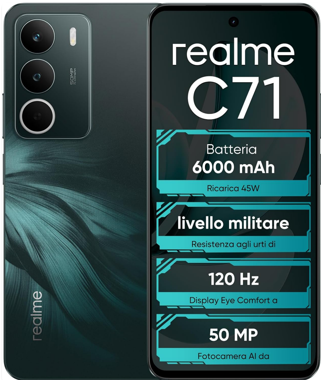
Image 1.1: Front and back view of the realme C71 4G Smartphone, highlighting its sleek design and camera module.