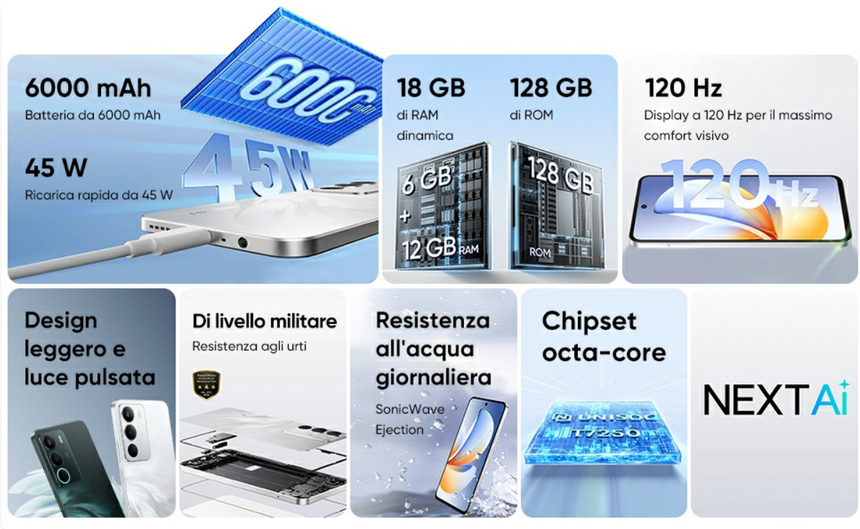
Image 5.1: Overview of realme C71's durability features, including military-grade shock resistance and daily water resistance.