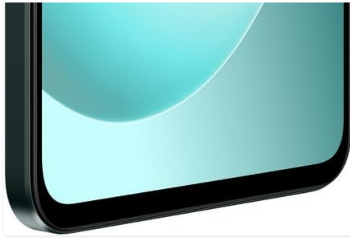
Image 3.1: Side view of the realme C71, illustrating the location of the SIM card tray.