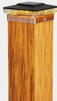
Figure 1: Applicable Post Sizes (3.5x3.5 Wood/Vinyl, 4x4 Wood/Vinyl)