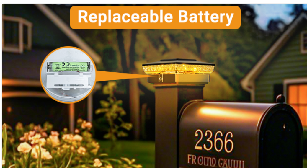
Figure 6: Replaceable Battery Access