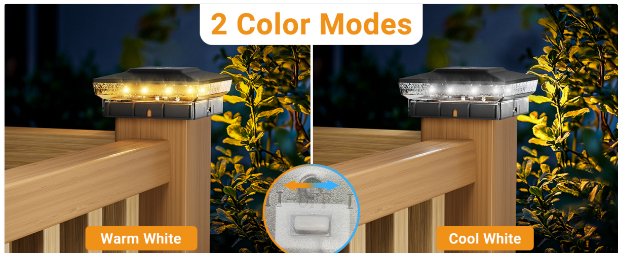
Figure 3: Dual Color Modes (Warm White and Cool White)