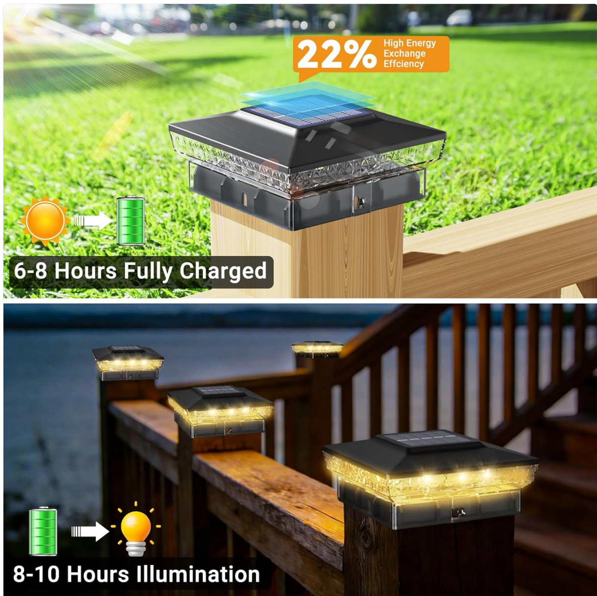
Figure 4: Solar Charging (6-8 hours) and Illumination (8-10 hours)