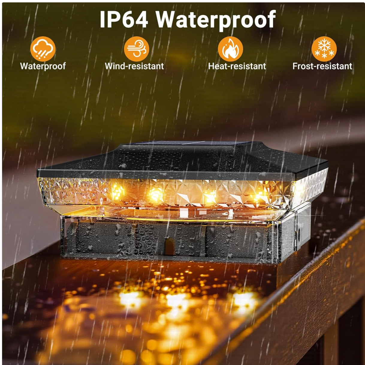
Figure 5: IP64 Waterproof Design