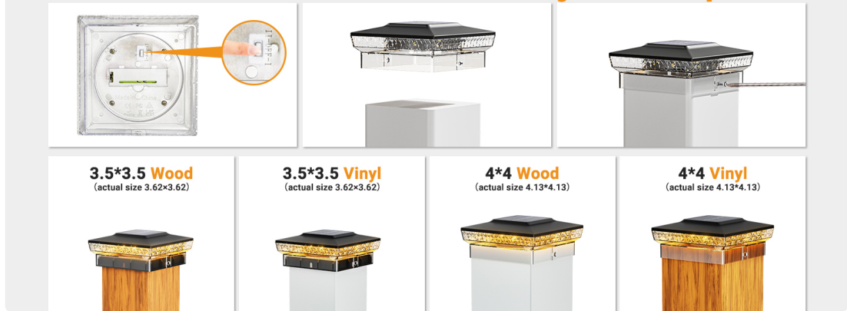
Figure 2: Installation Guide for 3.5x3.5 and 4x4 Posts

Video 1: Official bfarm Installation and Feature Overview for 4x4 Solar Post Cap Lights Outdoor.