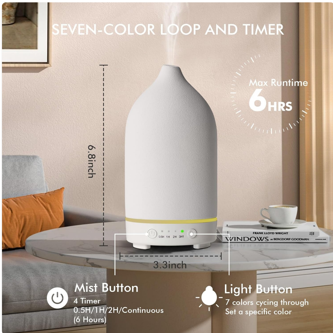
Figure 5: This image illustrates the diffuser's dimensions (6.8 inches tall, 3.3 inches wide) and the location of the Mist and Light control buttons, along with timer indicators.