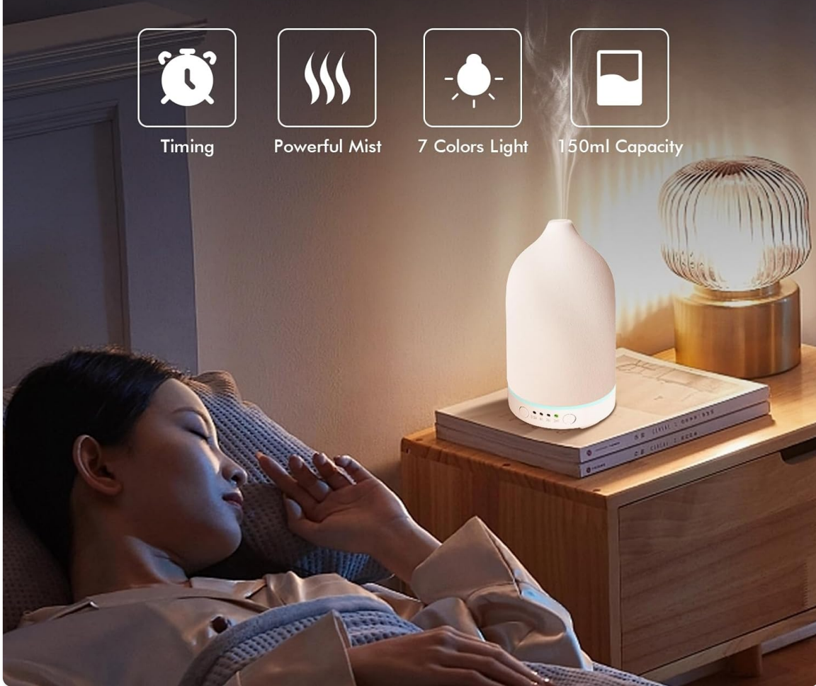
Figure 2: Visual representation of the diffuser's core features: timing options, powerful mist output, 7 LED light colors, and a 150ml water capacity.