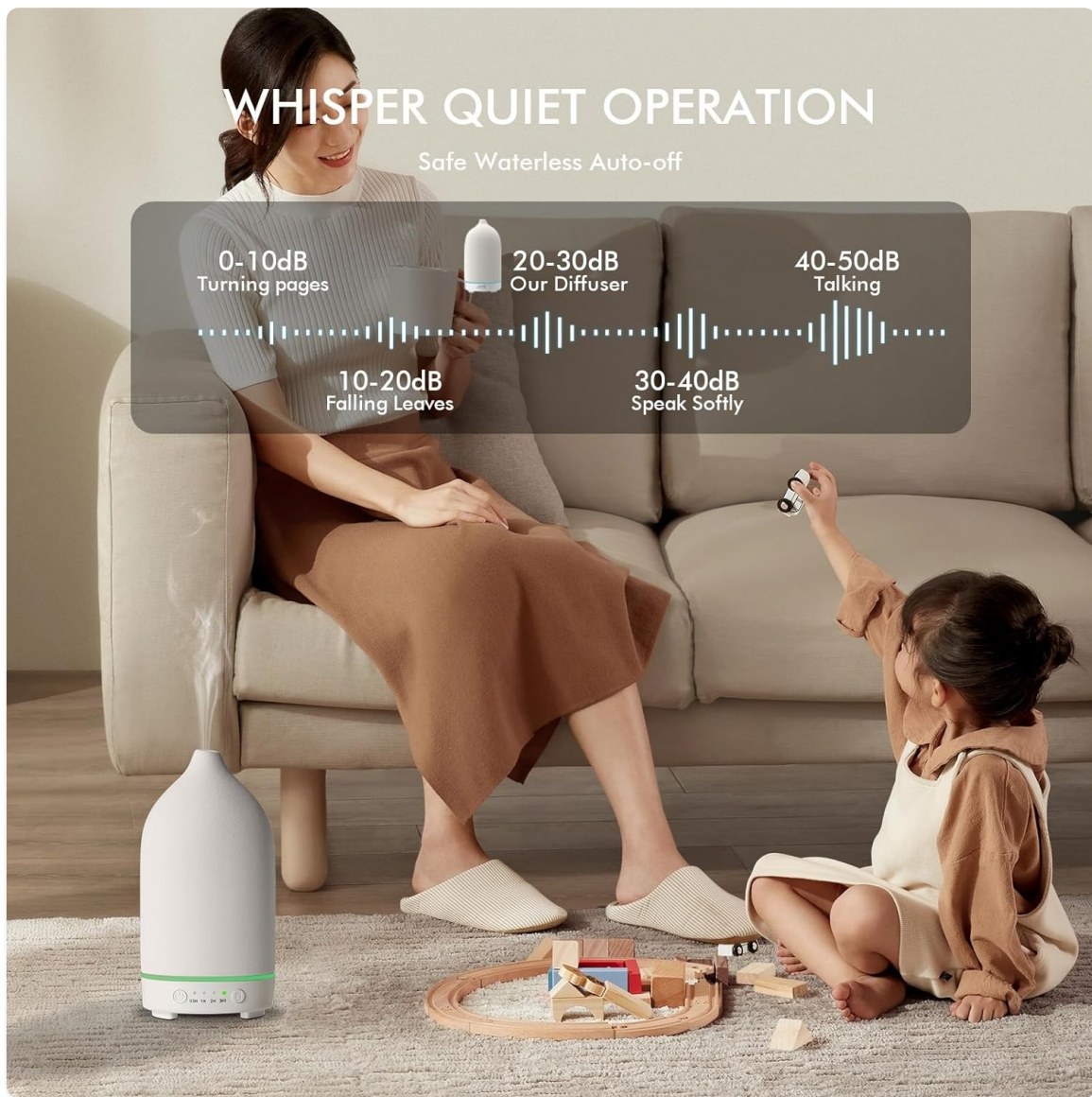
Figure 3: Illustration demonstrating the diffuser's whisper-quiet operation, with noise levels between 20-30dB, comparable to soft rustling leaves.