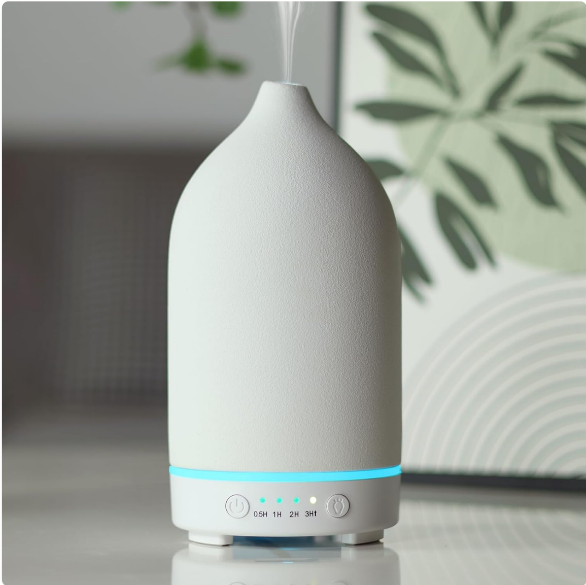
Figure 1: EQUUSUPRO 150ml Ceramic Essential Oil Diffuser. This image displays the diffuser in operation, emitting a fine mist with a subtle blue LED light at its base.

The EQUUSUPRO Ceramic Essential Oil Diffuser combines elegant design with advanced ultrasonic technology to provide aromatherapy, humidification, and ambient lighting. Its compact size makes it suitable for various spaces.