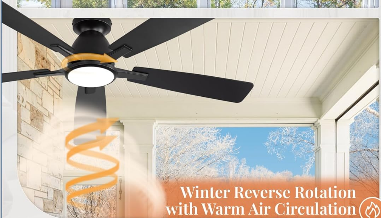
Image: Explains the 6-speed and reversible blade function, demonstrating how the fan provides cool air in summer and circulates warm air in winter.