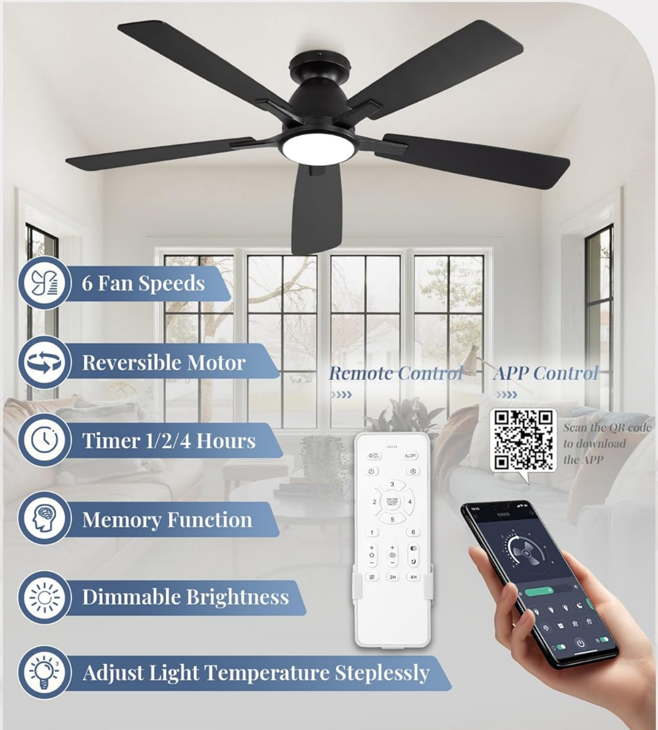
Image: Displays the three control methods: a physical remote, a smartphone screen showing the control app (with a QR code for download), and a wall switch. The QR code links to wosk.top/zd.html for app download.

Tips: Use APP control requires Bluetooth connection