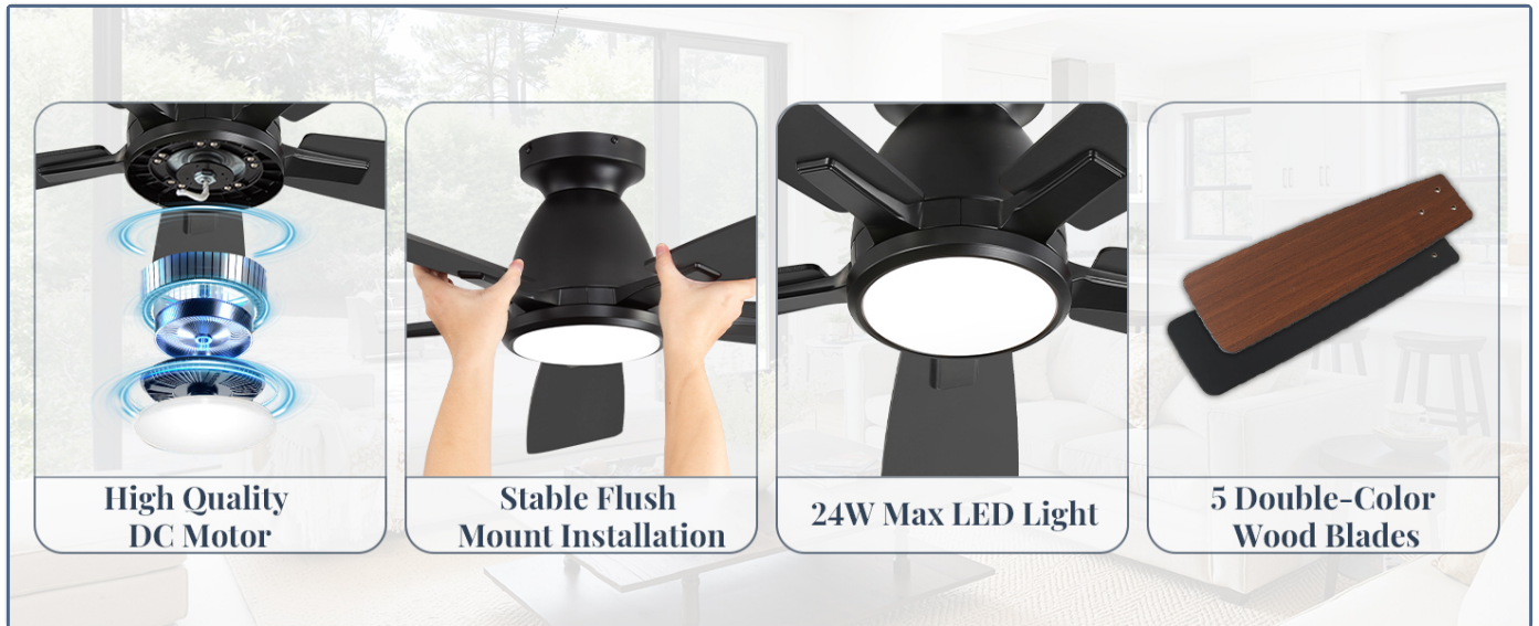
Image: Illustrates the high-quality DC motor, stable flush mount installation, 24W Max LED light, and the five double-color wood blades.

Secure the mounting bracket to the ceiling junction box. Then, attach the fan motor assembly to the mounting bracket, ensuring all connections are secure.