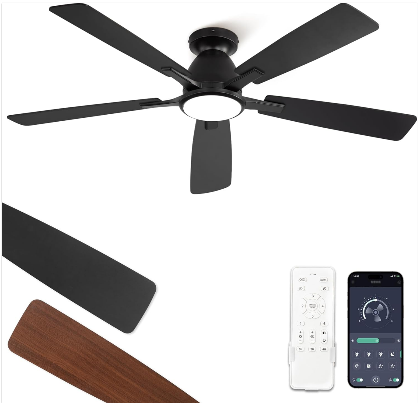
Image: All components of the Fanbulous 52-inch Smart Flush Mount Ceiling Fan, including the motor, five blades, LED light kit, remote control, and various installation hardware.