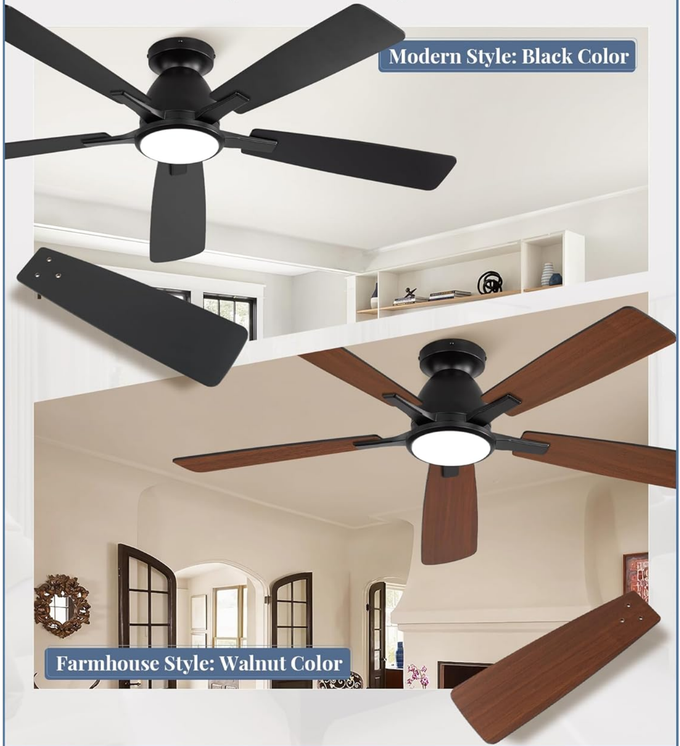
Image: Demonstrates the dual-sided fan blades, allowing users to choose between a modern black finish or a farmhouse-style walnut finish.