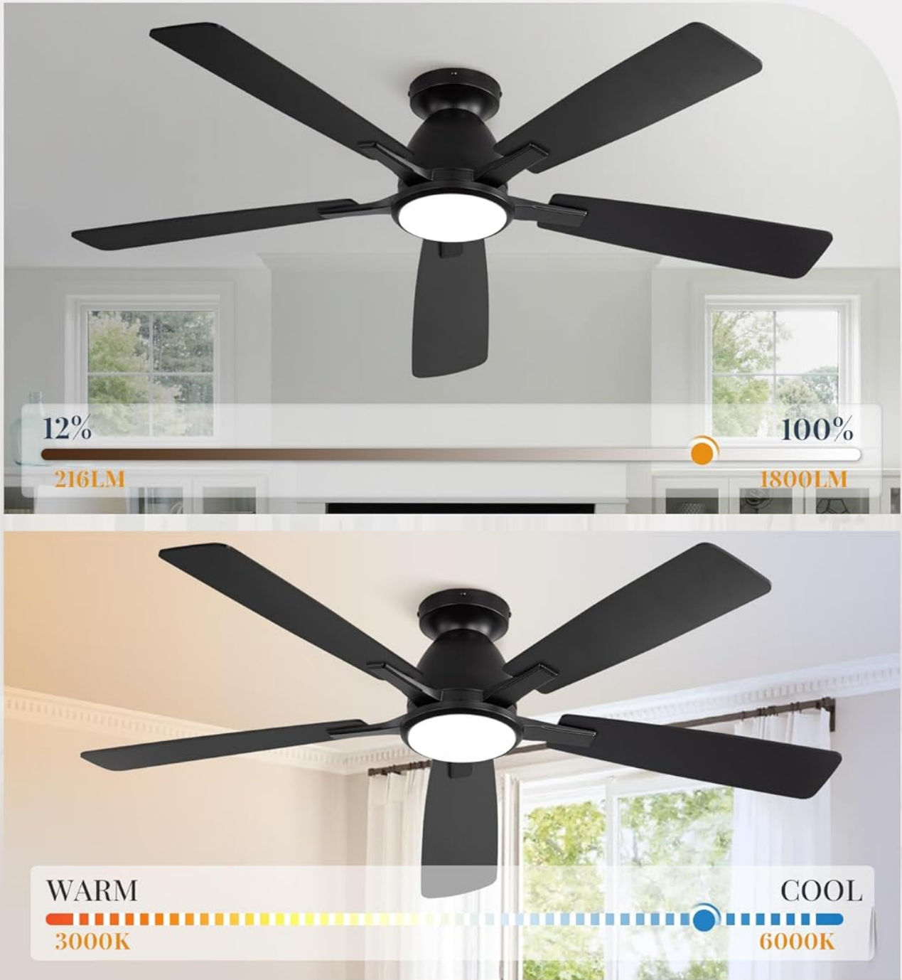
Image: Illustrates the infinitely adjustable color temperature and dimmable brightness features of the integrated LED light.

Meet the light demand in different scenarios