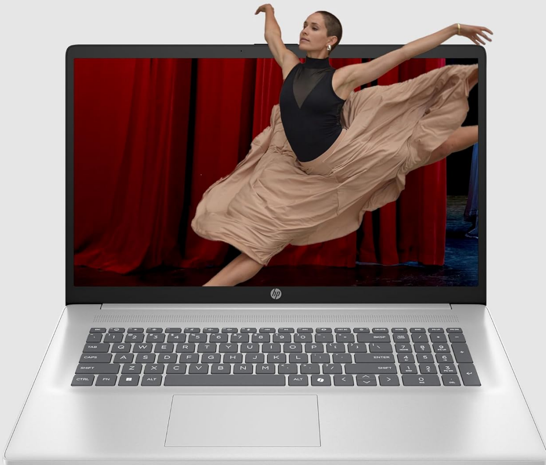
Figure 3.1: Enjoy flicker-free images on the HD+ screen.

See more and enjoy flicker-free images on the HD+ screen and get comfy while you type with a lift-hinge that elevates the keyboard.