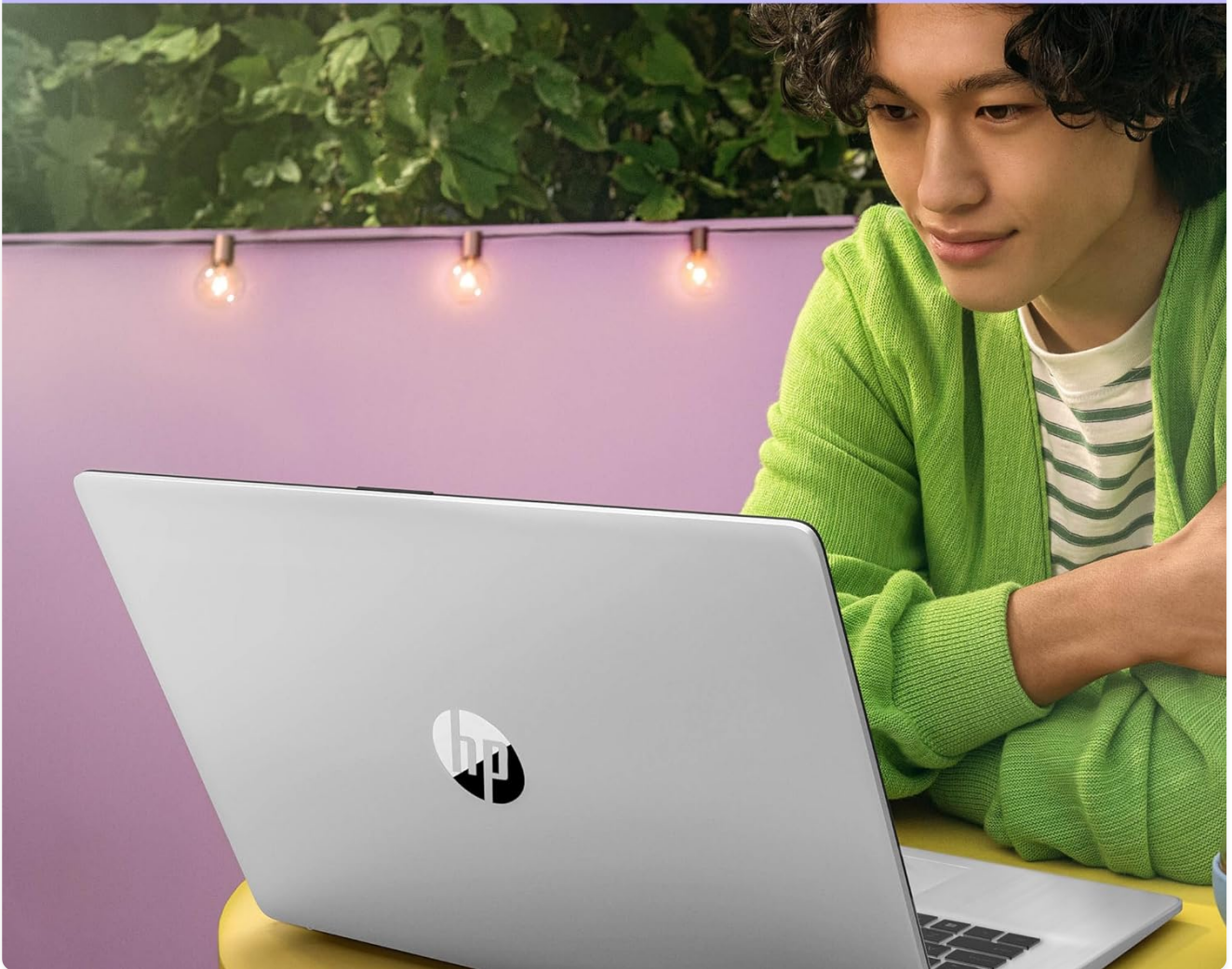
Figure 3.4: Multitasking is easy and fast with AMD processor and speedy Wi-Fi.

Multitasking feels easy and fast with an AMD processor, powerful graphics, and speedy Wi-Fi technology.