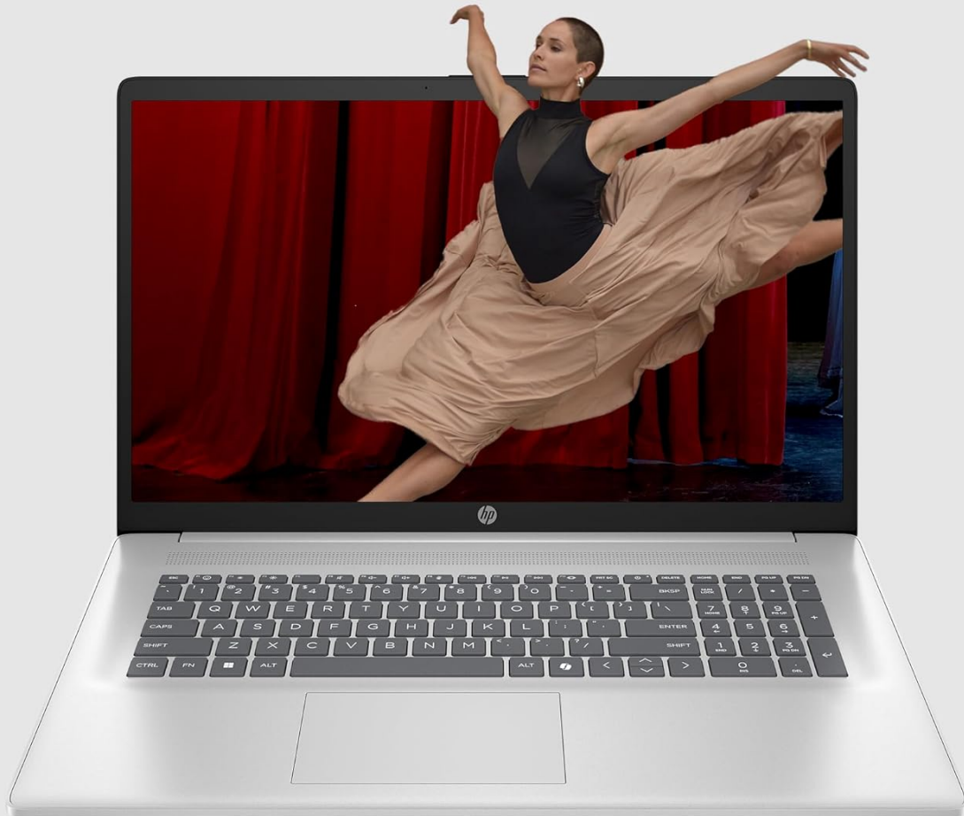
Figure 3.7: HP True Vision HD camera for vibrant picture and clear audio.

See more and enjoy flicker-free images on the HD+ screen and get comfy while you type with a lift-hinge that elevates the keyboard.