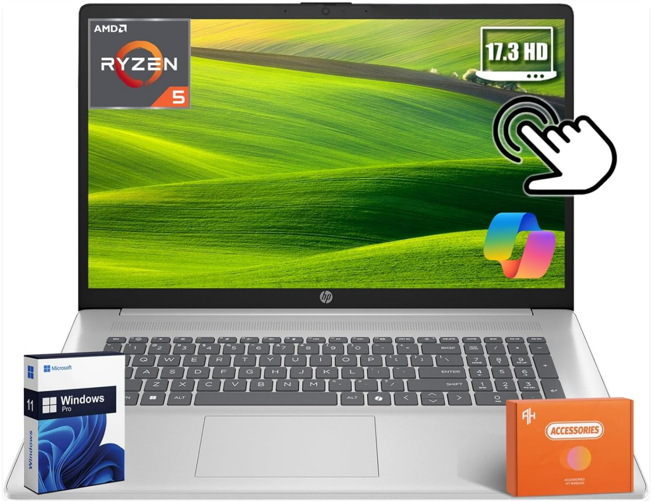
Figure 2.1: HP 17.3 inch Touchscreen Laptop and included accessories.