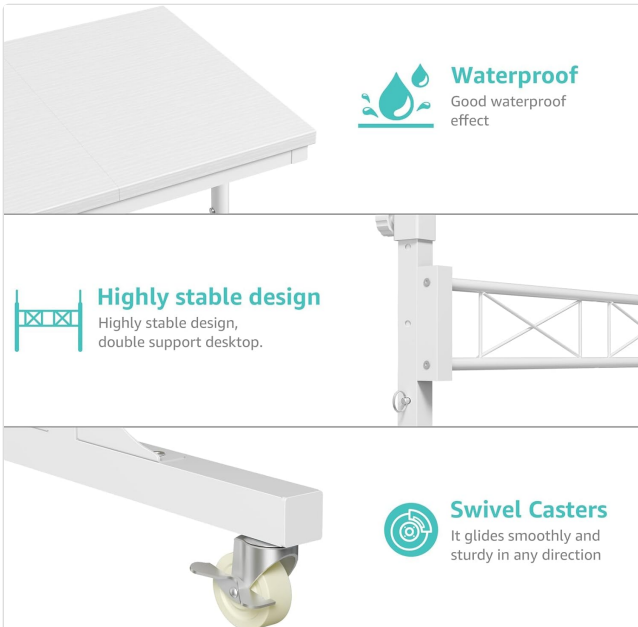
Figure 8: Durable and Stable Design. A composite image highlighting key features: the waterproof desktop surface, the highly stable double-support desktop design, and the smooth-gliding swivel casters.