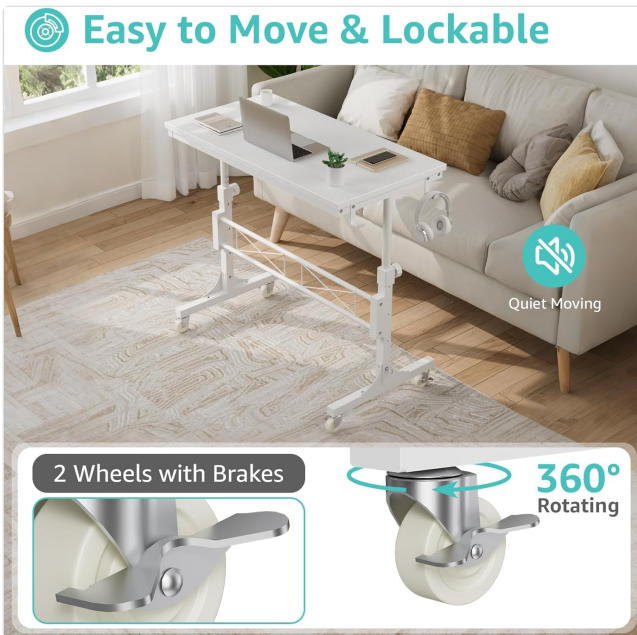
Figure 4: Easy Movement and Locking. This image focuses on the desk's mobility, showcasing its 360-degree rotating ball-bearing swivel casters and the locking mechanism on two of the wheels for stability.