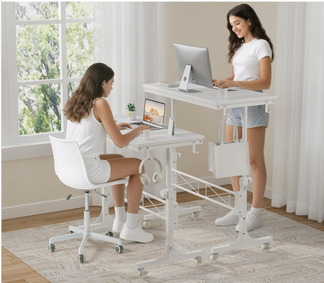
Figure 6: Adjustable Height for Sitting and Standing. Two users are shown with the desk; one is seated, and the other is standing, illustrating the desk's adjustable height feature for both sitting and standing work positions.