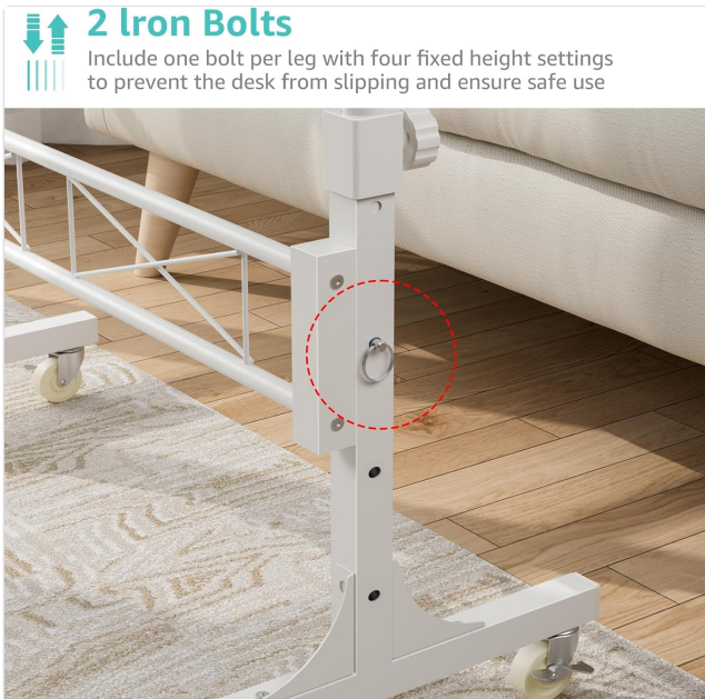
Figure 2: Height Adjustment Mechanism. A detailed view of the desk's height adjustment system, highlighting the iron bolts and the four fixed height settings that ensure stability and prevent slipping.