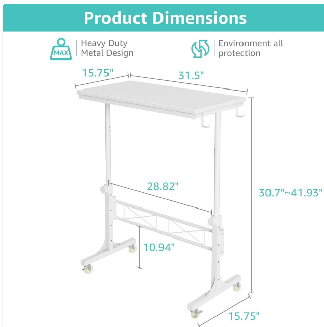
Figure 1: Product Dimensions. A detailed diagram illustrating the key dimensions of the desk, such as its adjustable height range (30.7" to 41.9"), desktop width (31.5"), and depth (15.7"). It also indicates heavy-duty metal design and environmental protection.

The WINAZ Small Portable Treadmill Walking Pad Desk is designed for quick and easy assembly. Follow the step-by-step guide provided in the included instruction manual to ensure correct and secure setup. All necessary tools are provided.