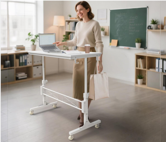
Figure 5: Teacher Desk Application. This image demonstrates the desk's versatility as a teacher's podium or lectern, with a user presenting from a laptop in a classroom environment.