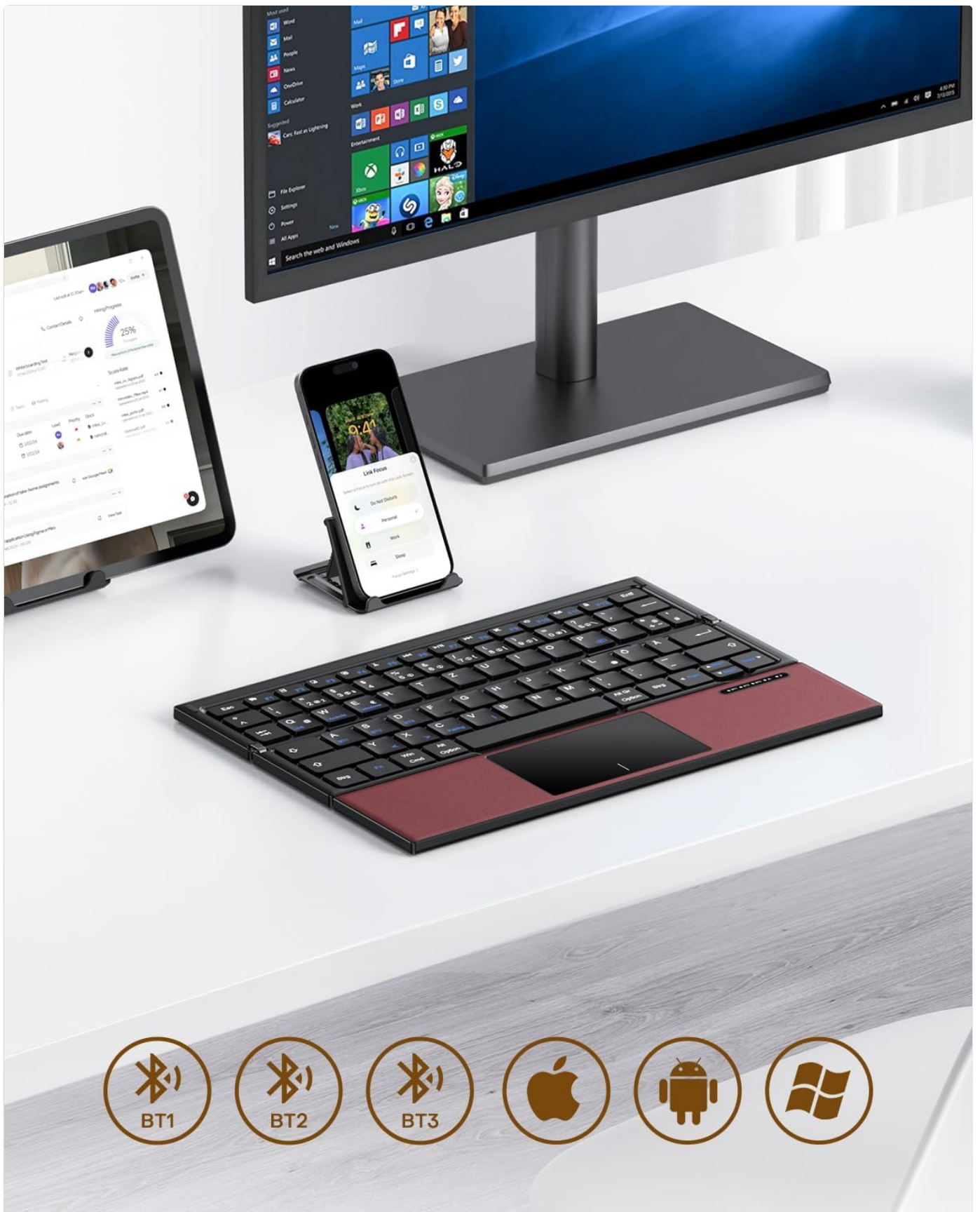
Image 3.1: The OMOTON Foldable Bluetooth Keyboard in use with a tablet, smartphone, and monitor, demonstrating multi-device connectivity via BT1, BT2, and BT3 channels.