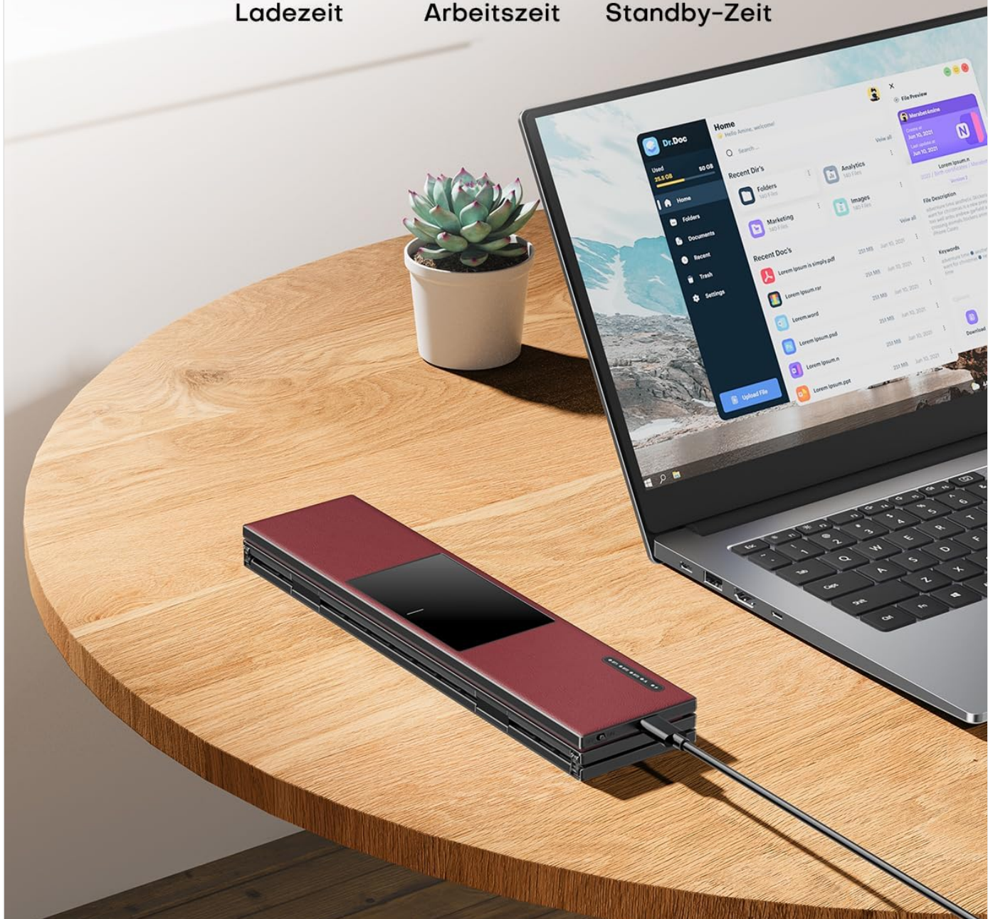
Image 4.1: The keyboard connected via its Type-C port for charging, with icons indicating charging time, working time, and standby time.