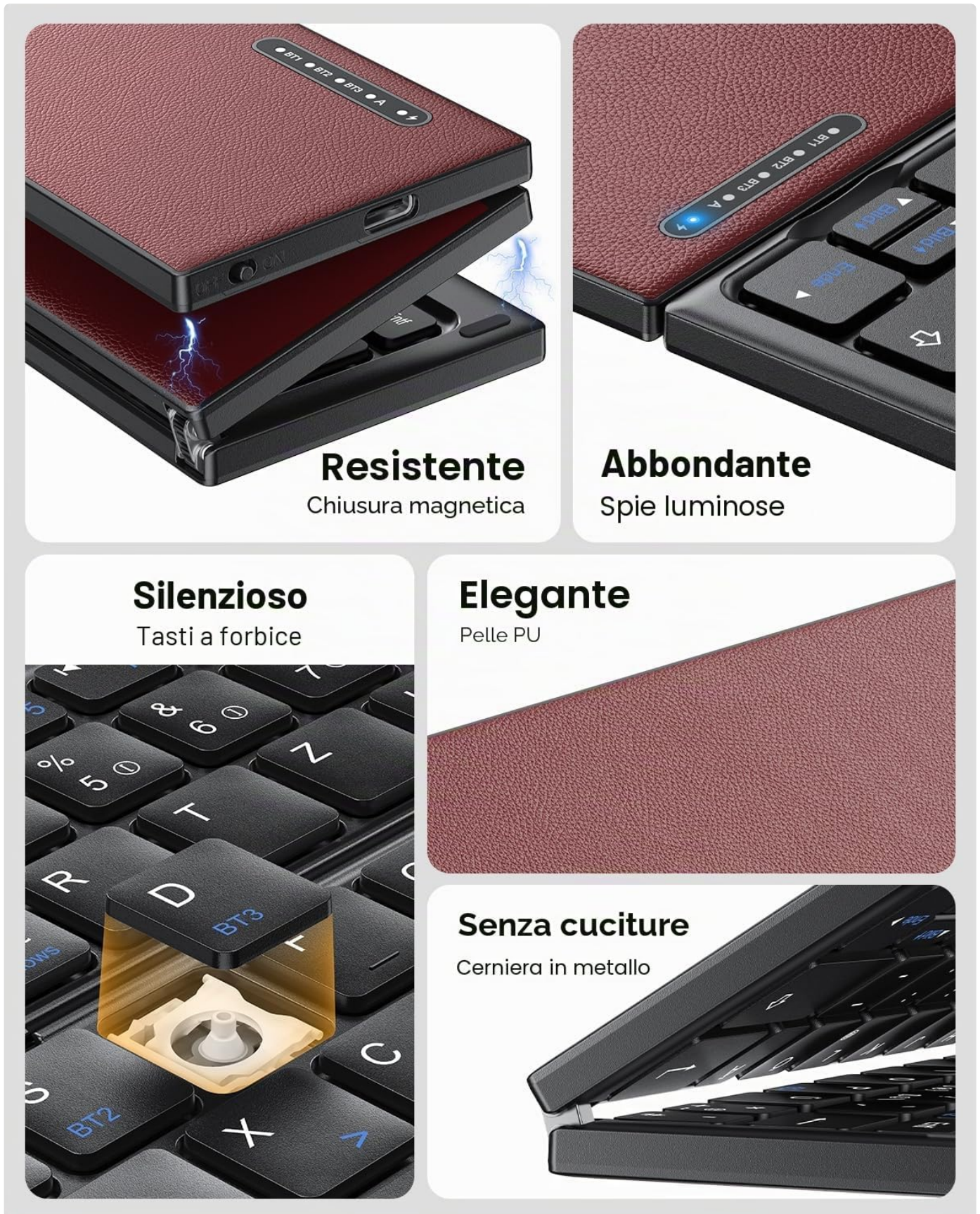
Image 3.2: Close-up details of the keyboard, highlighting its magnetic closure, indicator lights, silent scissor keys, elegant PU leather finish, and durable metal hinge.