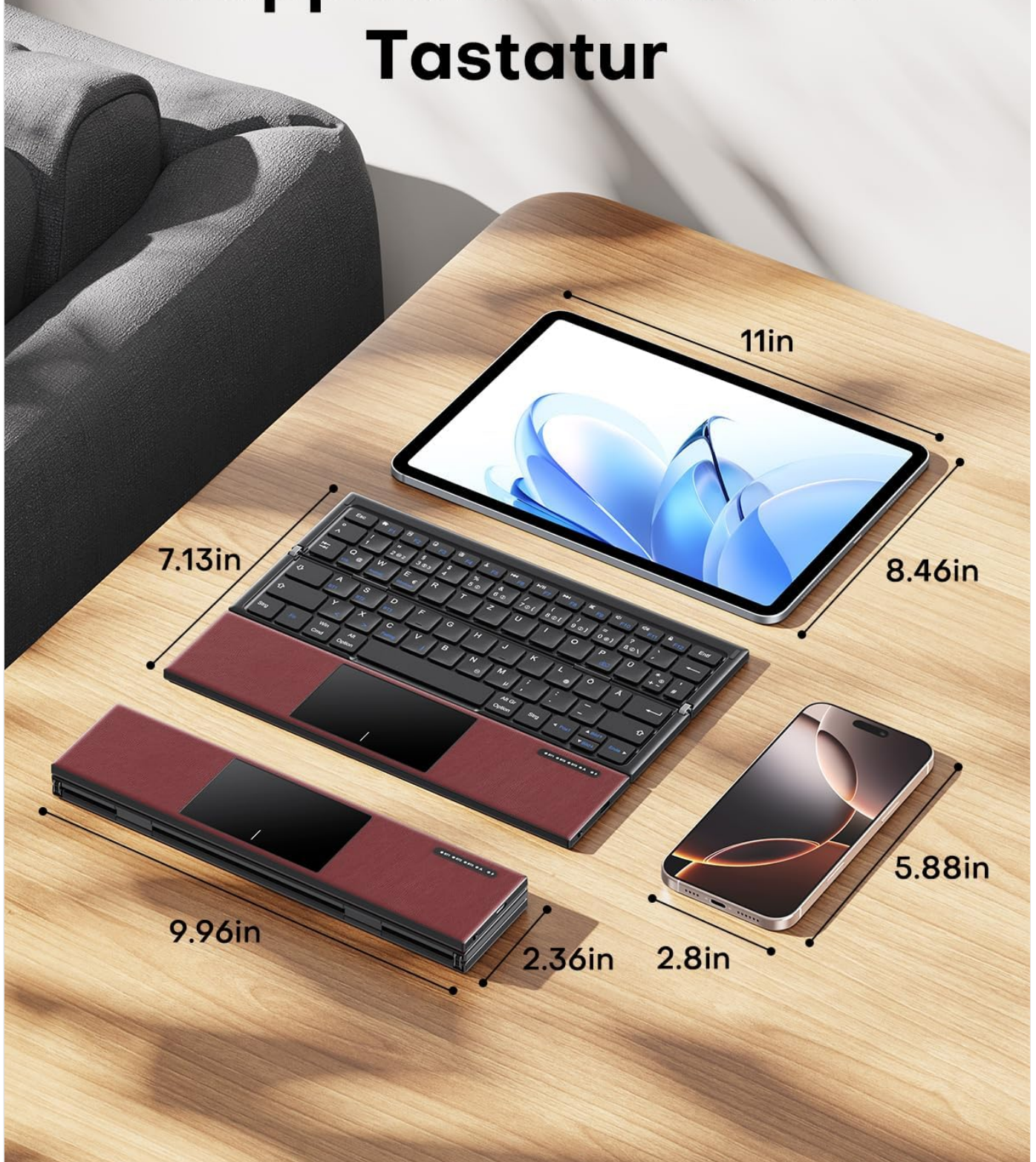
Image 8.1: Visual representation of the keyboard's dimensions when unfolded and folded, alongside a tablet and smartphone for scale.