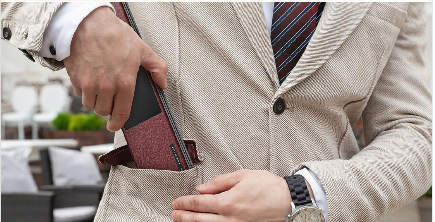
Image 3.4: The folded keyboard being placed into a carrying case inside a bag and slipped into a jacket pocket, illustrating its compact size and ease of transport.