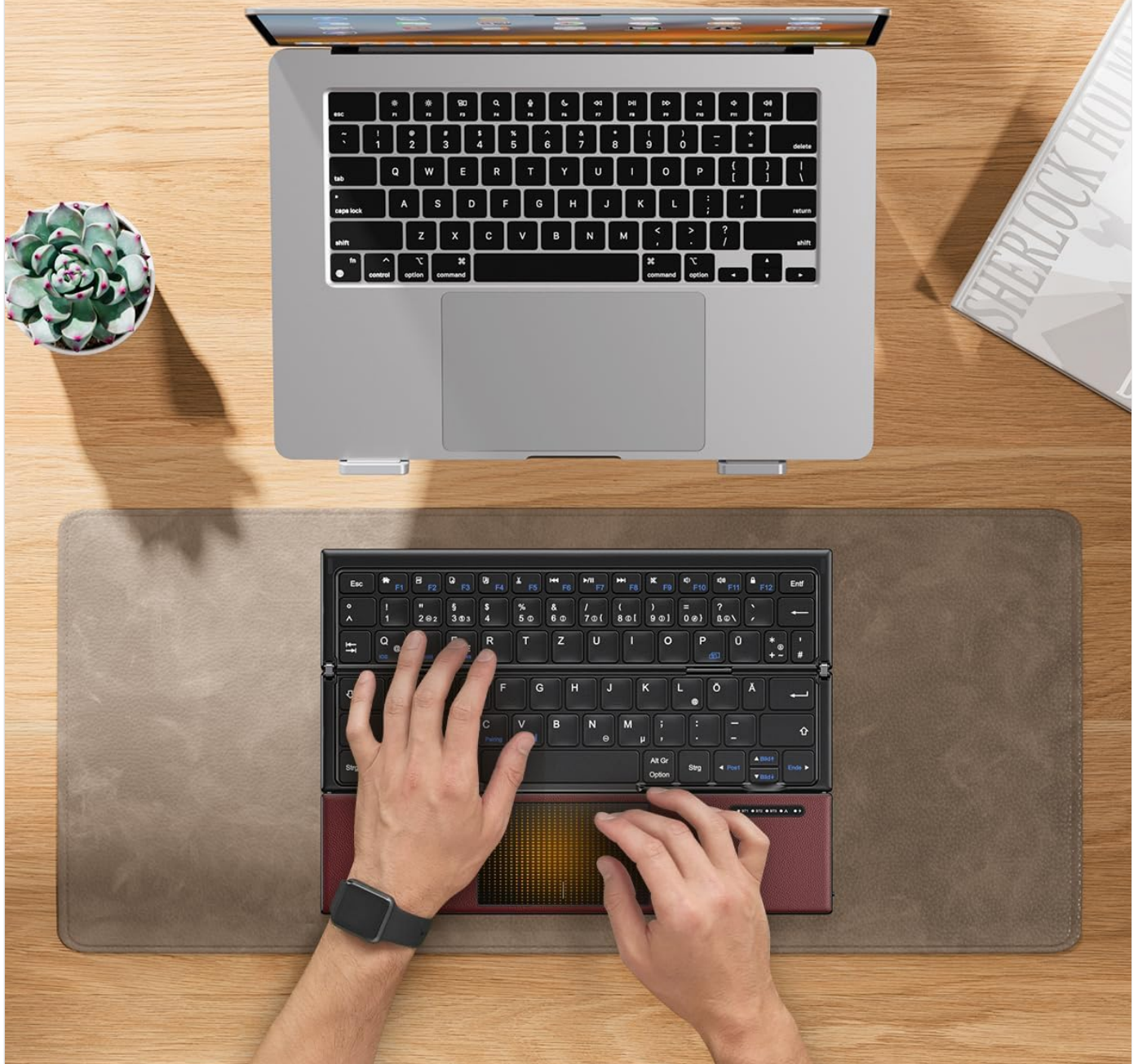
Image 5.1: The keyboard displaying its full-size keys and integrated multi-touch touchpad, designed for a laptop-like typing experience.