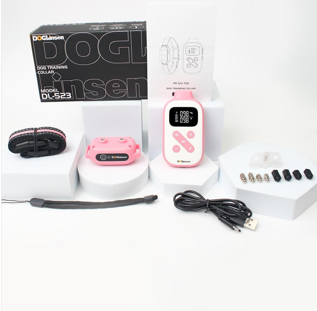
Image: All components included in the DOGLinsen 2-in-1 Bark and Shock Collar package, laid out neatly.

Video: A detailed unboxing of the DOGLinsen 2-in-1 Bark and Shock Collar, showing each item included in the package.