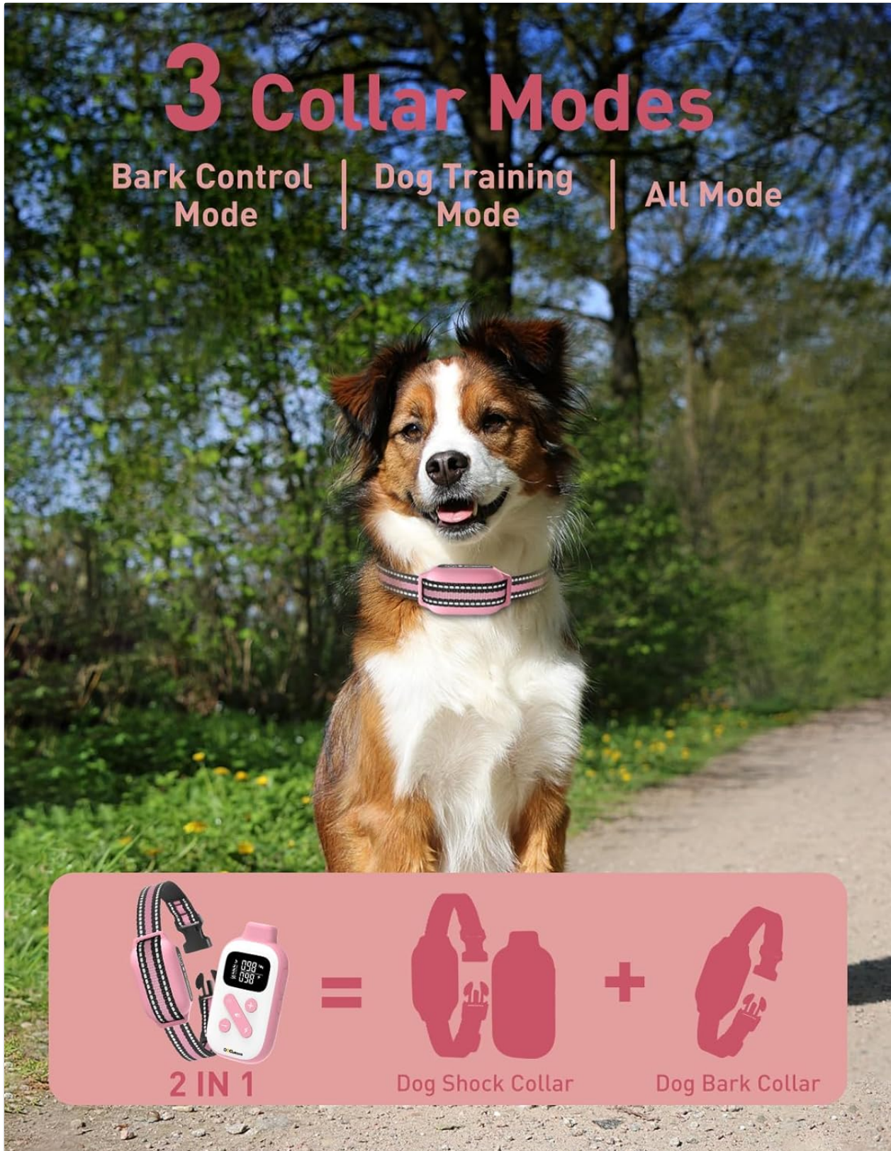
Image: A dog wearing the collar, with an overlay illustrating the three available collar modes: Bark Control, Dog Training, and All Mode.