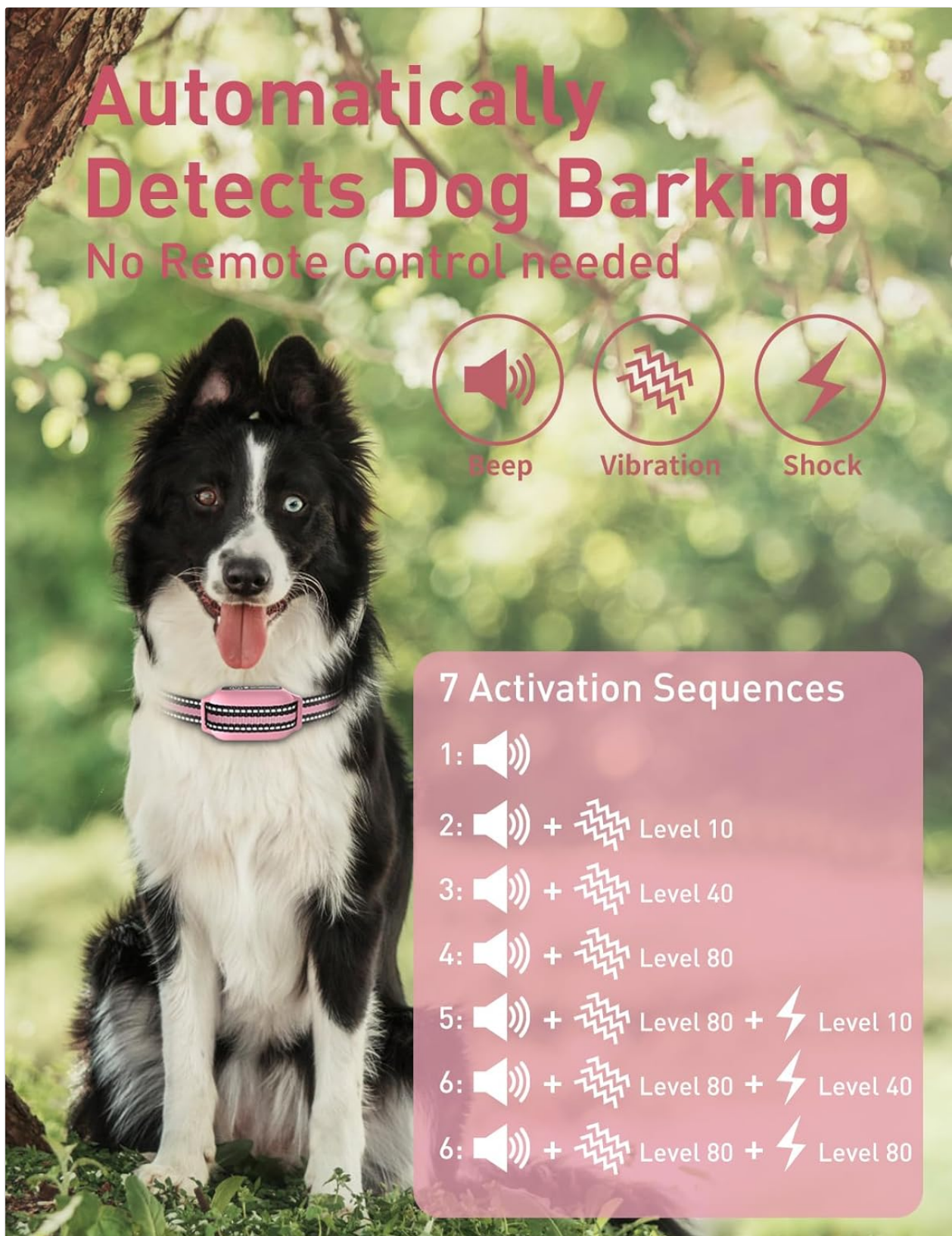
Image: A dog wearing the collar, illustrating how it automatically detects barking and the sequence of corrective actions (Beep, Vibration, Shock) with increasing intensity.