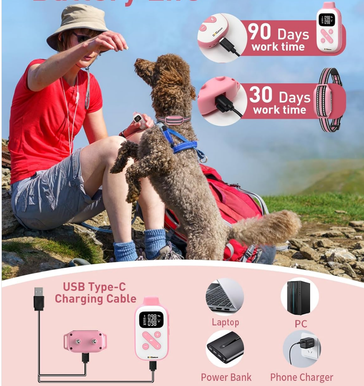
Image: Visual representation of the long battery life for both the remote (30 days) and receiver (90 days), along with various USB-C charging options.