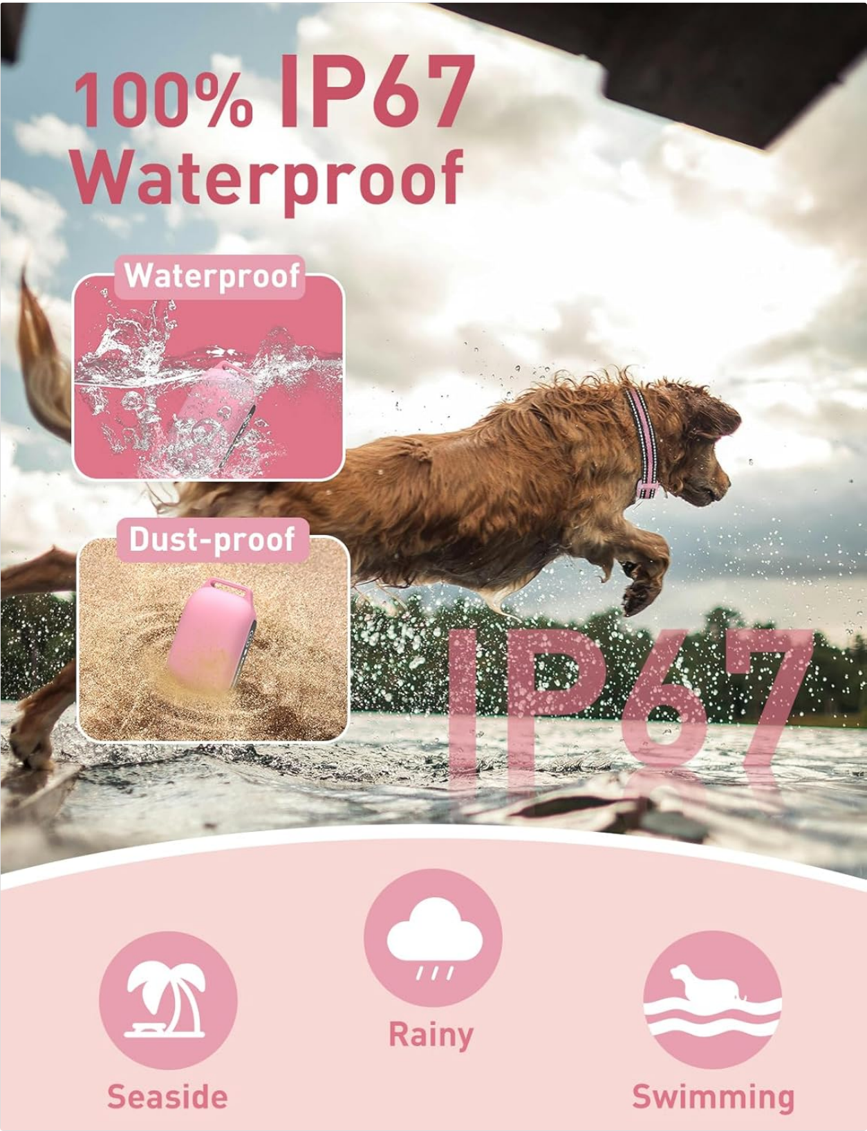
Image: The collar receiver submerged in water and covered in sand, demonstrating its IP67 waterproof and dust-proof capabilities for use in various outdoor settings.