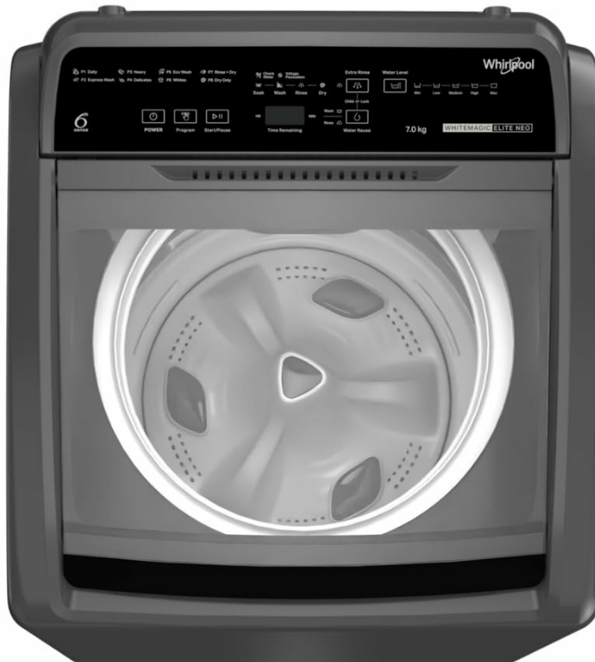
Image: Top view of the washing machine with the lid open, providing a clear view of the control panel and the stainless steel wash tub.