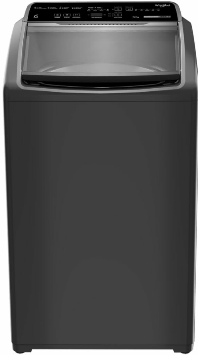
Image: Front view of the Whirlpool Whitemagic Elite 7kg washing machine, showcasing its sleek grey design and top-load access.