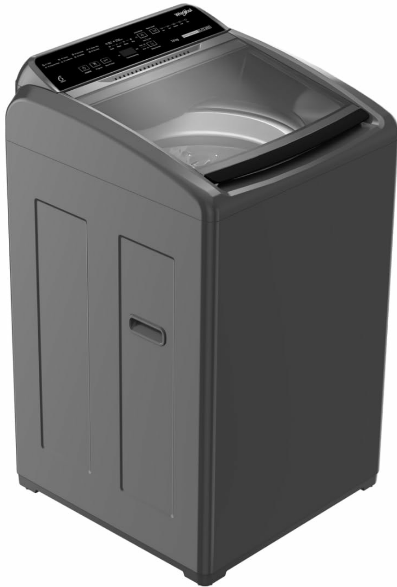
Image: Angled view of the washing machine from the front-right, highlighting its compact footprint and modern aesthetic.