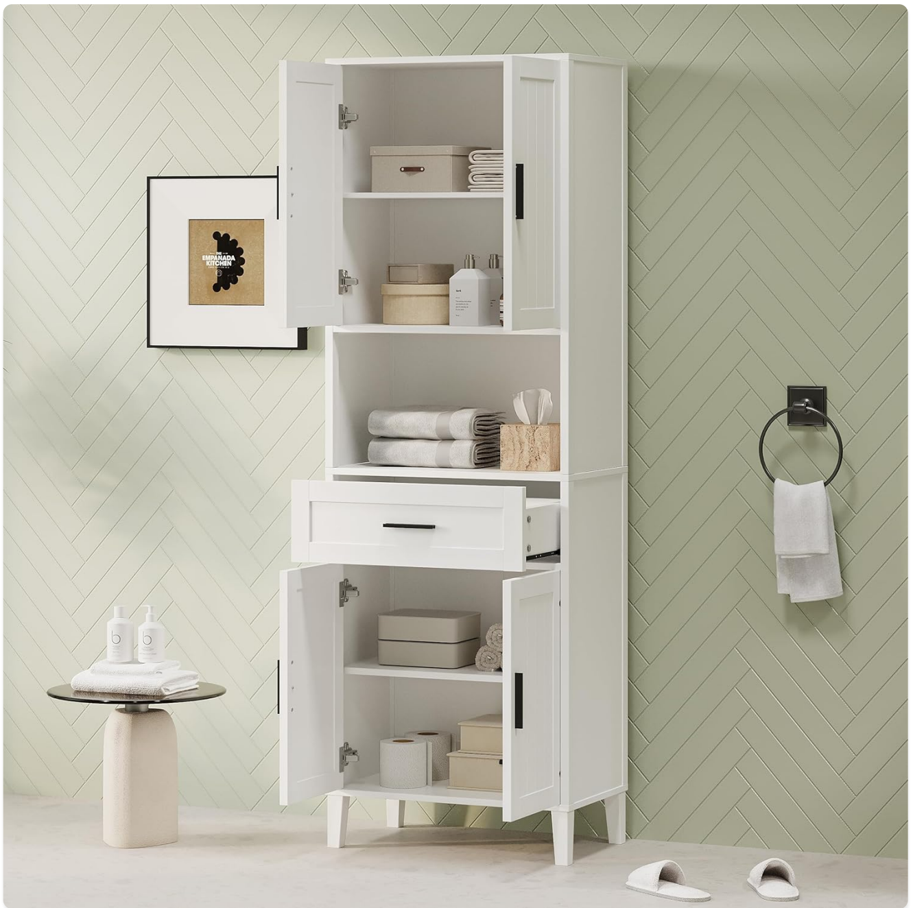
Figure 4.3: The cabinet with doors open, demonstrating its internal storage capacity and organization.