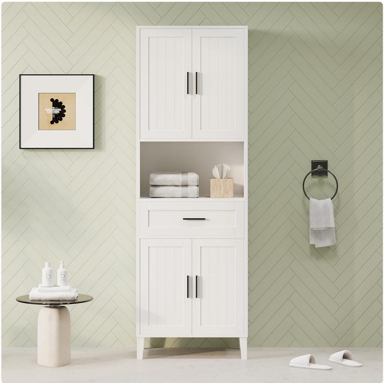
Figure 1.1: The ALYIAMXL 70.9" Freestanding Tall Bathroom Cabinet in a typical bathroom setting, showcasing its design and storage capabilities.