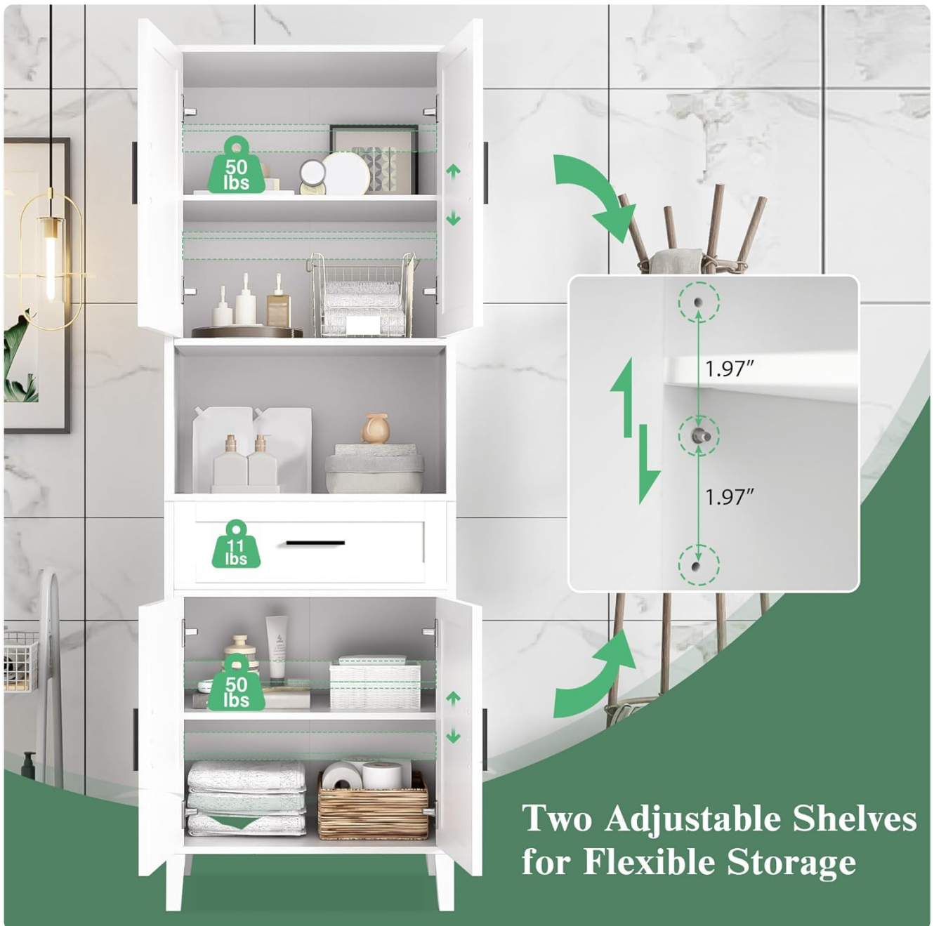
Figure 4.2: Illustration of adjustable shelves and their weight capacities.