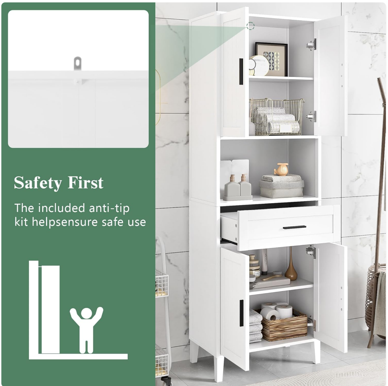
Figure 2.1: Importance of installing anti-tip hardware for stability and safety.