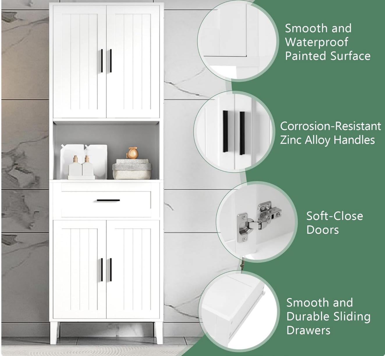
Figure 5.1: Features contributing to the cabinet's durability and ease of maintenance.