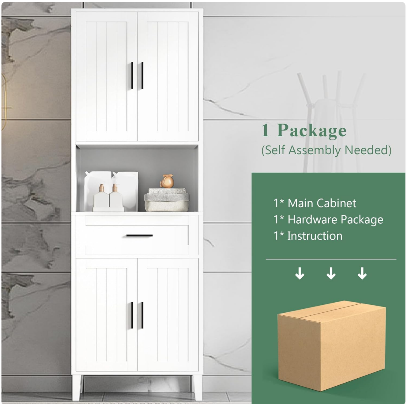
Figure 3.1: Contents included in the product package for assembly.