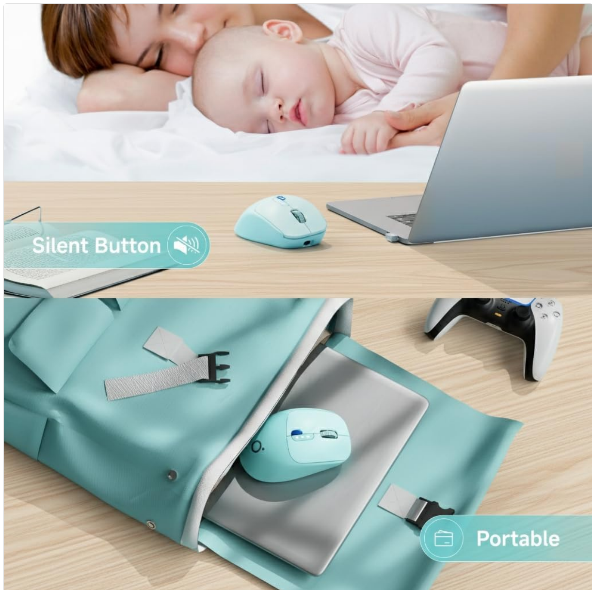
Image: EWEADN Q5 Wireless Mouse highlighting its silent button feature and portable design, shown fitting into a bag.