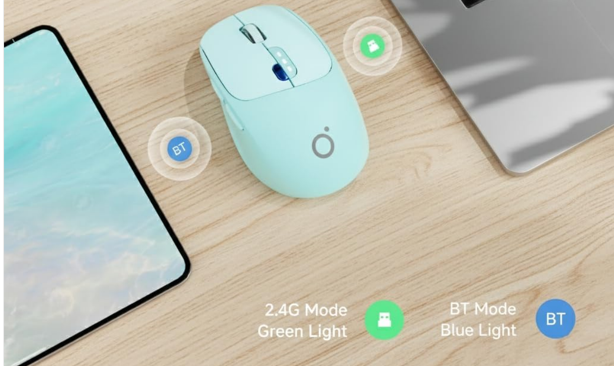
Image: EWEADN Q5 Wireless Mouse with the 2.4G USB receiver removed from its storage slot, demonstrating the 2.4G mode (green light) and Bluetooth mode (blue light) options.

NOTE : Press and hold the scroll wheel button for more than three seconds until the indicator light turns blue to switch to BT mode