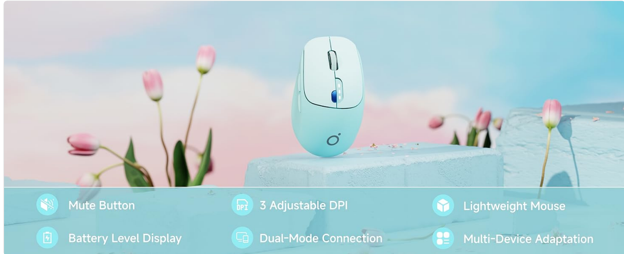
Image: EWEADN Q5 Wireless Mouse showing mute button, 3 adjustable DPI, lightweight design, battery level display, dual-mode connection, and multi-device adaptation.

Familiarize yourself with the components of your EWEADN Q5 Wireless Mouse: