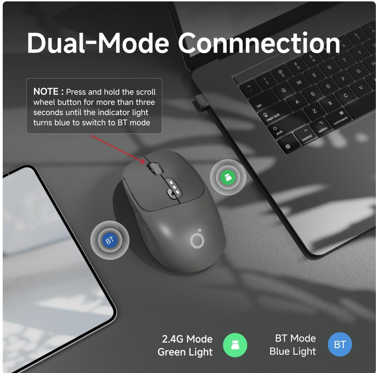
Figure 3: Visual guide for switching between 2.4G and Bluetooth modes.

Your browser does not support the video tag.