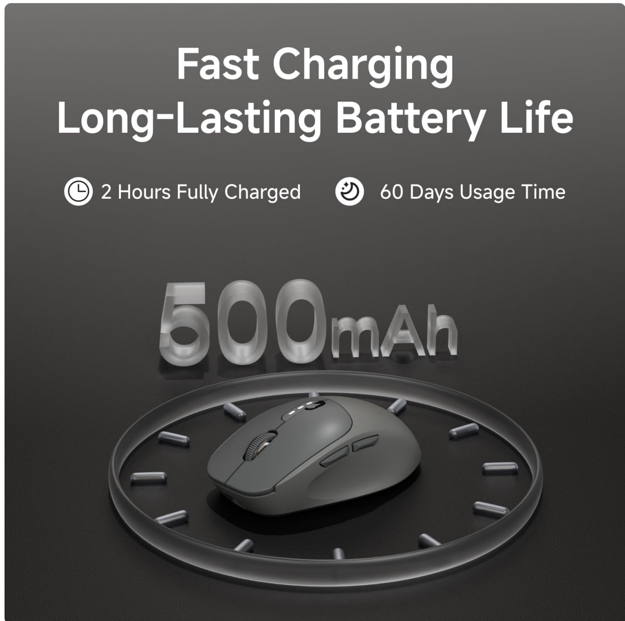
Figure 2: Charging and battery life information.