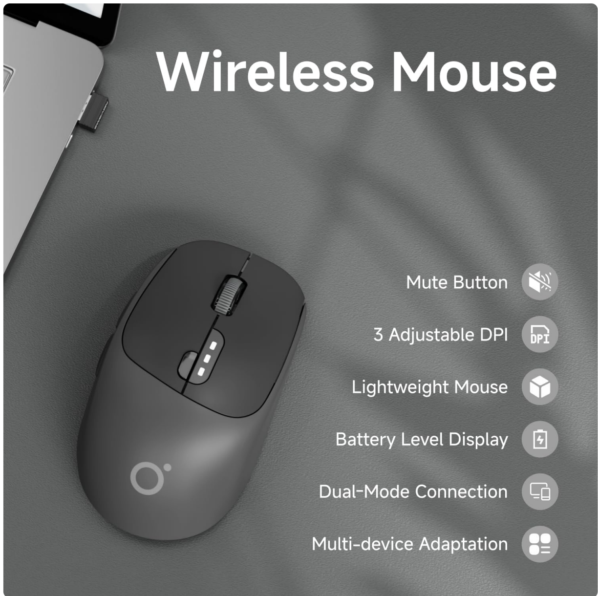
Figure 1: Key features of the EWEADN Q5 Wireless Mouse.