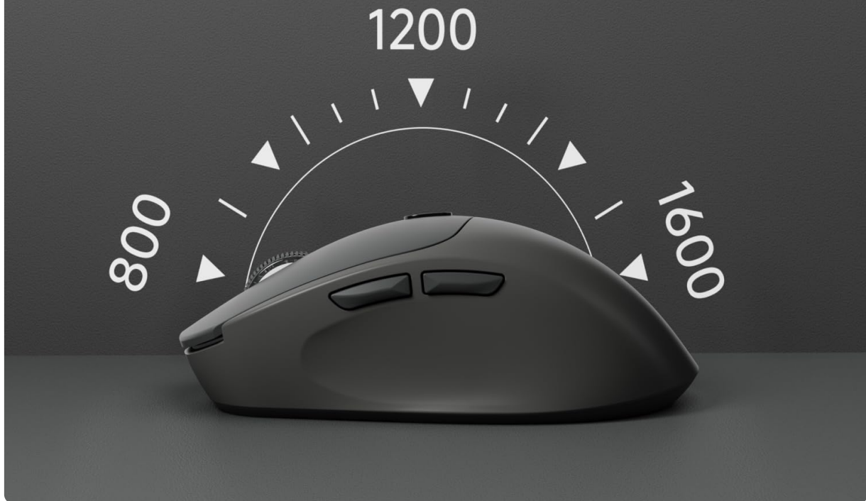
Figure 5: DPI adjustment settings.