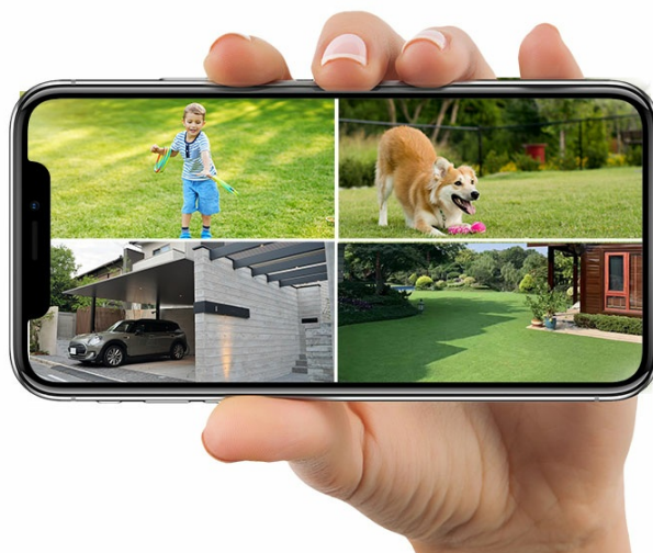
Image: Dual storage options for your recordings.