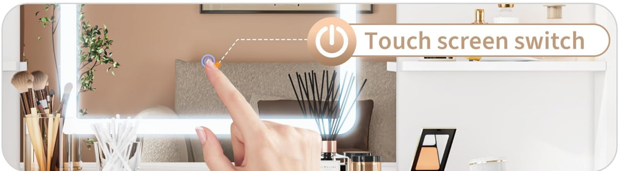
Image: LED mirror demonstrating different lighting modes.