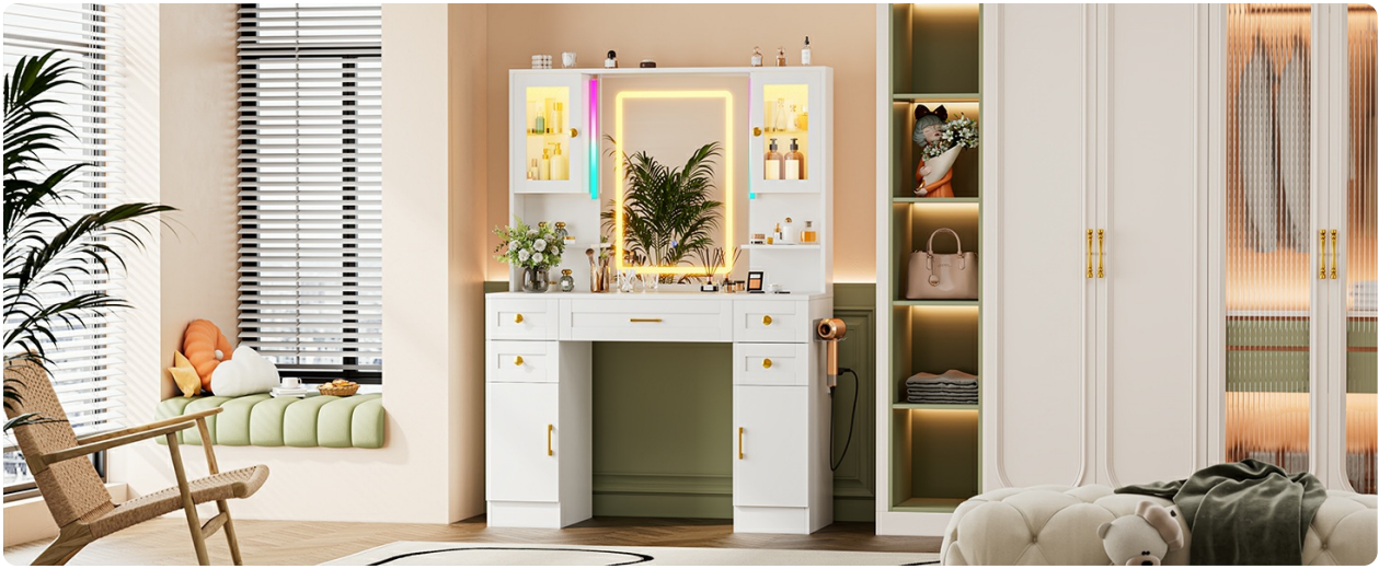
Image: RGB ambient lighting in the vanity cabinets.