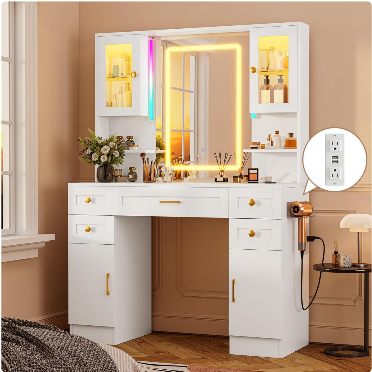
Image: Fully assembled KAMABOKO 049 White Vanity Desk.