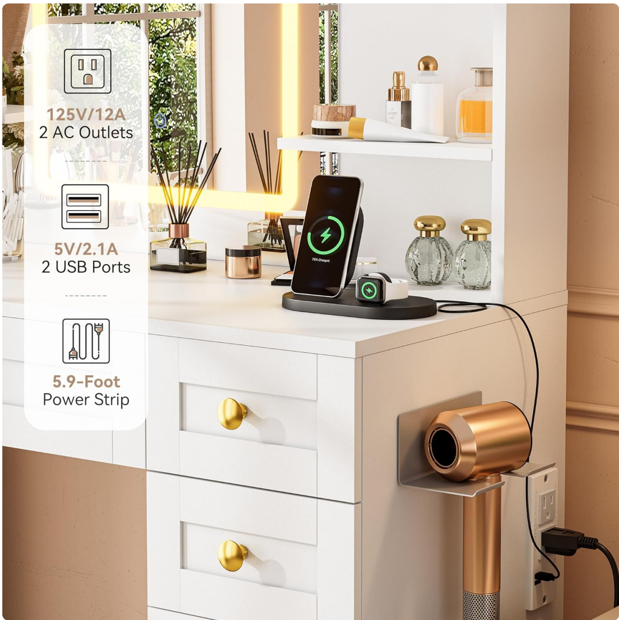
Image: Detail of the charging station and hair dryer rack.