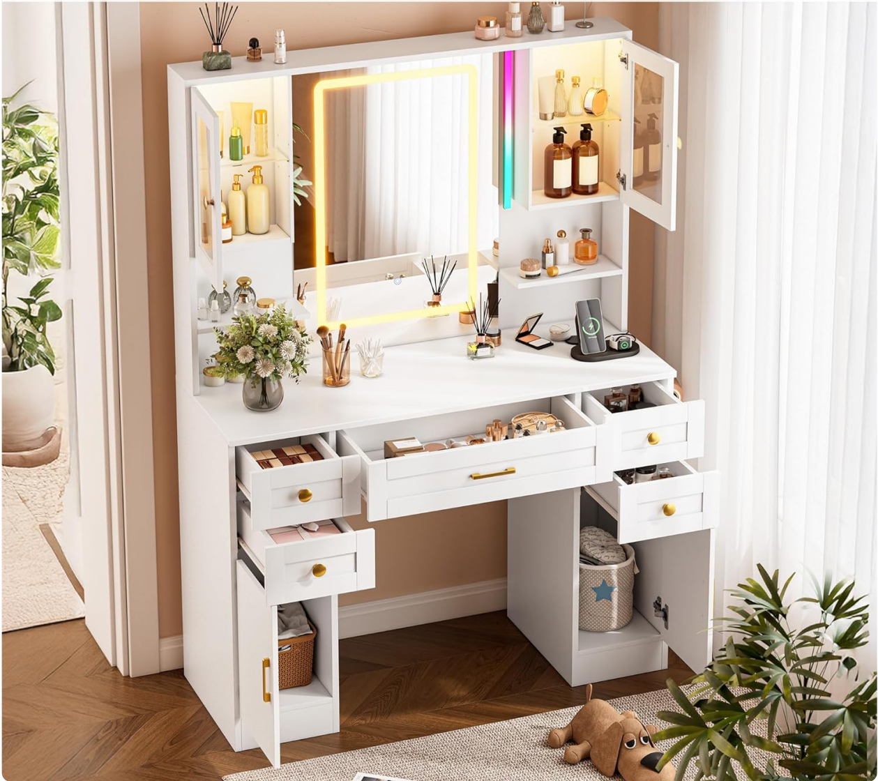
Image: Overview of the vanity desk's storage compartments.