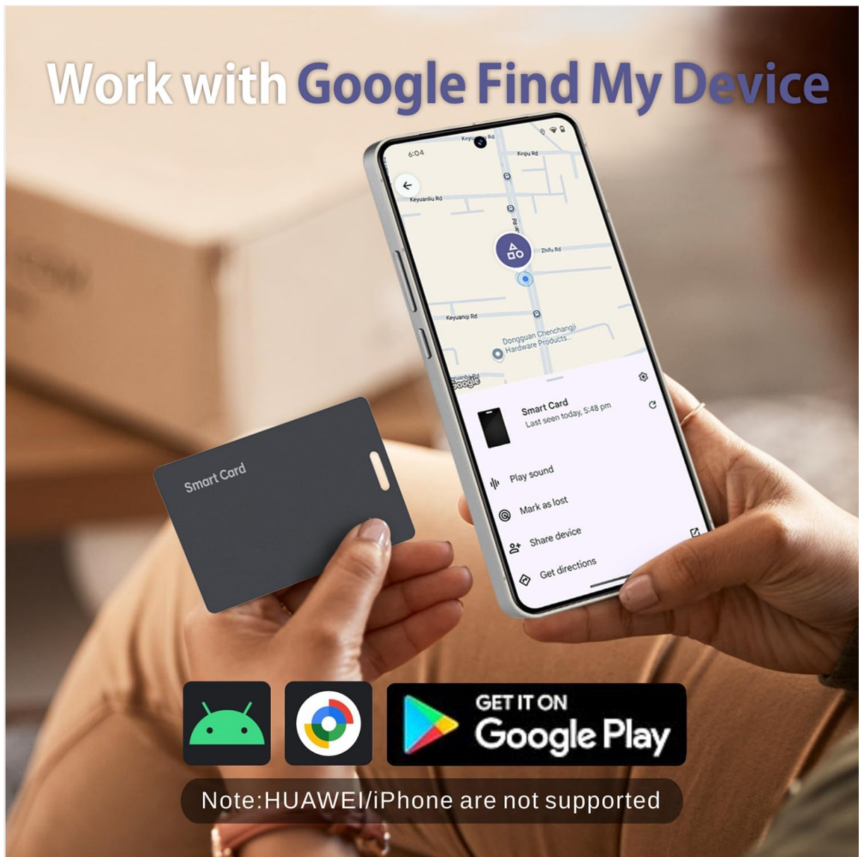
Image: Reyke Wallet Tracker Card working with Google Find My Device on an Android phone.