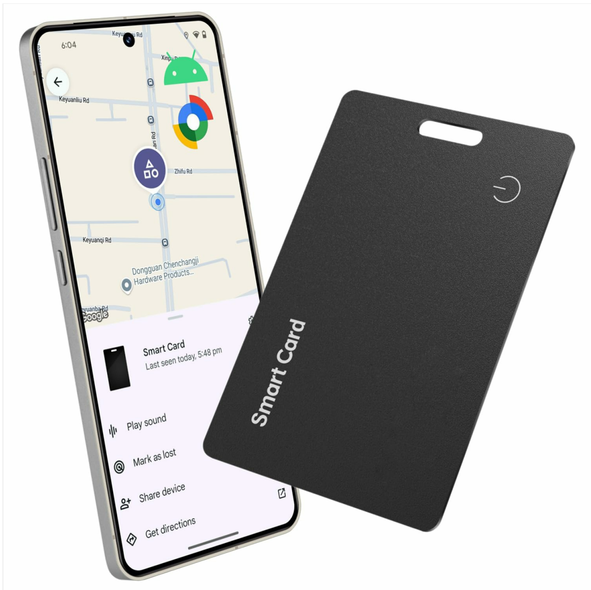
Image: Reyke Wallet Tracker Card.