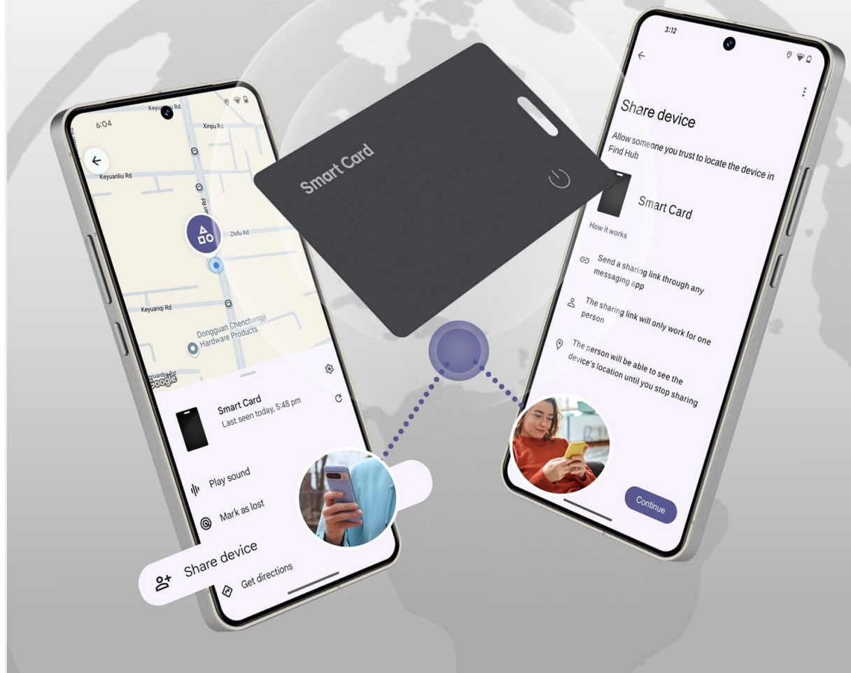
Image: Sharing the Reyke Smart Card's location with another user via the Find Hub app.