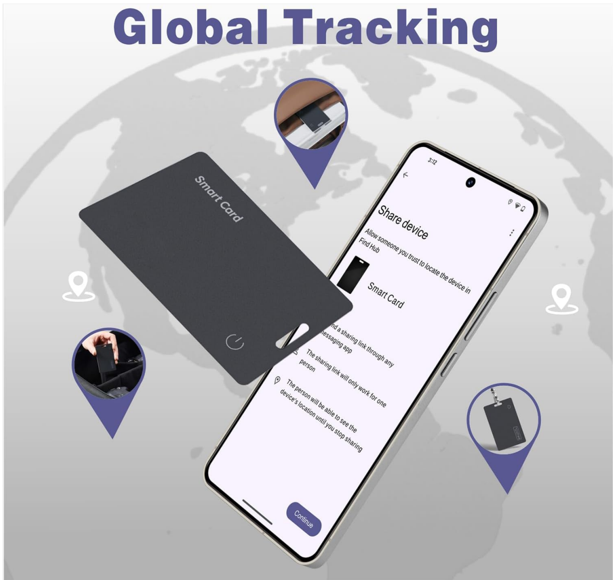
Image: Examples of how the Reyke Smart Card can be used to track various personal items.