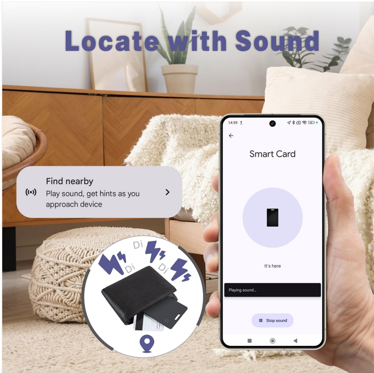
Image: Using the 'Play sound' feature in the Google Find Hub app to locate the tracker card.