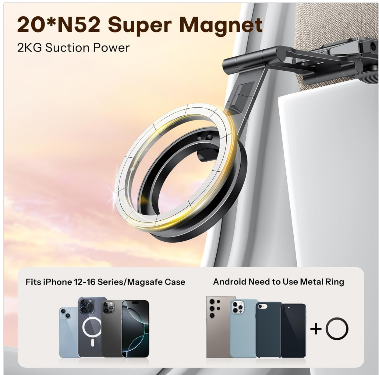
Image: Demonstrates the strong magnetic attachment and compatibility with both MagSafe and non-MagSafe devices using the included metal ring.