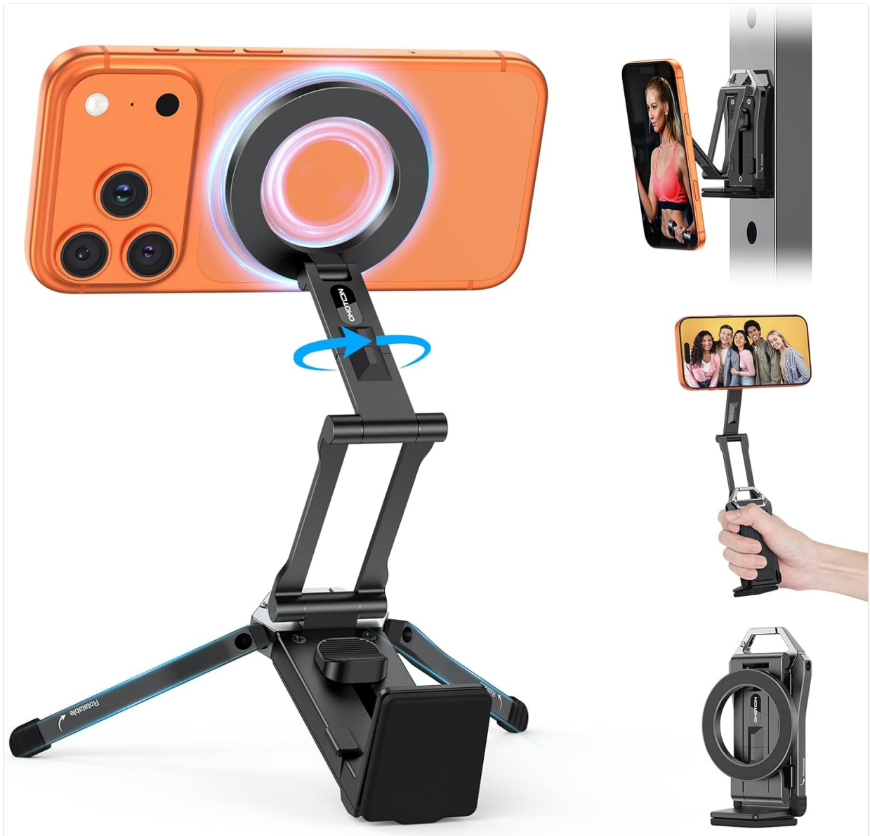
Image: Shows the tripod in its fully extended and folded states, illustrating its versatility.