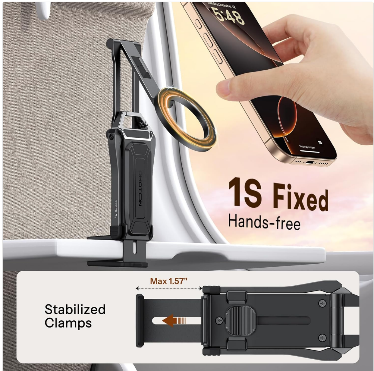
Image: Close-up of the stabilized clamp mechanism, showing its ability to grip surfaces up to 1.57 inches.