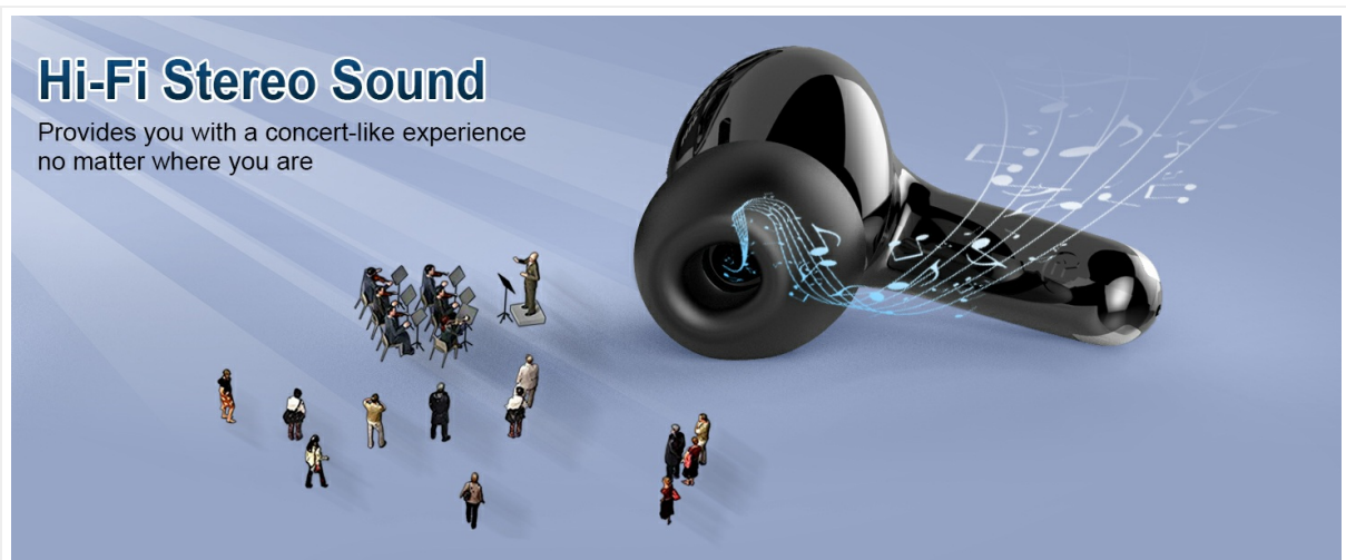
Image: Illustration of a 14.2mm dynamic driver for premium Hi-Fi stereo sound with deep bass.