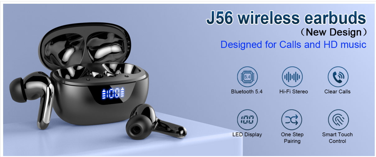
Image: Diagram illustrating Enhanced Bluetooth 5.4 technology with increased connection range, stable connection, and transfer speed.