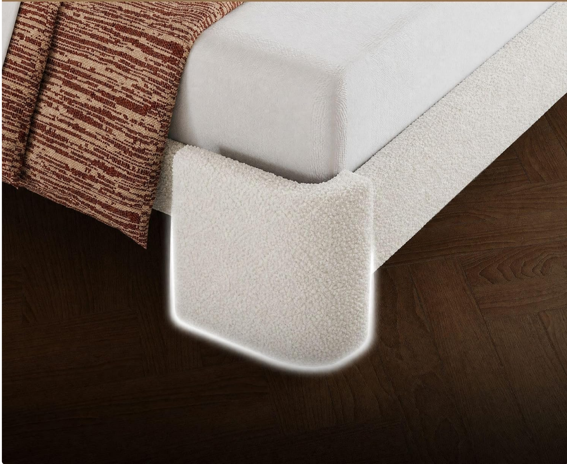
Image: Easy Assembly. The wooden slats connect without screws, simplifying the setup process.

The bed frame features a sturdy metal structure with wooden slats that are designed for silent support. The slats are often pre-connected with Velcro for easier installation.