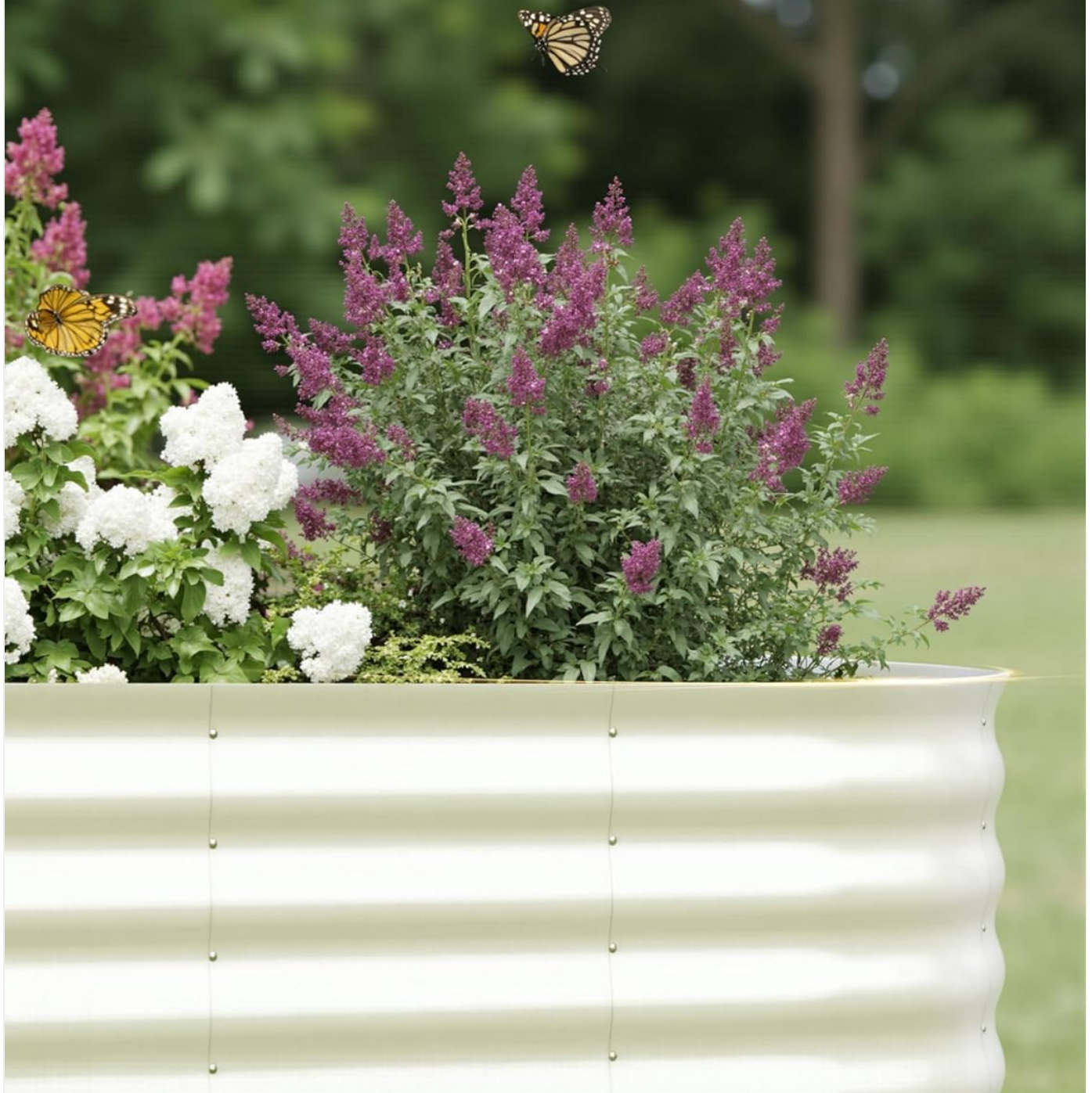
Image Description: A close-up view of the Garvee raised garden bed's side panel, emphasizing its 'Premium Metal' construction and stating a '0.6mm Thickness for Decades of Use.' This image highlights the quality of the material.