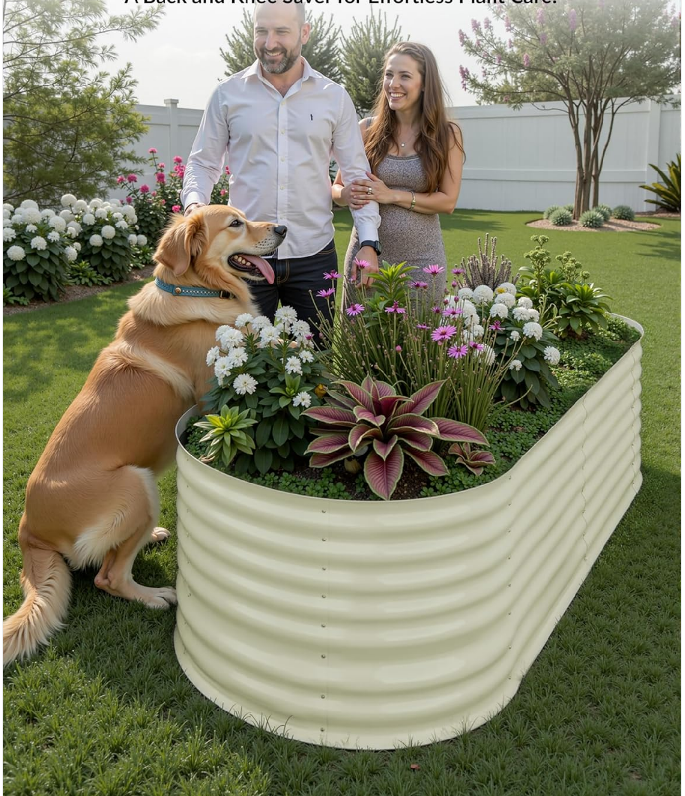
Image Description: A fully assembled Garvee raised garden bed, 2 feet in height, filled with various flowering plants and greenery. A person and a dog are standing next to it, demonstrating the comfortable working height of the bed for gardening activities.

A Back and Knee Saver for Effortless Plant Care!