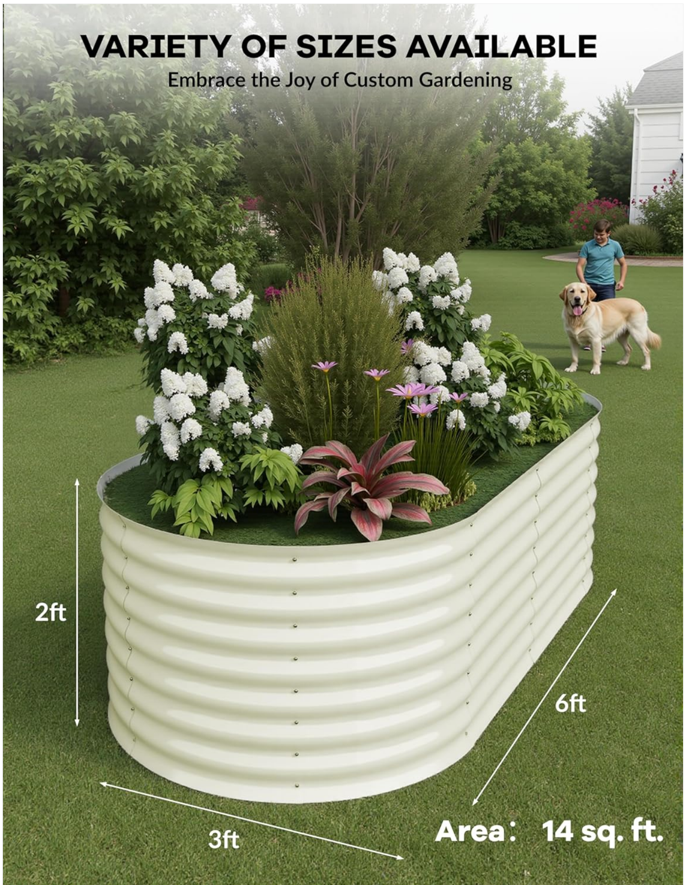
Image Description: An overhead view of a Garvee raised garden bed, illustrating its dimensions. Labels indicate a length of 6 feet, a width of 3 feet, a height of 2 feet, and a total area of 14 square feet. This image helps visualize the size of the assembled product.