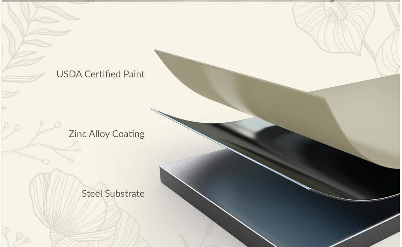
Image Description: An illustration detailing the internal structure of the raised garden bed, showing bracing bars for stability and a cross-section of the material layers: Steel Substrate, Zinc Alloy Coating, and USDA Certified Paint. This image highlights the components contributing to the bed's strength and durability.