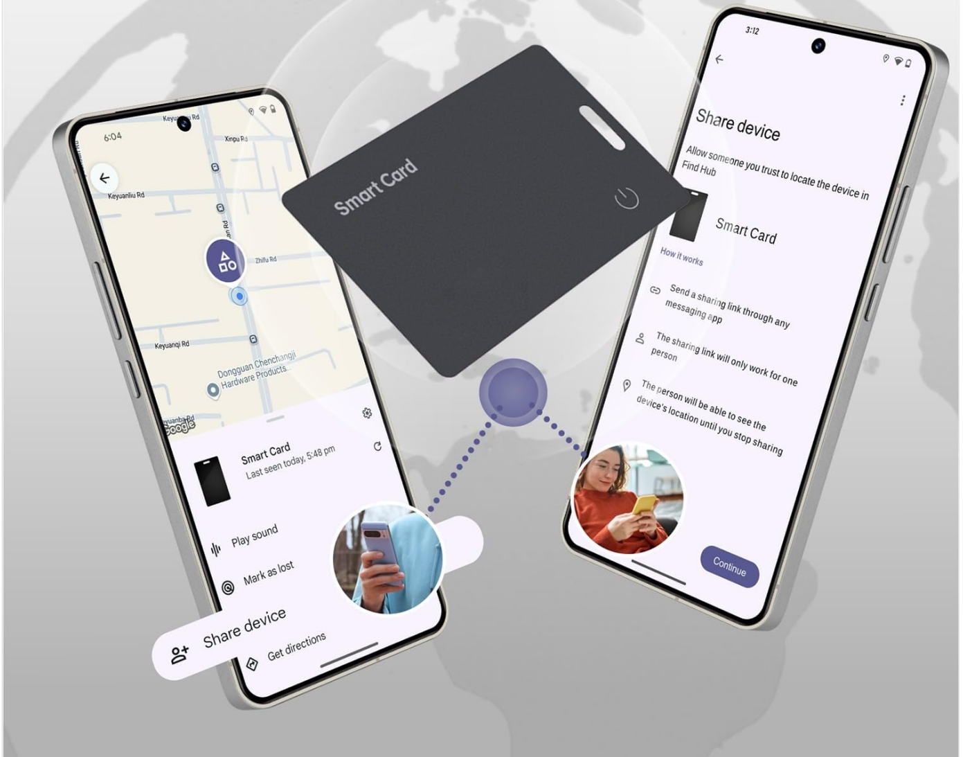
Image: The "Share the Card location" feature demonstrated across two smartphones, illustrating how to share tracking access with family or friends.