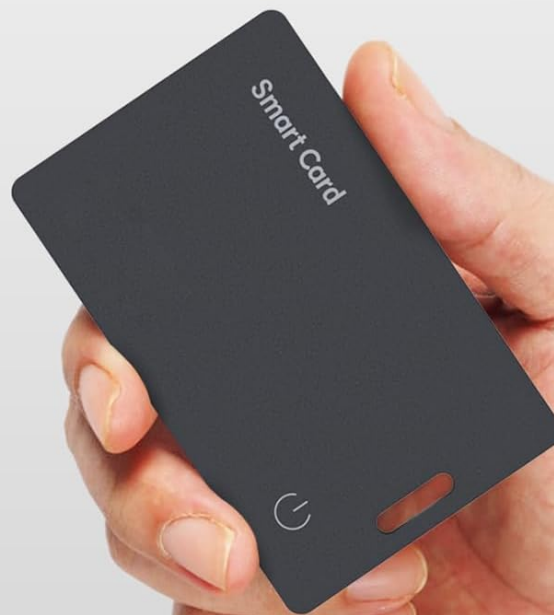
Image: The Reyke Slim Wallet Tracker Card showcasing its ultra-thin profile and key specifications like sound level, waterproofing, Bluetooth range, and wireless charging capability.