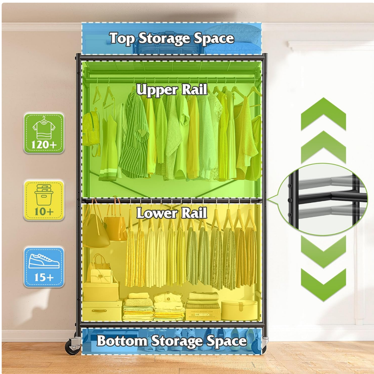
Image: Close-up details of the X-brace design for stability, thickened hanging rod for increased capacity, and the flexible option of replaceable universal wheels or adjustable feet.