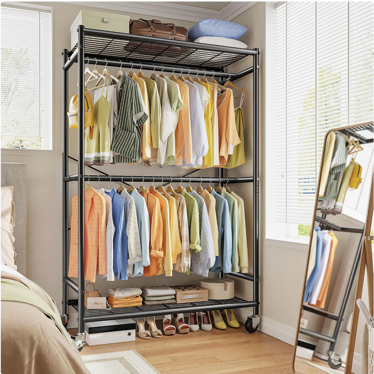
Image: The clothes rack positioned in a bedroom, showcasing its two-tier hanging capacity and top shelf storage.