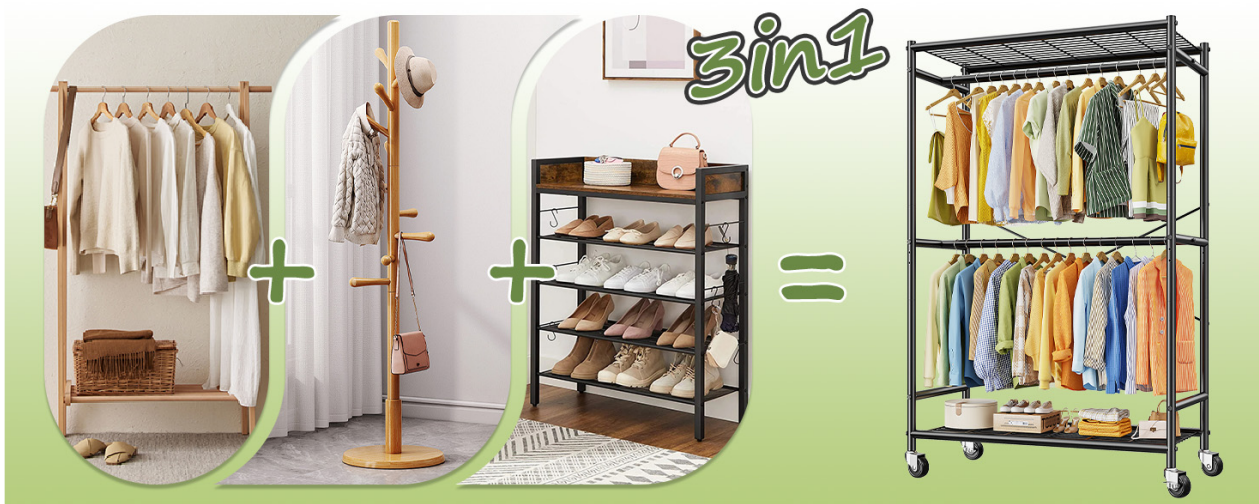
Image: The Raybee clothes rack shown in different environments, highlighting its adaptability for various scenes.

Thank you for choosing the Raybee 80.32" H Heavy Duty Rolling Clothes Rack. This manual provides detailed instructions for assembly, operation, and maintenance to ensure optimal use and longevity of your product. This versatile garment rack is designed for efficient clothing storage and organization in various settings, offering robust construction and convenient mobility.