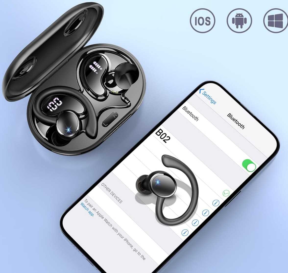
Image: A smartphone screen showing the Matast B02 Earbuds listed as an available Bluetooth device, demonstrating the one-step pairing process.