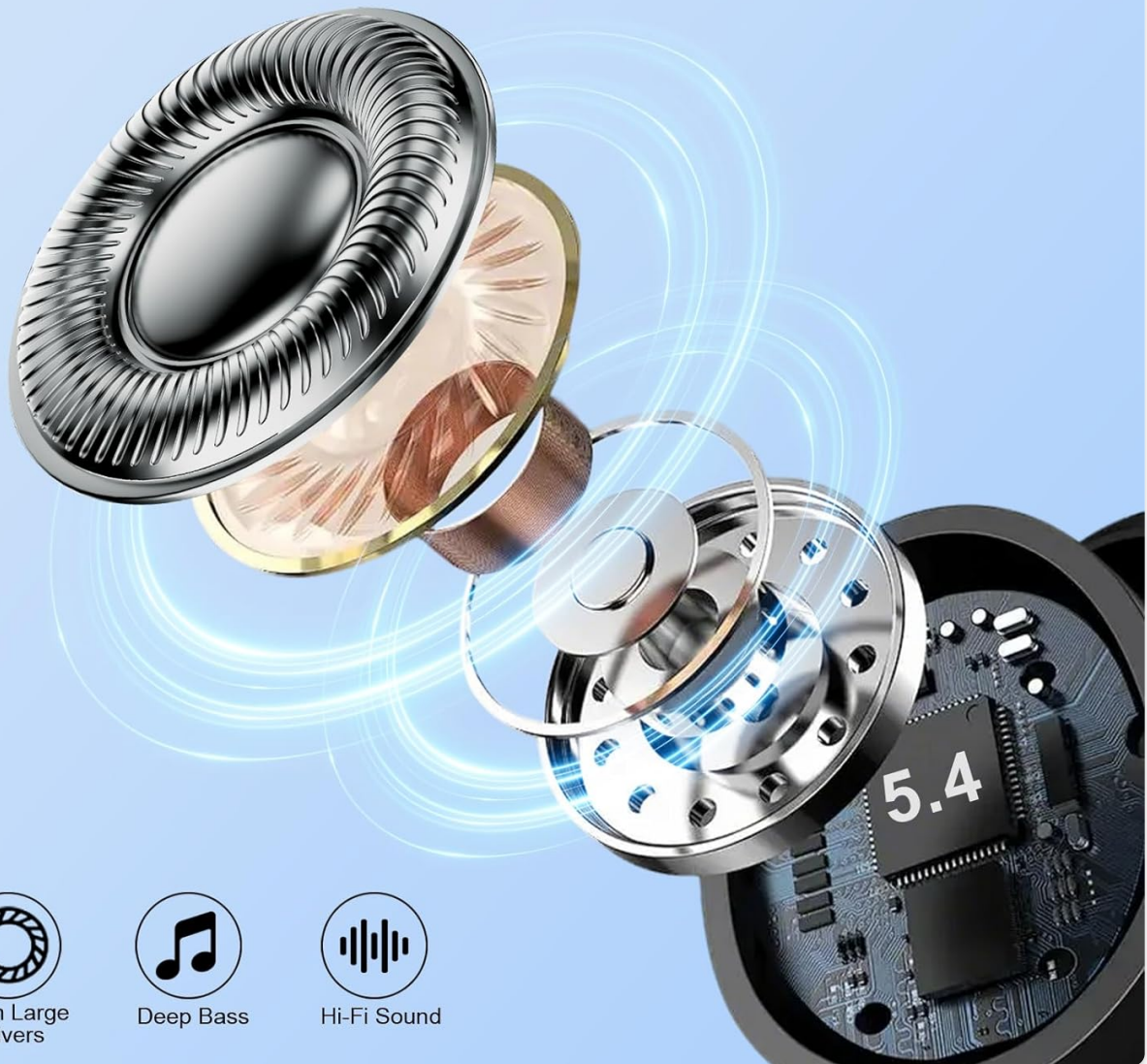
Image: An exploded view diagram illustrating the 13mm dynamic drivers and internal structure responsible for HiFi stereo sound in the Matast B02 Earbuds.