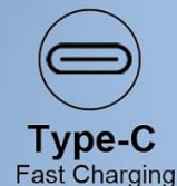
Image: The Matast B02 Earbuds and charging case, highlighting the 50-hour total battery life and 10-hour single charge capability, along with the Type-C fast charging port.