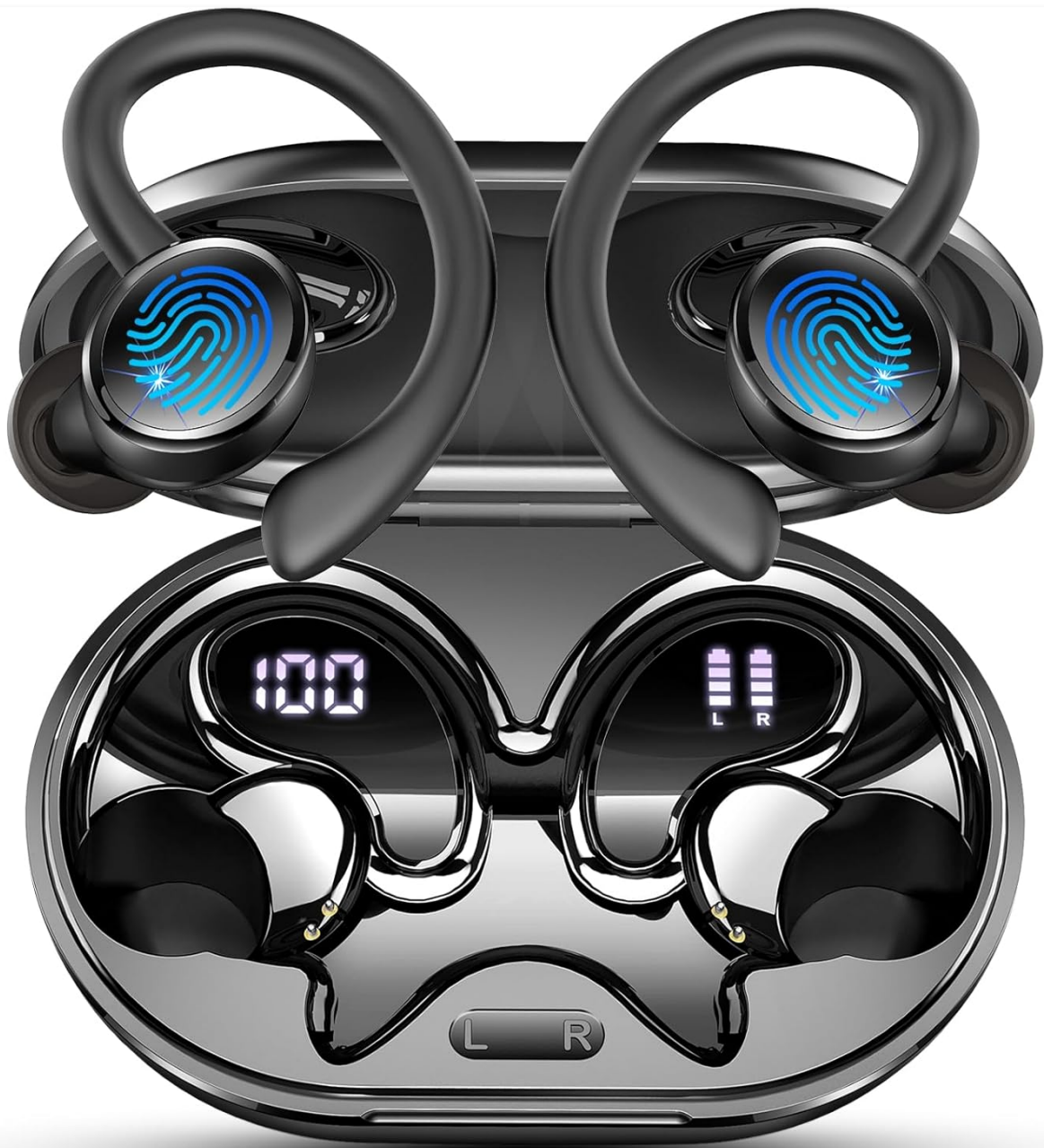
Image: The Matast B02 Bluetooth 5.4 Sport Earbuds in their charging case, showcasing the LED battery display.