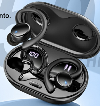
Image: A visual representation of all items included in the Matast B02 Earbuds package, laid out neatly.

Display di potenza degli auricolari (L / R)