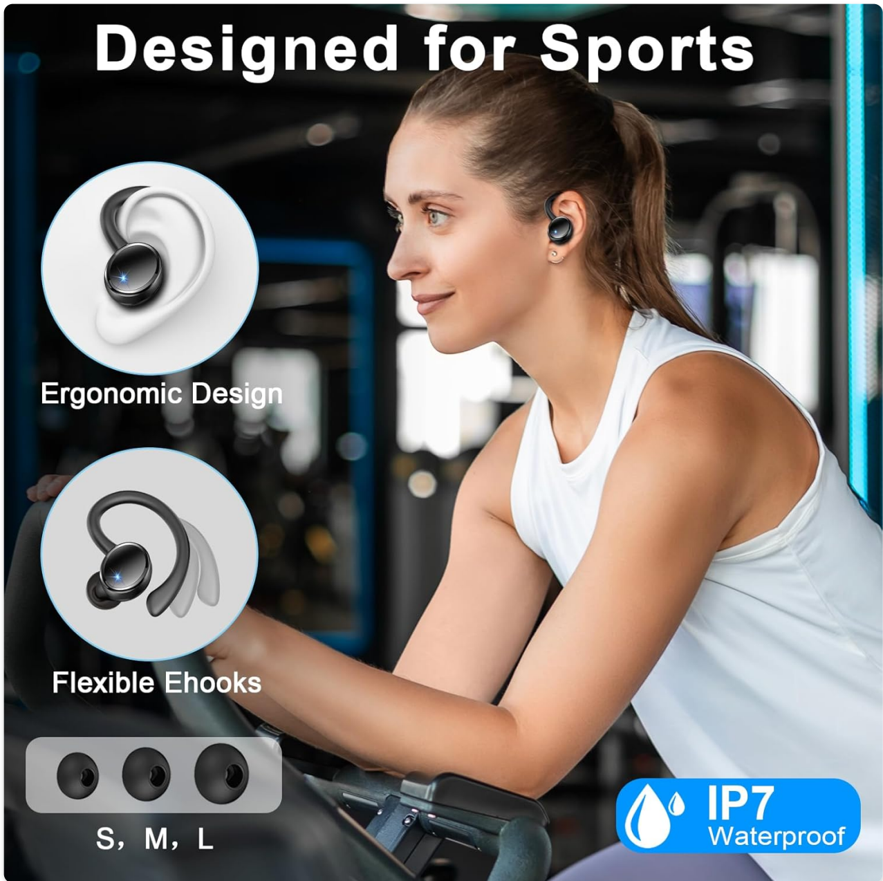
Image: A visual guide demonstrating the ergonomic design of the Matast B02 Earbuds, showing how they fit securely with flexible ear hooks and different ear tip sizes.