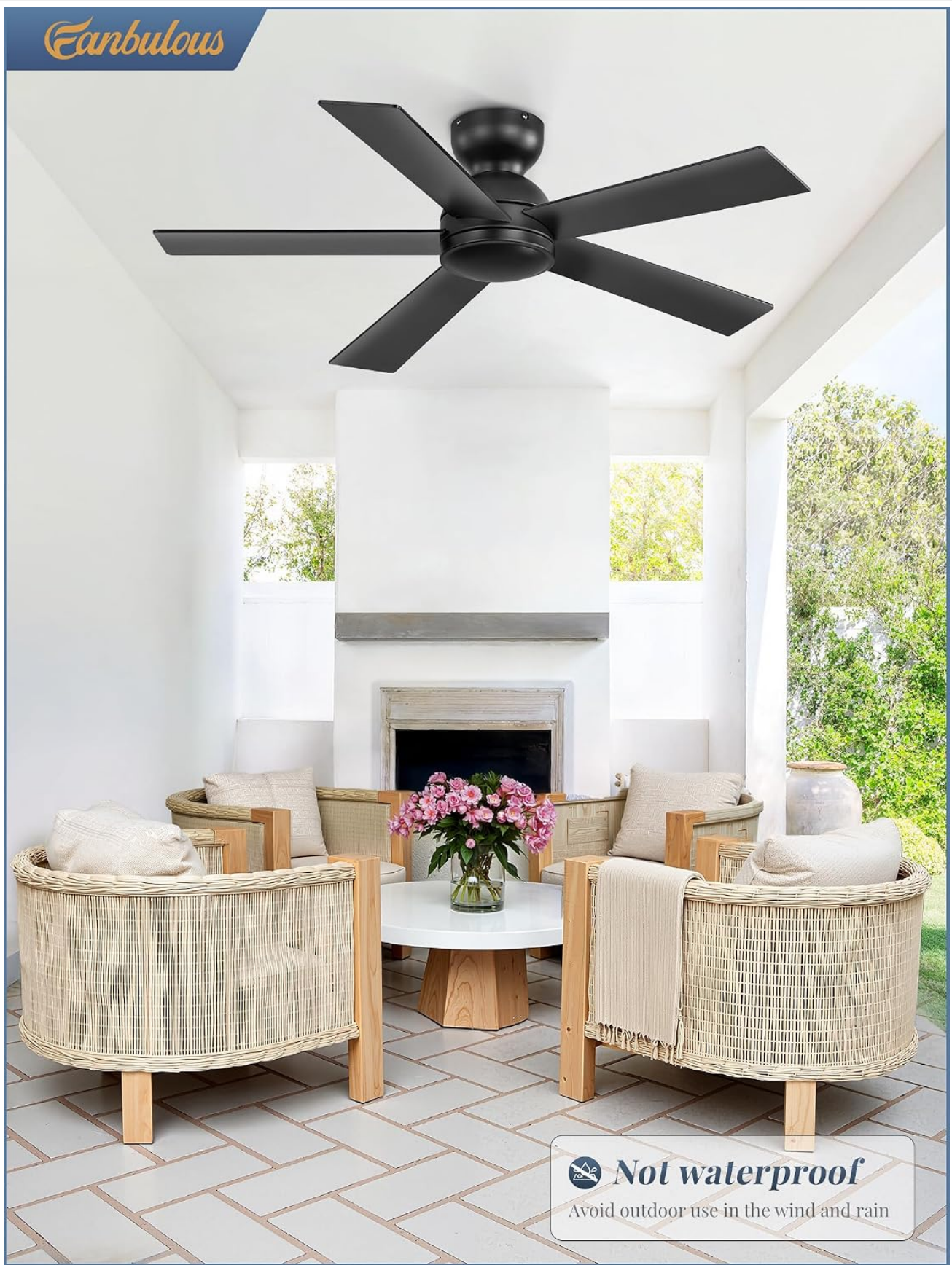
Figure 8.2: Fan installed in an outdoor patio setting, with a note about water exposure.