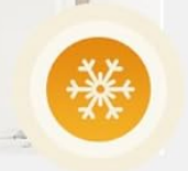
Figure 5.3: Reversible function for seasonal use.