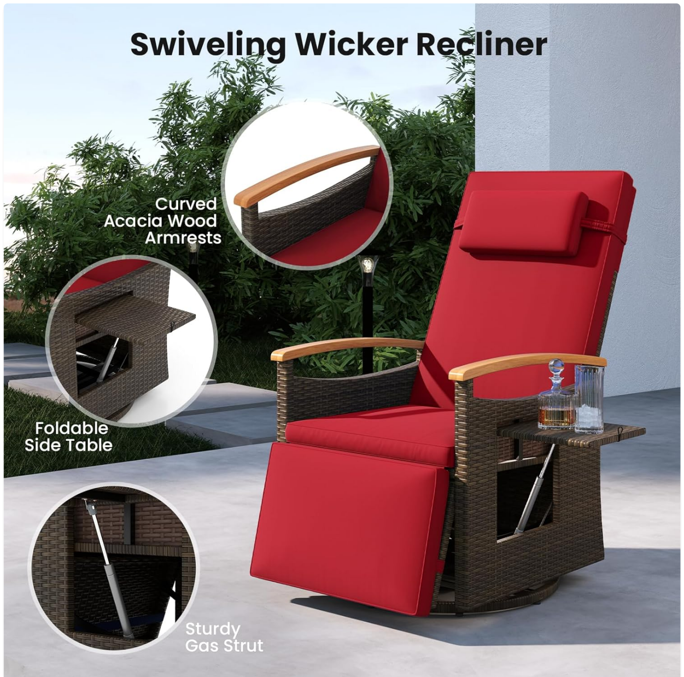
Image: Detailed view of the chair's features, including the curved acacia wood armrests, the functional flip-up side table, and the gas strut for smooth operation.