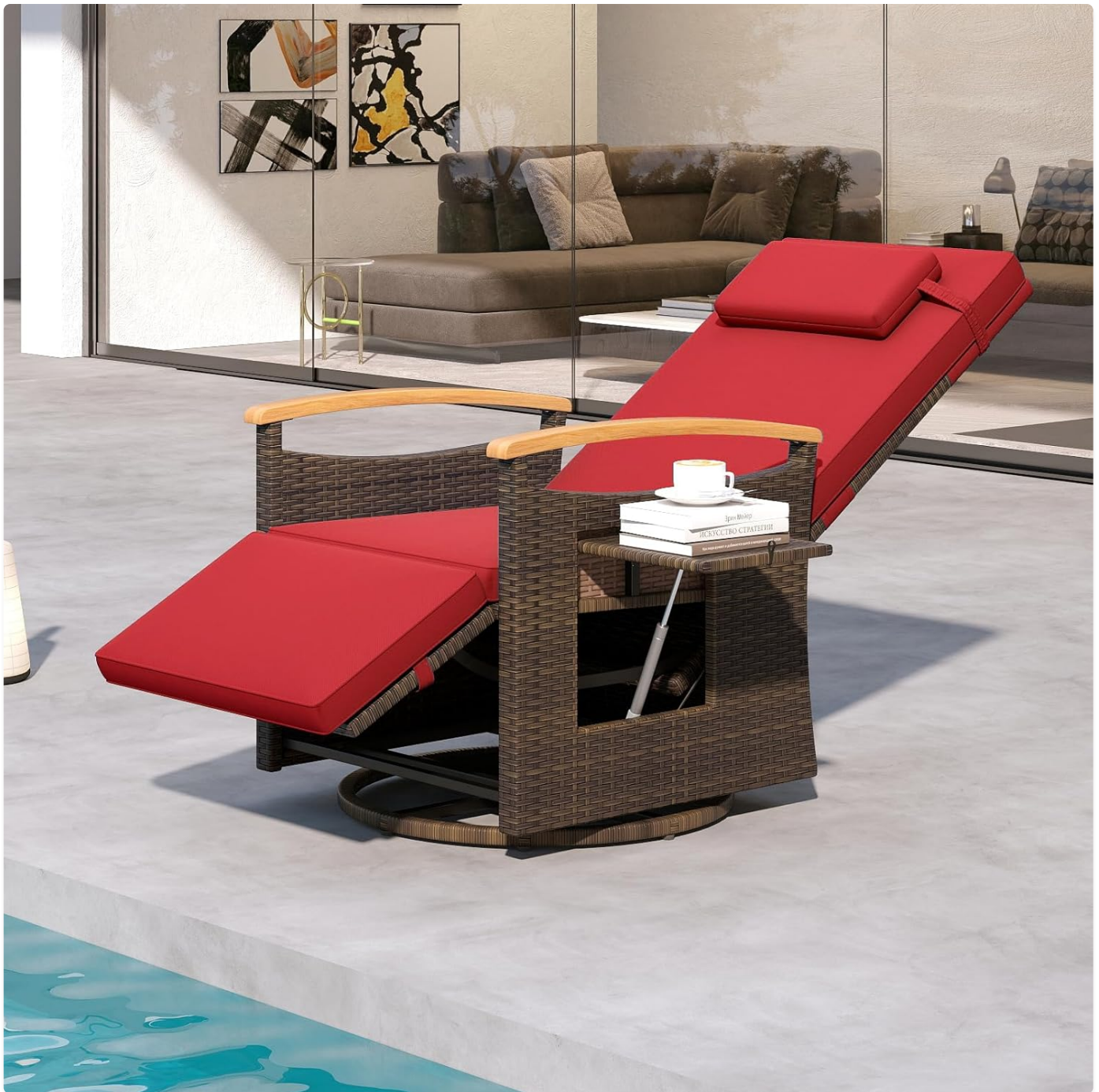
Image: The RELAX4LIFE Swivel Outdoor Recliner Chair, showcasing its design and red cushions in an outdoor environment.