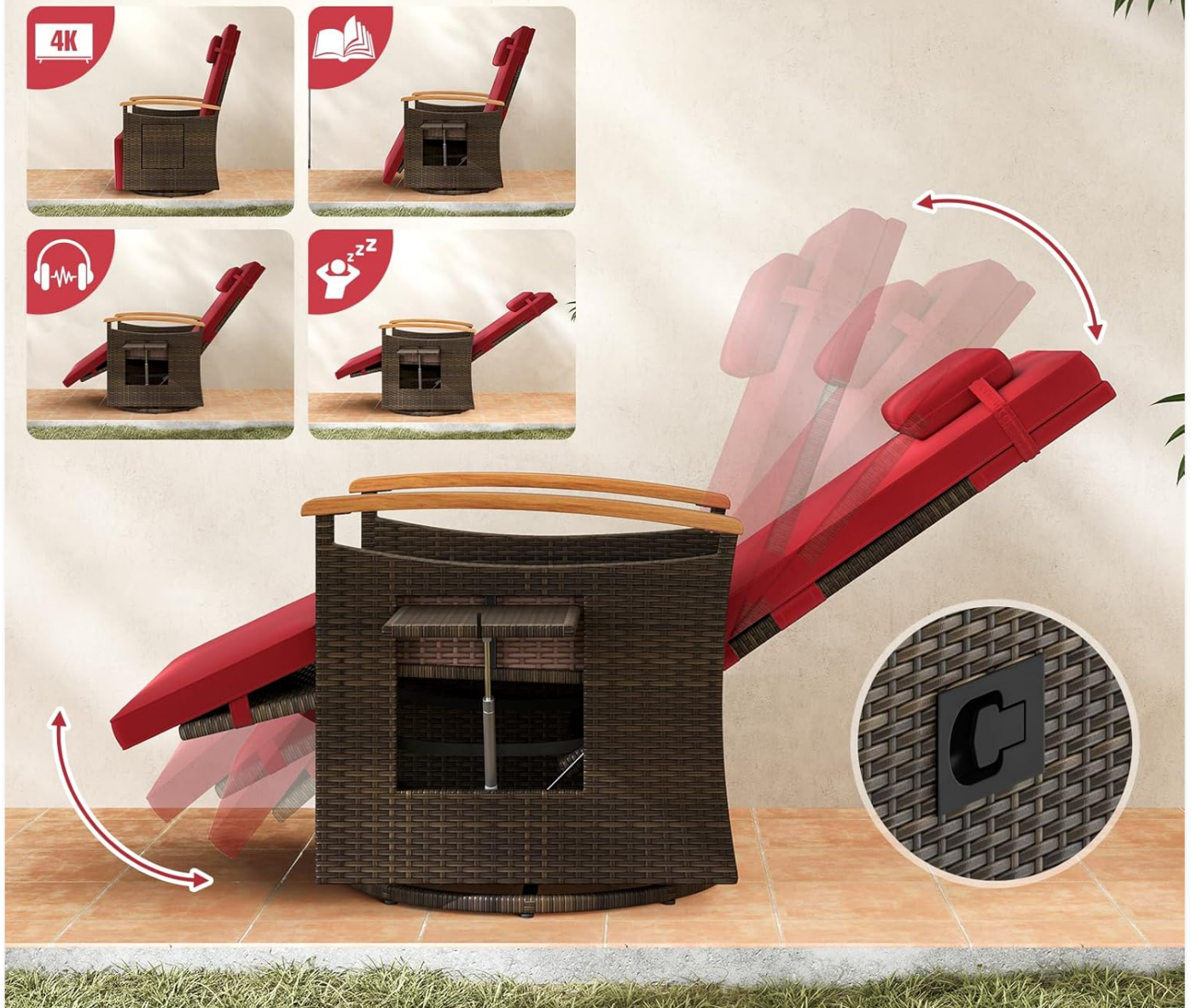
Image: Illustration of the 150° adjustable design, demonstrating various reclining angles for customized comfort.