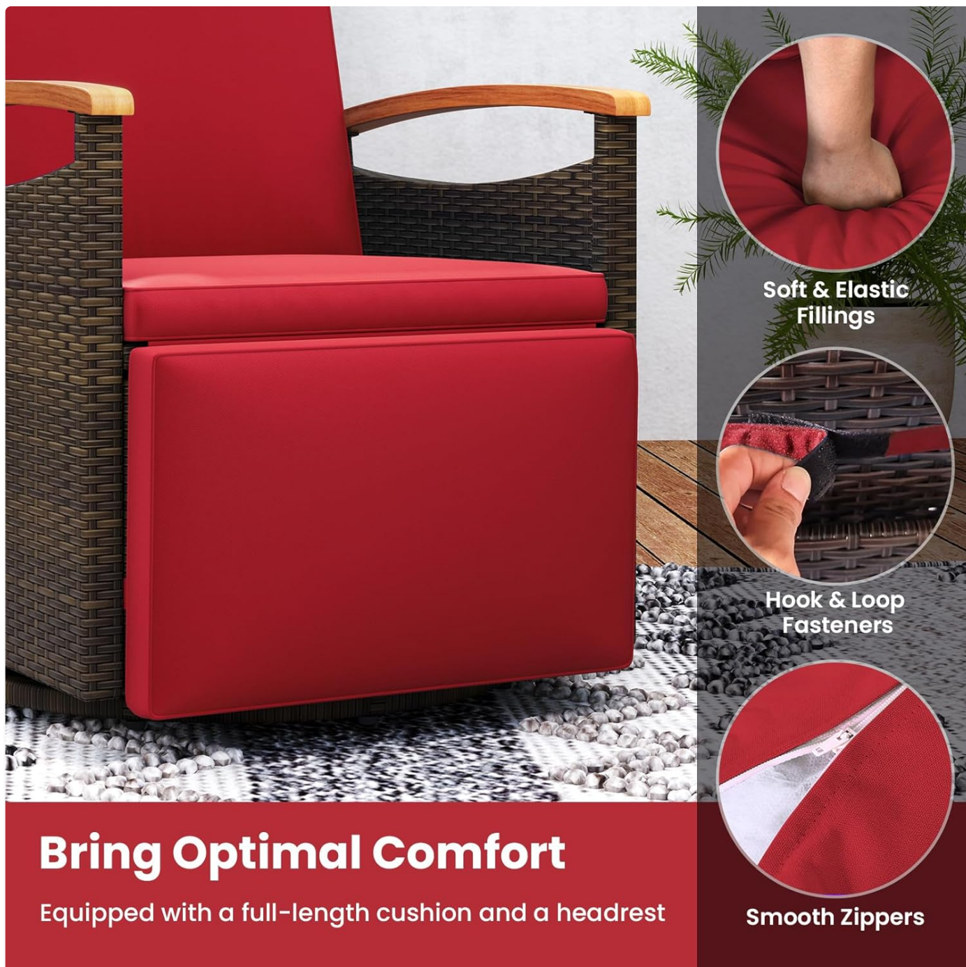
Image: The well-woven mix brown PE wicker, emphasizing its sunproof and anti-fading properties for long-lasting durability.