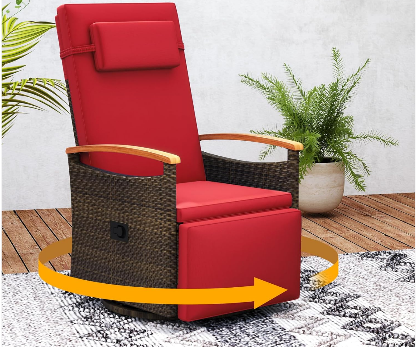
Image: The 360° smooth swiveling feature of the chair, perfect for social interaction or changing views.