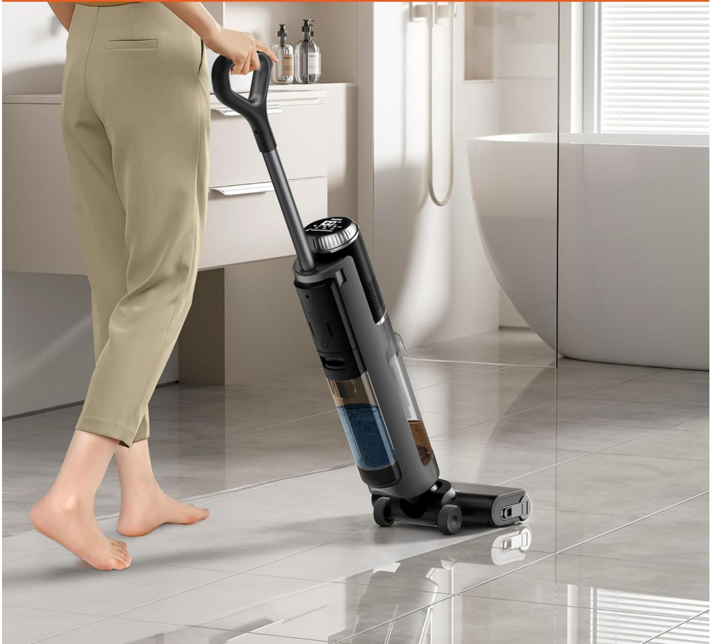
Figure 4.4: User operating IMAGIC M3 for fast, streak-free drying.

A person is shown operating the IMAGIC M3 on a tiled floor, emphasizing the vacuum's ability to leave surfaces dry and streak-free quickly after cleaning.