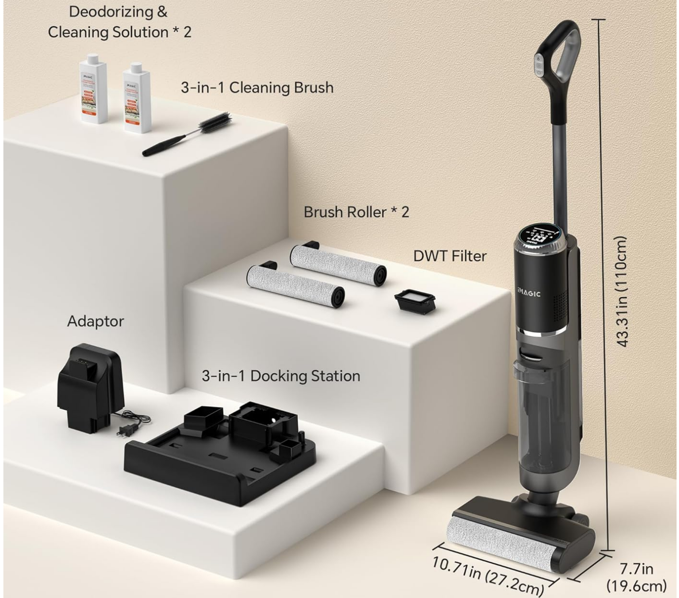
Figure 2.2: Contents of the IMAGIC M3 package.

This image details the items included in the IMAGIC M3 package: Deodorizing & Cleaning Solution (x2), 3-in-1 Cleaning Brush, Brush Roller (x2), DWT Filter, Adaptor, 3-in-1 Docking Station, and the main vacuum unit with its dimensions.