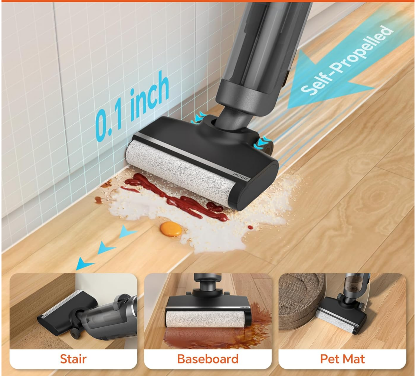
Figure 4.2: IMAGIC M3's edge cleaning capability.

This image demonstrates the IMAGIC M3's ability to clean close to edges, such as baseboards, with its brush roller reaching within 0.1 inch. It also shows its effectiveness for cleaning stairs and pet mats.