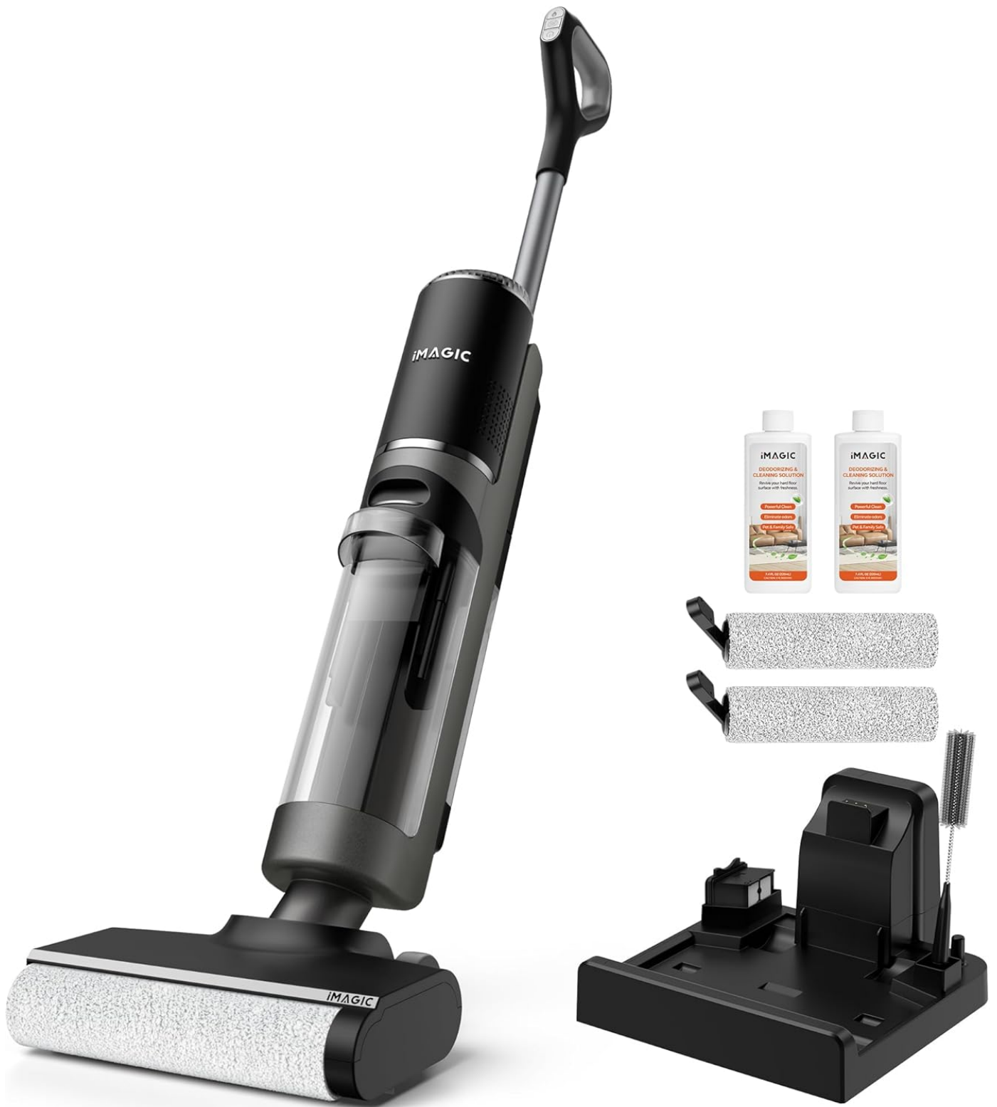
Figure 2.1: IMAGIC M3 Wet Dry Vacuum Cleaner with charging dock and accessories.

This image displays the main unit of the IMAGIC M3 Wet Dry Vacuum Cleaner, along with its charging dock, two bottles of cleaning solution, and two spare brush rollers. The vacuum features a sleek design with a clear dirty water tank visible.