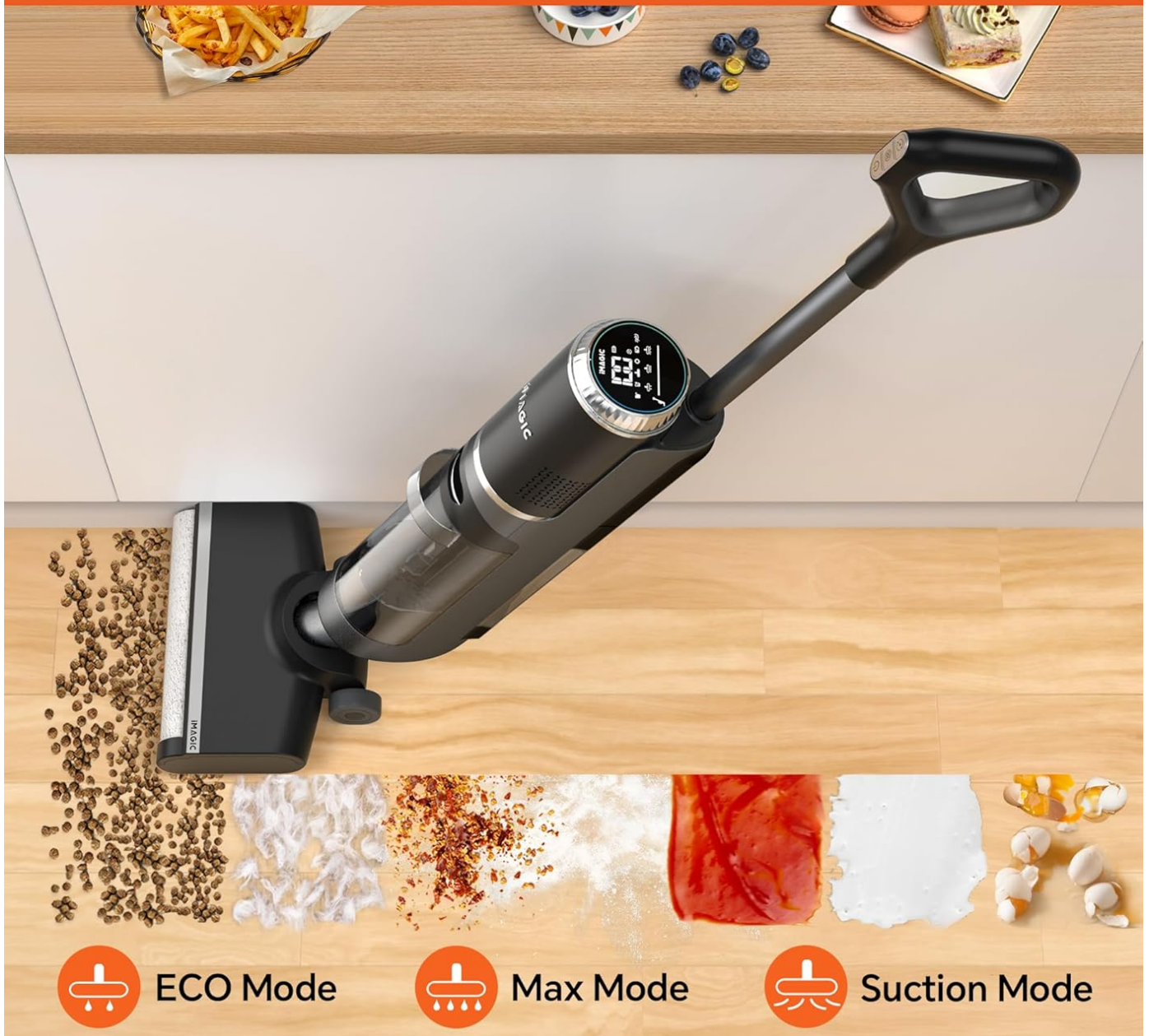
Figure 4.1: IMAGIC M3 simultaneously vacuuming and mopping.

This image illustrates the IMAGIC M3 in action, demonstrating its capability to vacuum dry particles like coffee beans and mop wet spills such as ketchup or eggs, all in a single pass. It highlights the different cleaning modes: ECO, Max, and Suction.