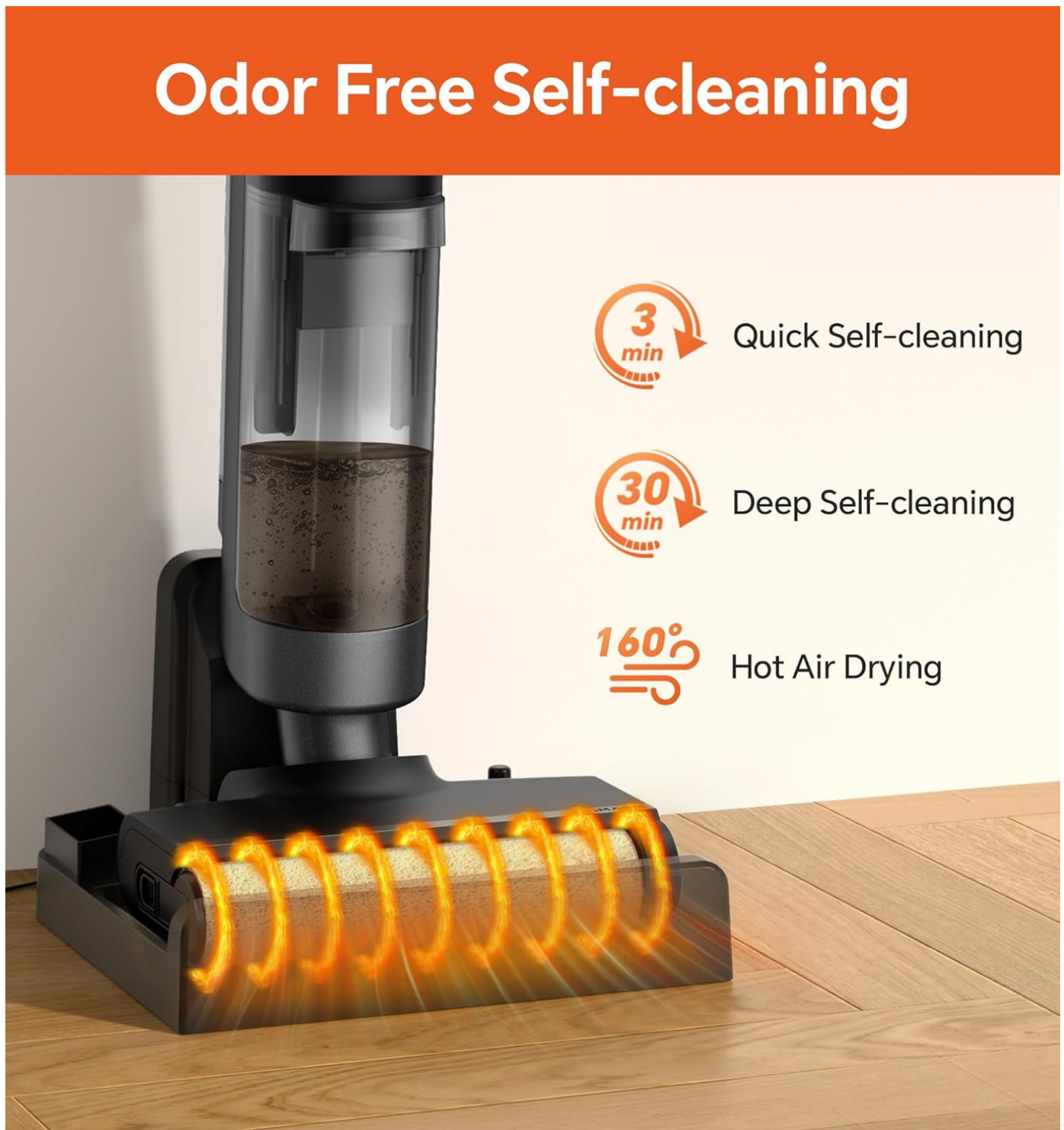
Figure 5.1: IMAGIC M3 self-cleaning process with hot air drying.

The IMAGIC M3 features self-cleaning modes to maintain the brush roller and internal tubes.