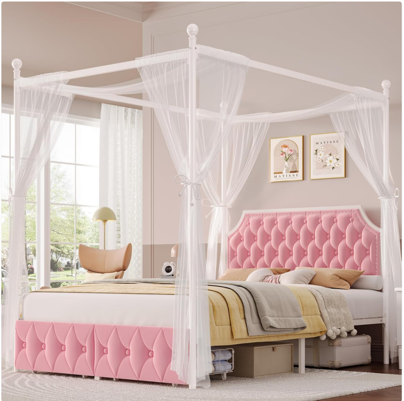
Image: The Keyluv Queen Upholstered Canopy Bed Frame with its canopy posts installed, creating an elegant and airy feel in a brightly lit room. The pink headboard and footboard are prominent.