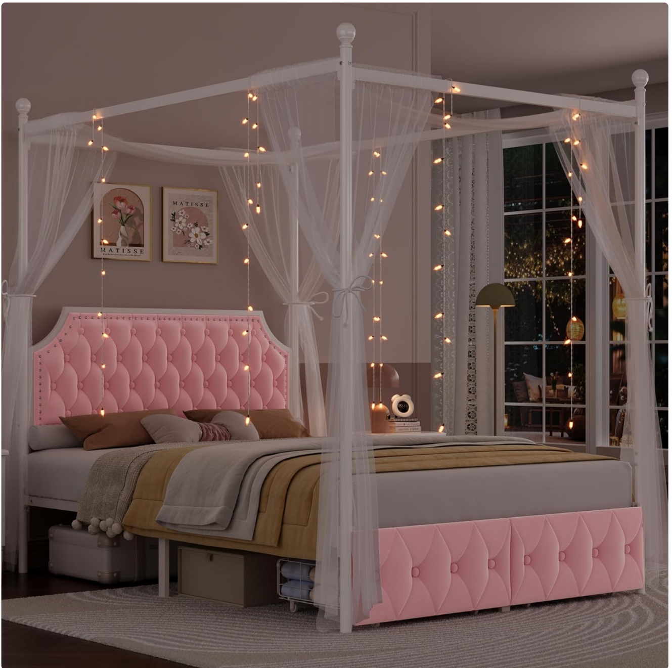
Image: The Keyluv Queen Upholstered Canopy Bed Frame in a bedroom setting, featuring its pink button-tufted headboard, white canopy posts, and under-bed storage drawers. Decorative lights and sheer curtains are shown, though not included with the product.