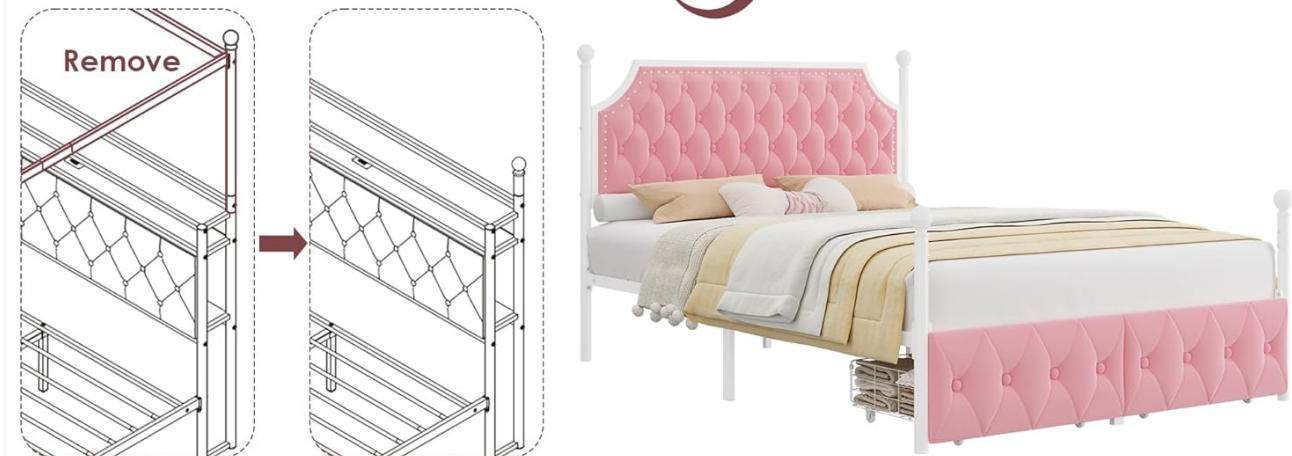
Image: A visual guide demonstrating how the four canopy posts can be detached from the bed frame, allowing for a two-purpose design.