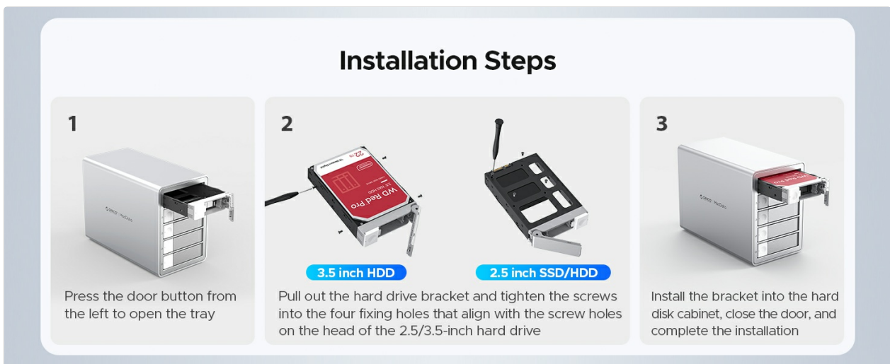
Figure 4.1: Step-by-step guide for installing hard drives.