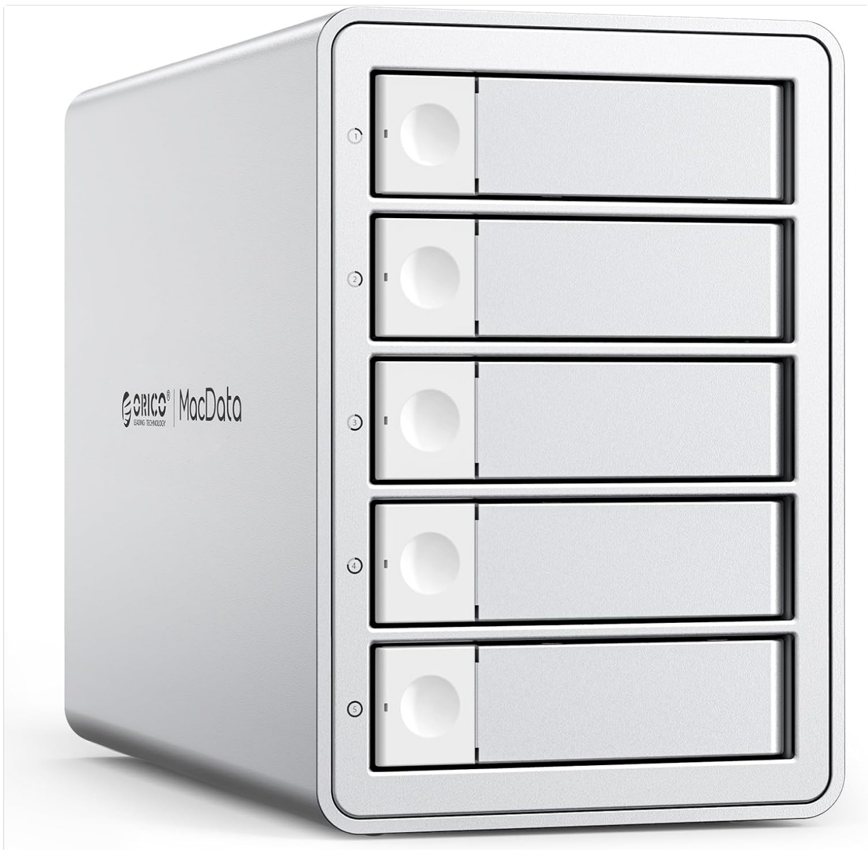
Figure 1.1: Front view of the ORICO 5-Bay Hard Drive Enclosure.