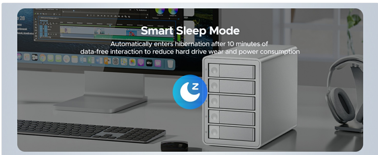
Figure 5.1: Smart Sleep Mode for power saving and drive longevity.

The enclosure features a smart sleep mode that activates after 10 minutes of inactivity. This conserves power and reduces wear on the hard drives. Drives will automatically spin up when accessed again.