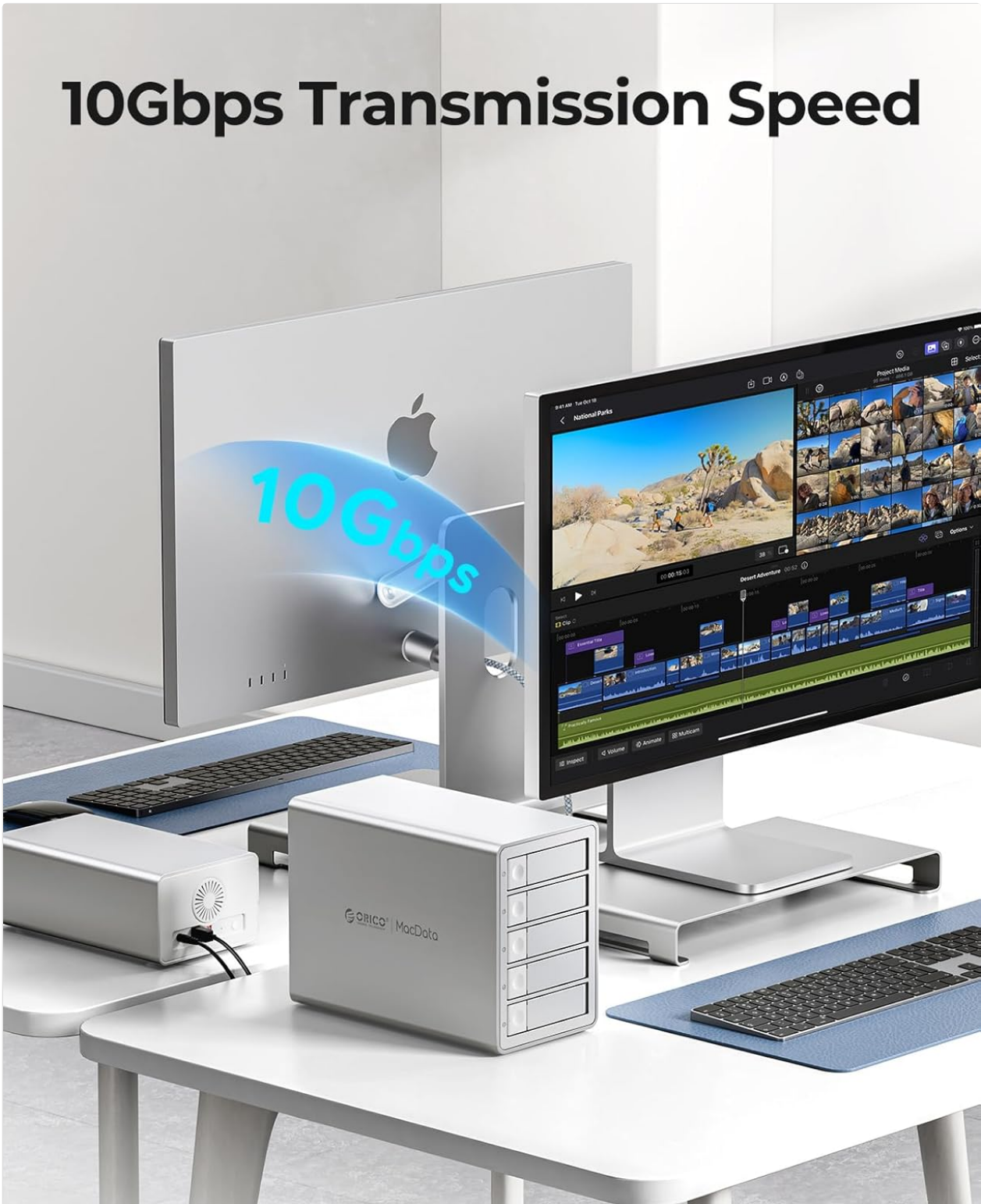
Figure 3.1: High-speed data transmission capability.