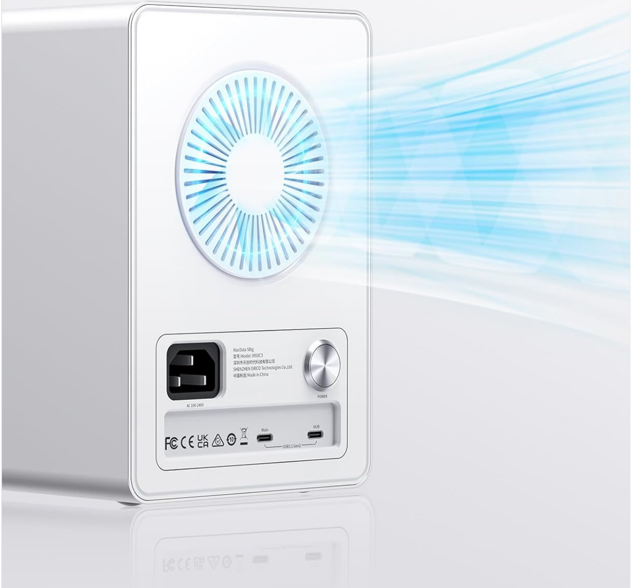
Figure 6.1: Rear view highlighting the cooling fan and ventilation.

Aluminum alloy + 80mm silent fan for quieter cooling