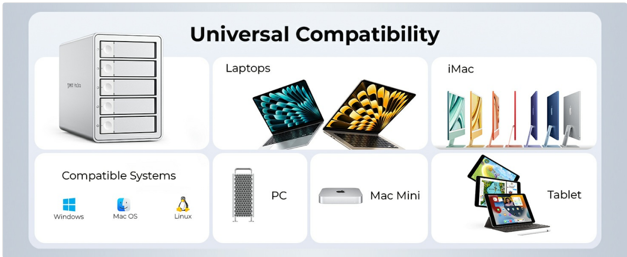
Figure 9.1: Universal compatibility across various platforms and devices.