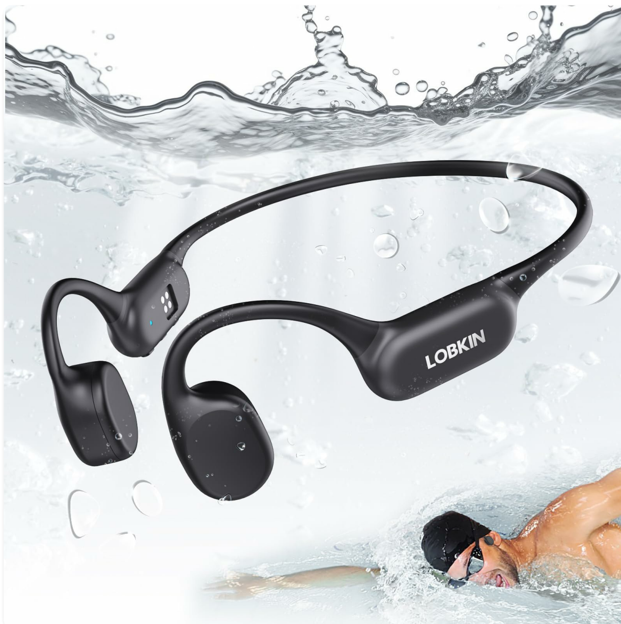
Image: A swimmer wearing LOBKIN X18 headphones underwater, highlighting the IPX8 waterproof rating and 32GB offline MP3 mode. Note: Switch to MP3 mode when swimming.

switch modes, press the Mode button (usually indicated by an 'M' or a specific icon) once. The headphones will announce the current mode.