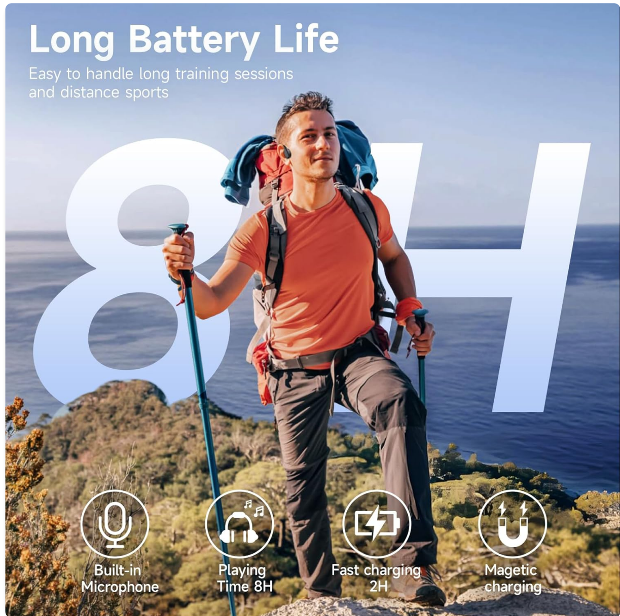
Image: The LOBKIN X18 headphones with an illustration of magnetic charging and an 8-hour battery life indicator.

Before first use, fully charge the headphones. Connect the magnetic charging cable to the charging port on the headphones and the USB-A end to a standard USB power adapter (not included) or a computer's USB port. The LED indicator will show charging status.