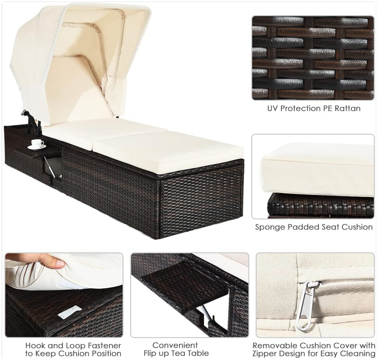
Figure 4.1: Key components and features for assembly and use, including PE rattan, cushion, coffee table, and fasteners.