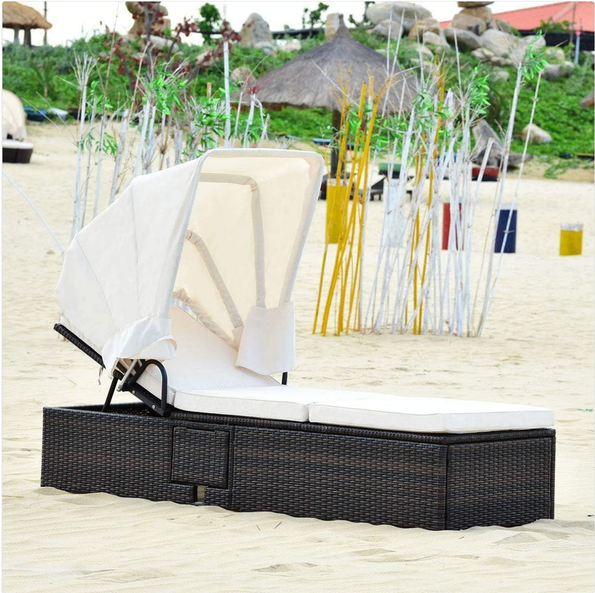
Figure 3.1: Overview of the assembled HAPPYGRILL Patio Chaise Lounge.