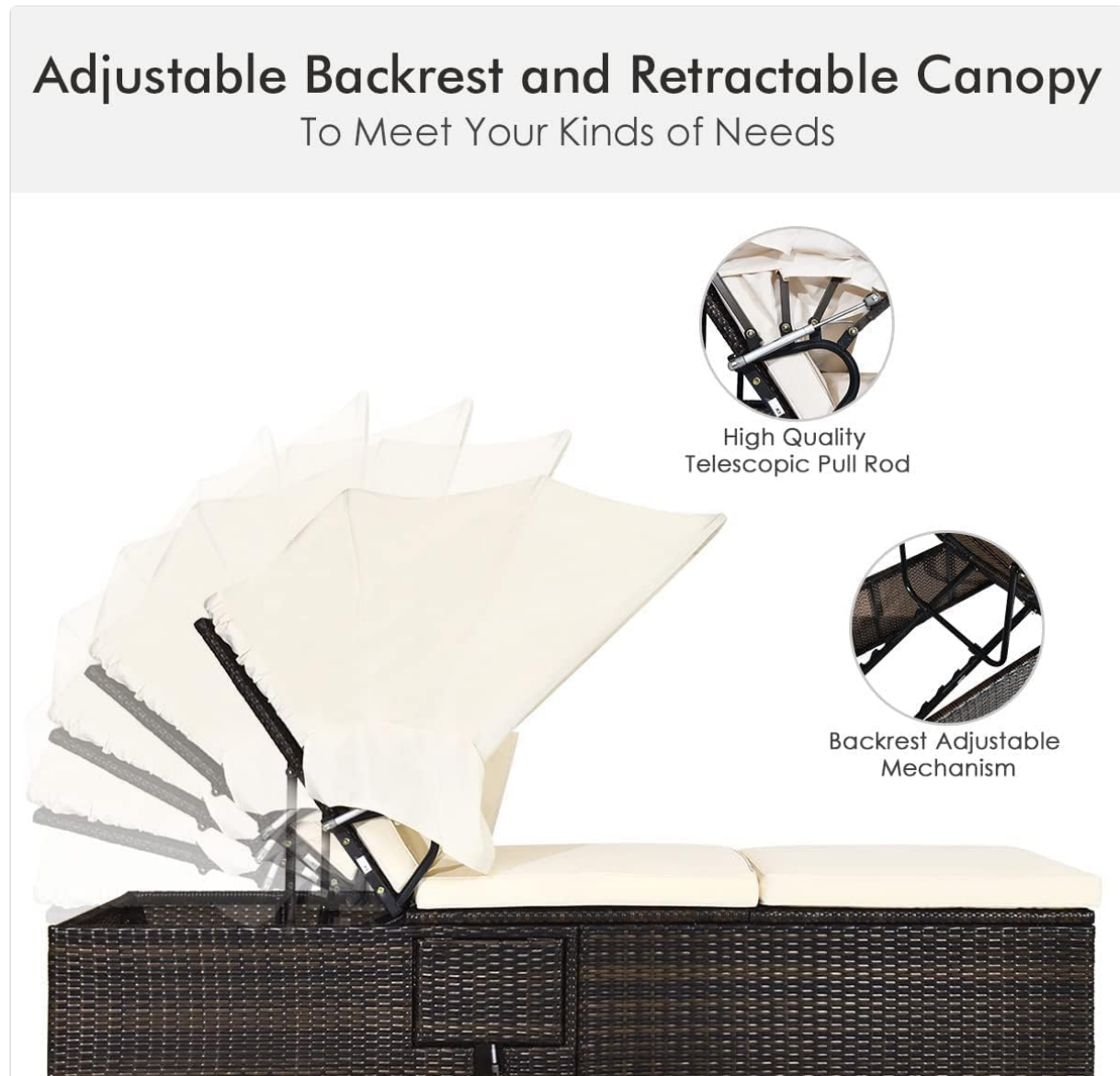
Figure 5.1: Illustration of the adjustable backrest and retractable canopy mechanisms.

A small, convenient coffee table is integrated into the side of the chaise lounge. This table can be flipped up or extended to hold beverages, books, or other small items. Ensure it is stable before placing items on it.