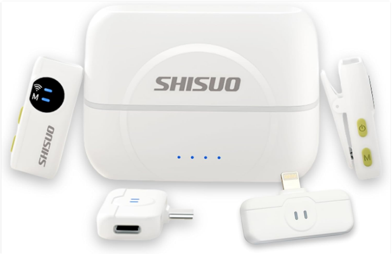
Image: The SHISUO A5 Wireless Lavalier Microphone in white and silver.

The SHISUO A5 system features compact wireless transmitters and versatile receivers designed for ease of use and high-quality audio capture. The charging case provides extended battery life and convenient storage.