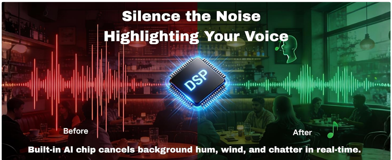
Image: Illustration of AI noise cancellation in action.

The SHISUO A5 features AI noise reduction to minimize ambient sounds. To activate or deactivate noise reduction, press the designated button on the transmitter. A green indicator light typically signifies active noise reduction.