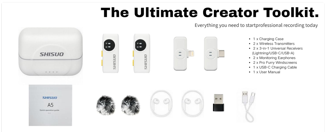
Image: Complete Creator Toolkit showing all included accessories.