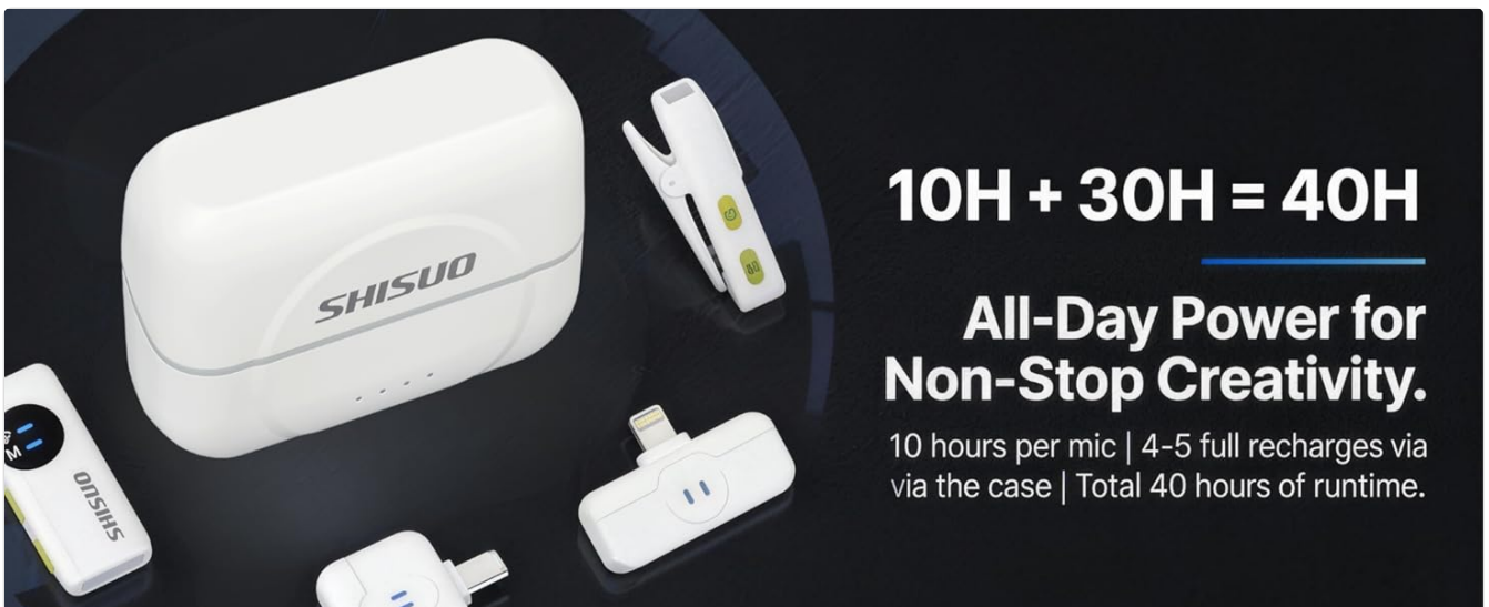
Image: Battery life details for the SHISUO A5 system.