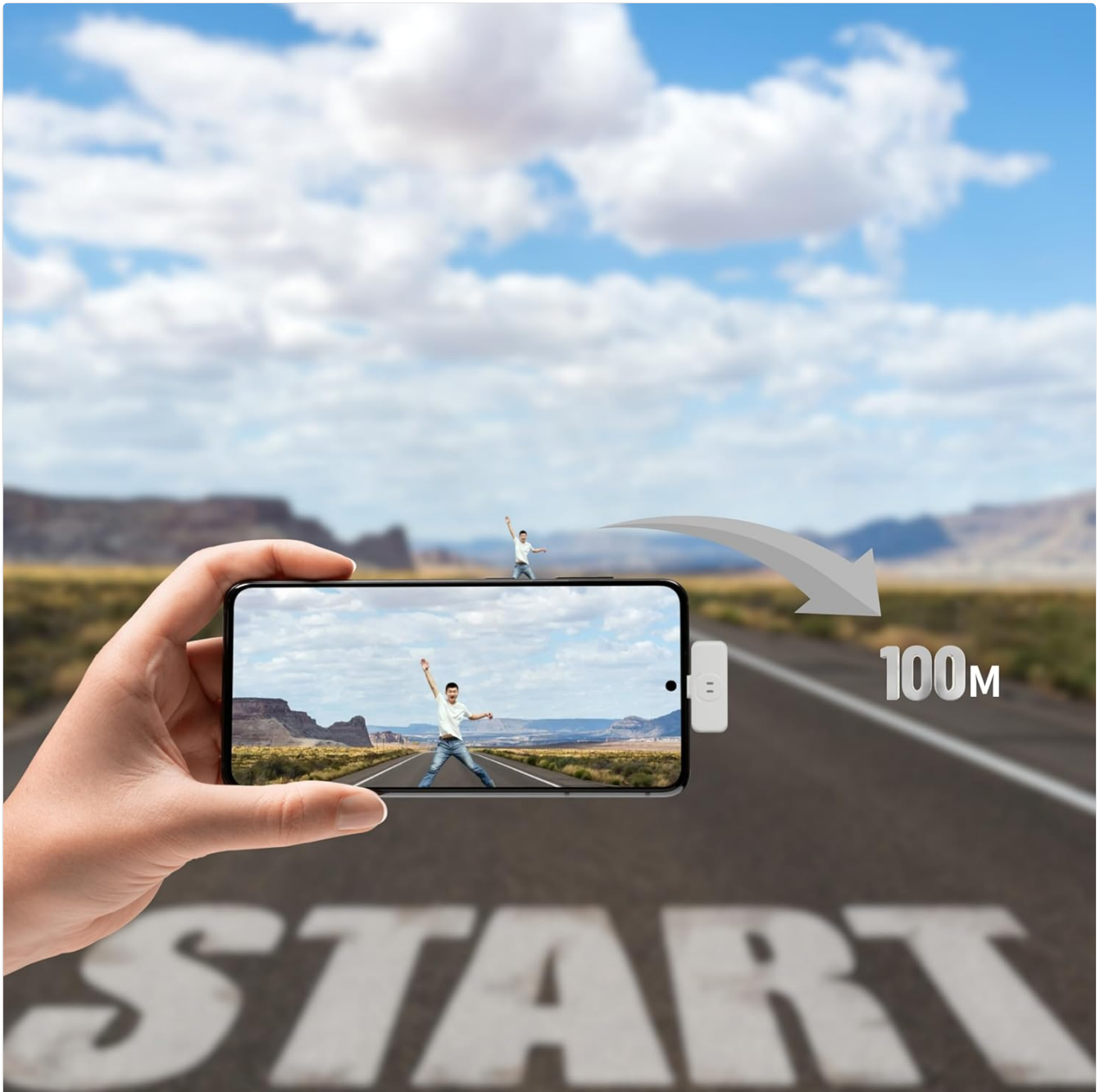
Image: The versatile 3-in-1 receiver for various device connections.