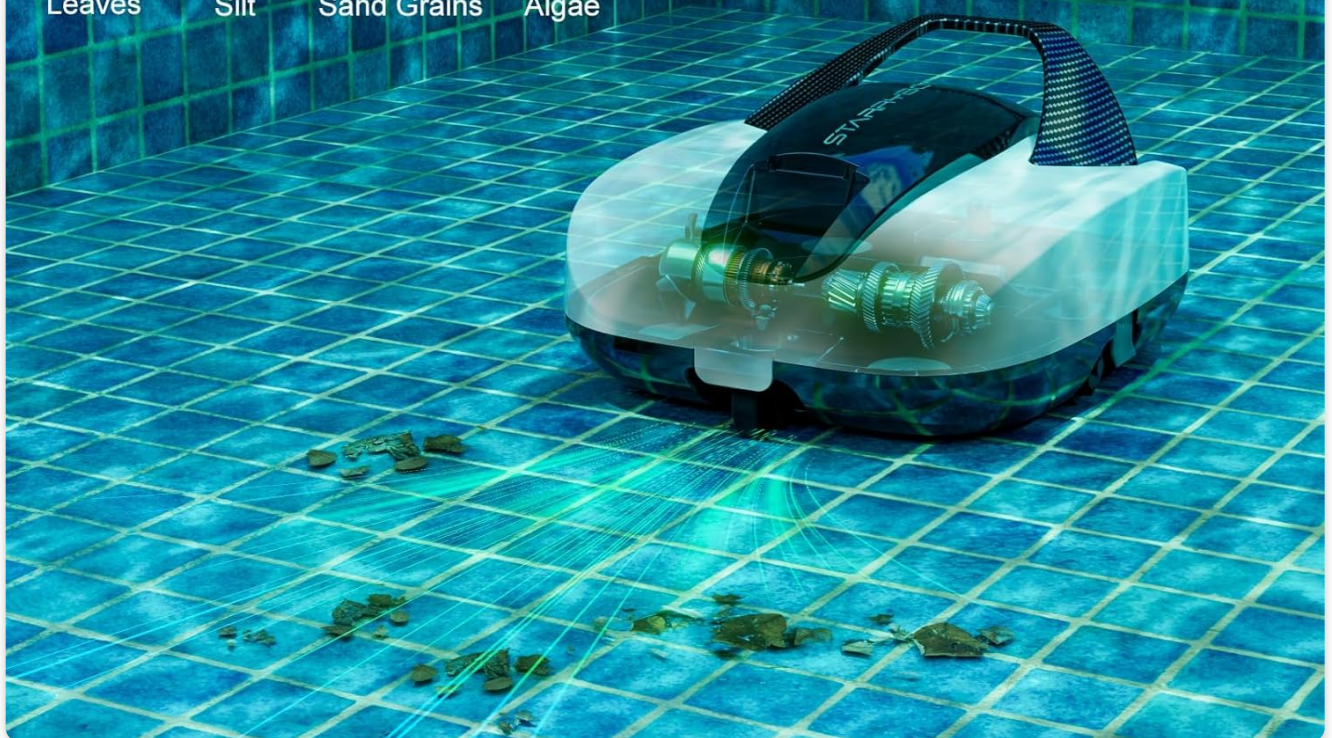
Image 4.2: The STARRYBOT cleaner effectively removing various types of debris from the pool floor.