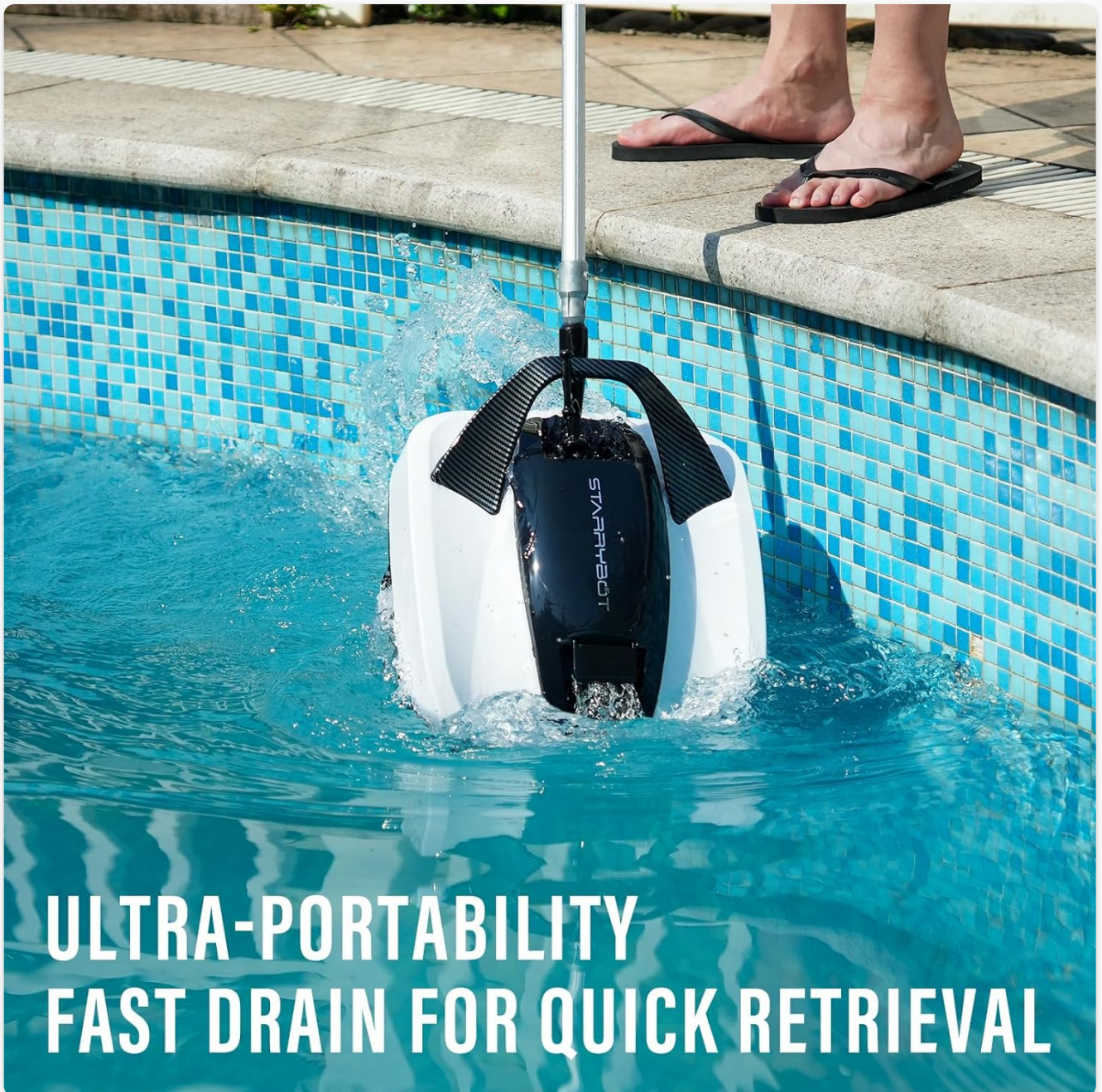
Image 6.2: A person using the included hook to easily retrieve the STARRYBOT cleaner from the pool.