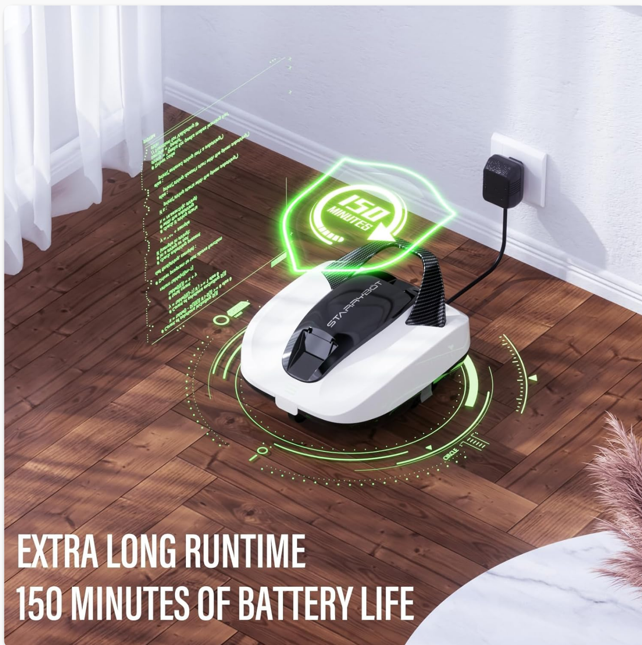
Image 5.1: The STARRYBOT cleaner connected to its charger, indicating its 150-minute runtime.