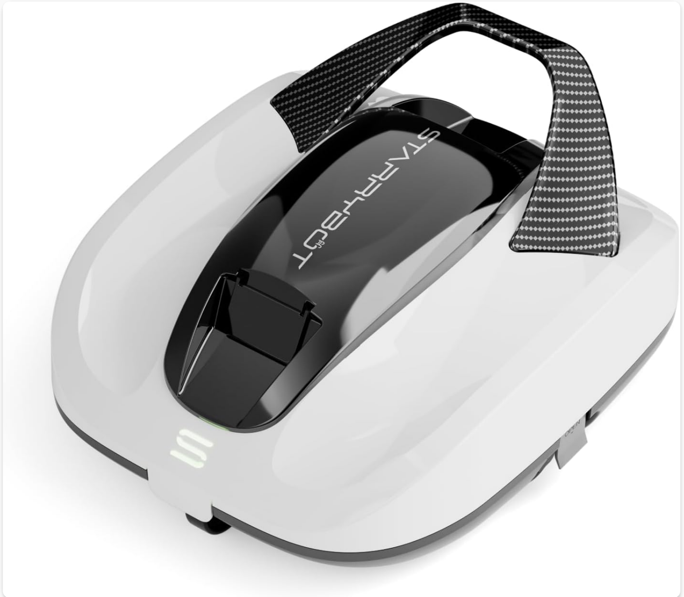
Image 4.1: Front view of the STARRYBOT Cordless Robotic Pool Cleaner ET2310-02.

The STARRYBOT ET2310-02 is a cordless robotic pool cleaner designed for efficient and hassle-free pool maintenance. It features advanced navigation and a powerful suction system to keep your pool sparkling clean.