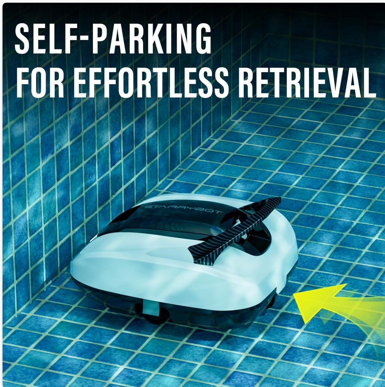
Image 6.1: The cleaner utilizing its self-parking feature to position itself near the pool edge for convenient retrieval.

The STARRYBOT ET2310-02 is equipped with smart self-parking technology. When the battery level is low or the cleaning cycle is complete, the cleaner will automatically move to the nearest edge of the pool for easy retrieval.