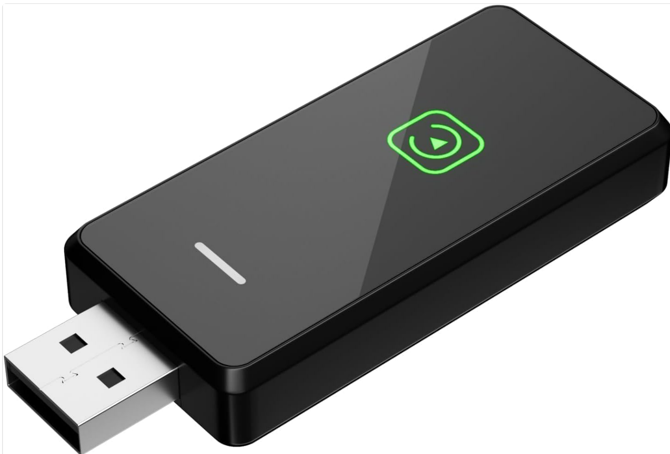
Image: The PWAYTEK Wireless CarPlay and Android Auto Adapter, a compact black device with a USB-A connector on one end and a green play icon on its surface, indicating its function.