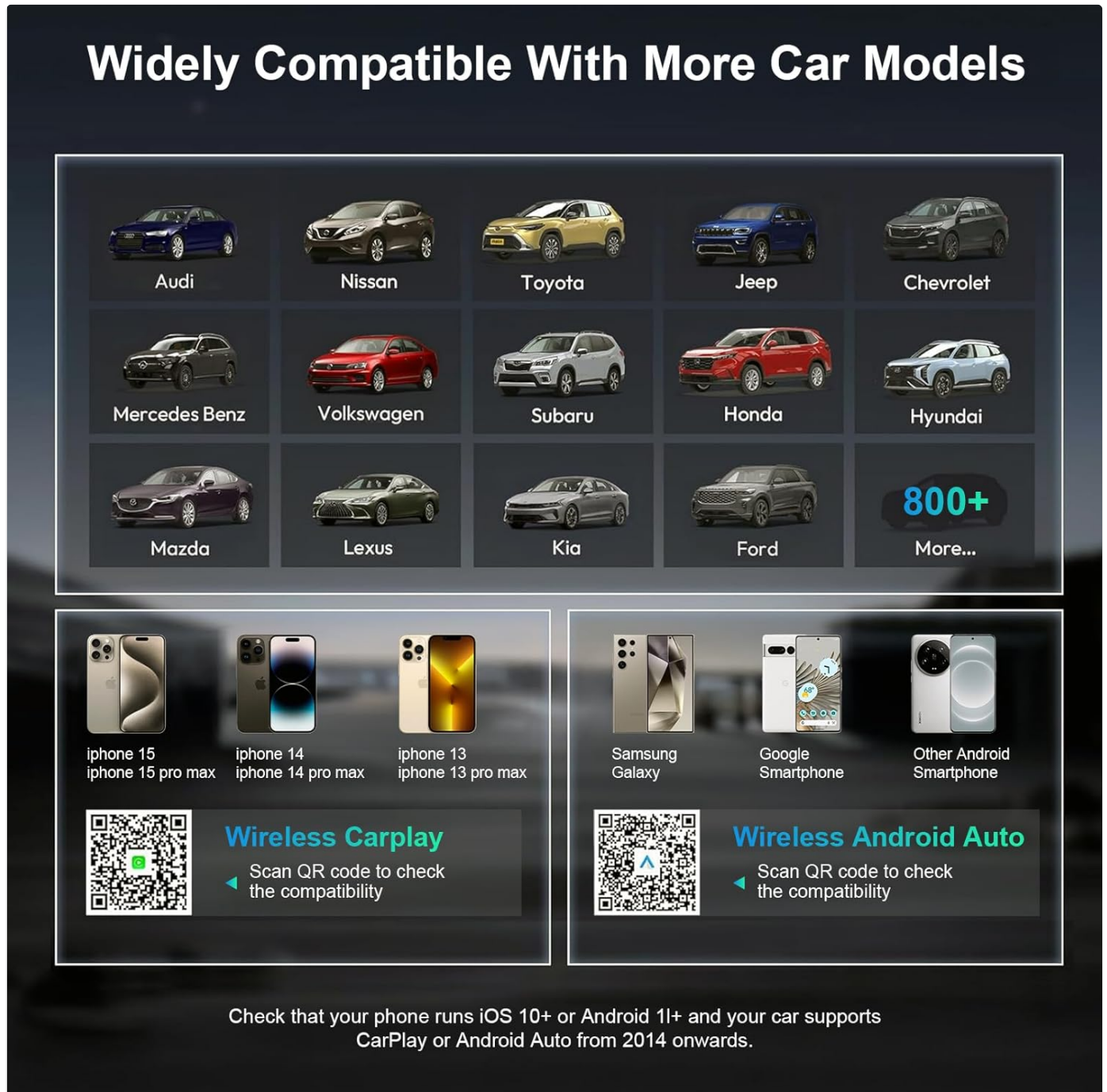
Image: A visual representation of various car brands (Audi, Nissan, Toyota, Jeep, Chevrolet, Mercedes Benz, Volkswagen, Subaru, Honda, Hyundai, Mazda, Lexus, Kia, Ford) indicating wide compatibility, along with iPhone and Android phone models. QR codes are shown for checking compatibility.

To check if your car is compatible, you can connect your phone to your car using a USB data cable. If the CarPlay or Android Auto interface appears on your car screen, it is compatible.