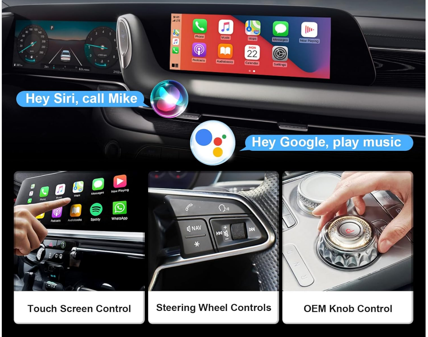
Image: Depicts how the adapter integrates with a car's original controls, including voice commands (Siri, Google Assistant), touch screen, steering wheel controls, and OEM knob control.