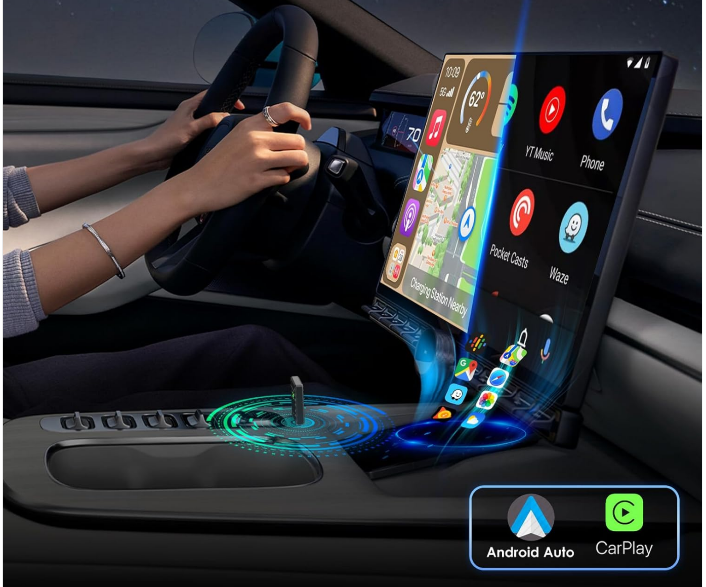
Image: Illustration showing a car's infotainment screen transforming from a wired setup to a wireless experience with the adapter, displaying both Android Auto and Apple CarPlay logos.

Transform your wired CarPlay or Android Auto into a fully wireless experience