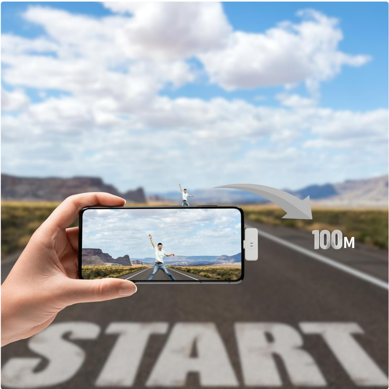
Image 3.1: Connecting the receiver to a smartphone for immediate use.