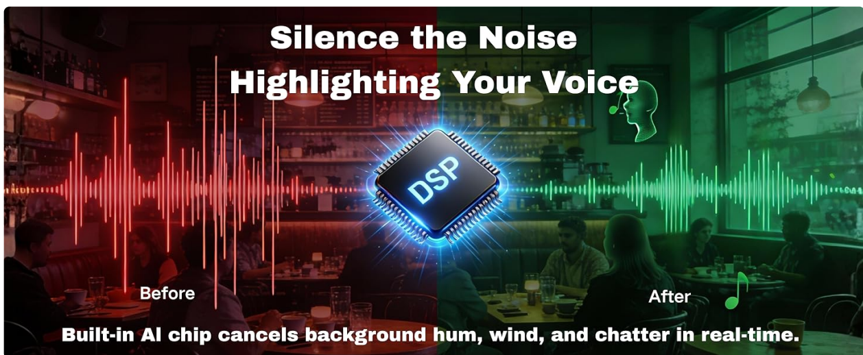
Image 4.1: Demonstration of AI noise cancellation for clear audio.

Video 4.2: A demonstration comparing audio quality before and after using the SHISUO A5 lavalier microphone, showcasing its noise reduction capabilities.