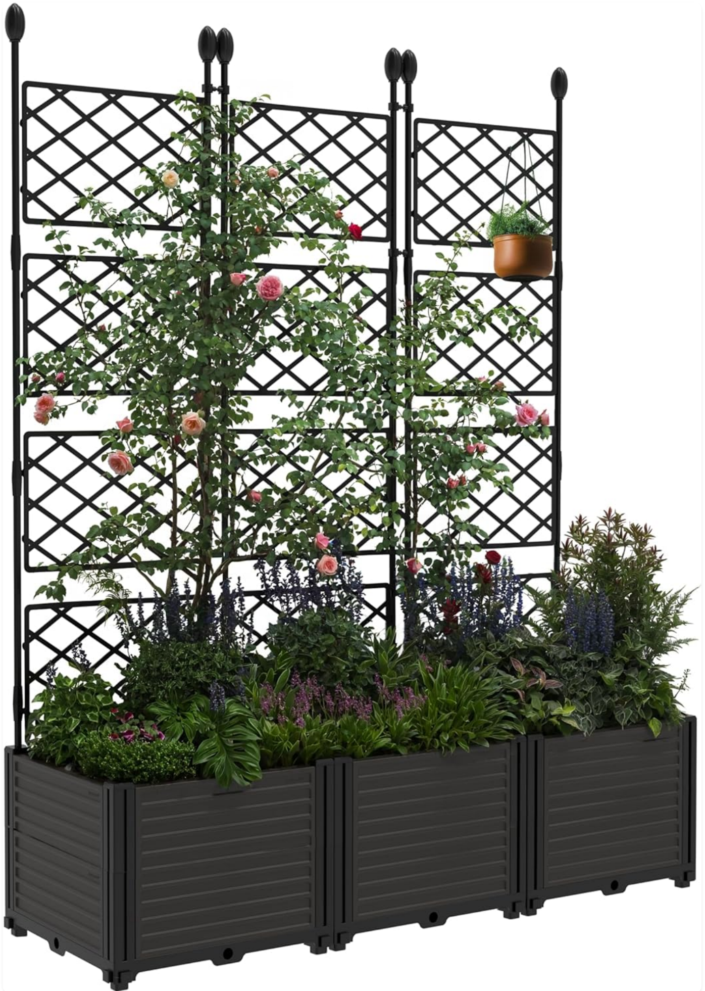
Figure 1.1: Fully assembled KYBOLT Modular Raised Garden Bed with plants.

This image displays the complete modular raised garden bed system, featuring three planter boxes at the base filled with various flowering