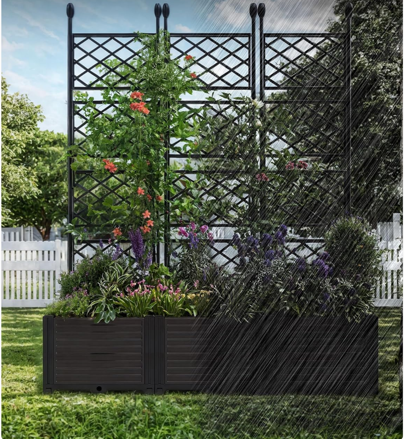
Figure 5.1: Durable PP Material.

Rust-proof sturdy, and built to withstand any weather!