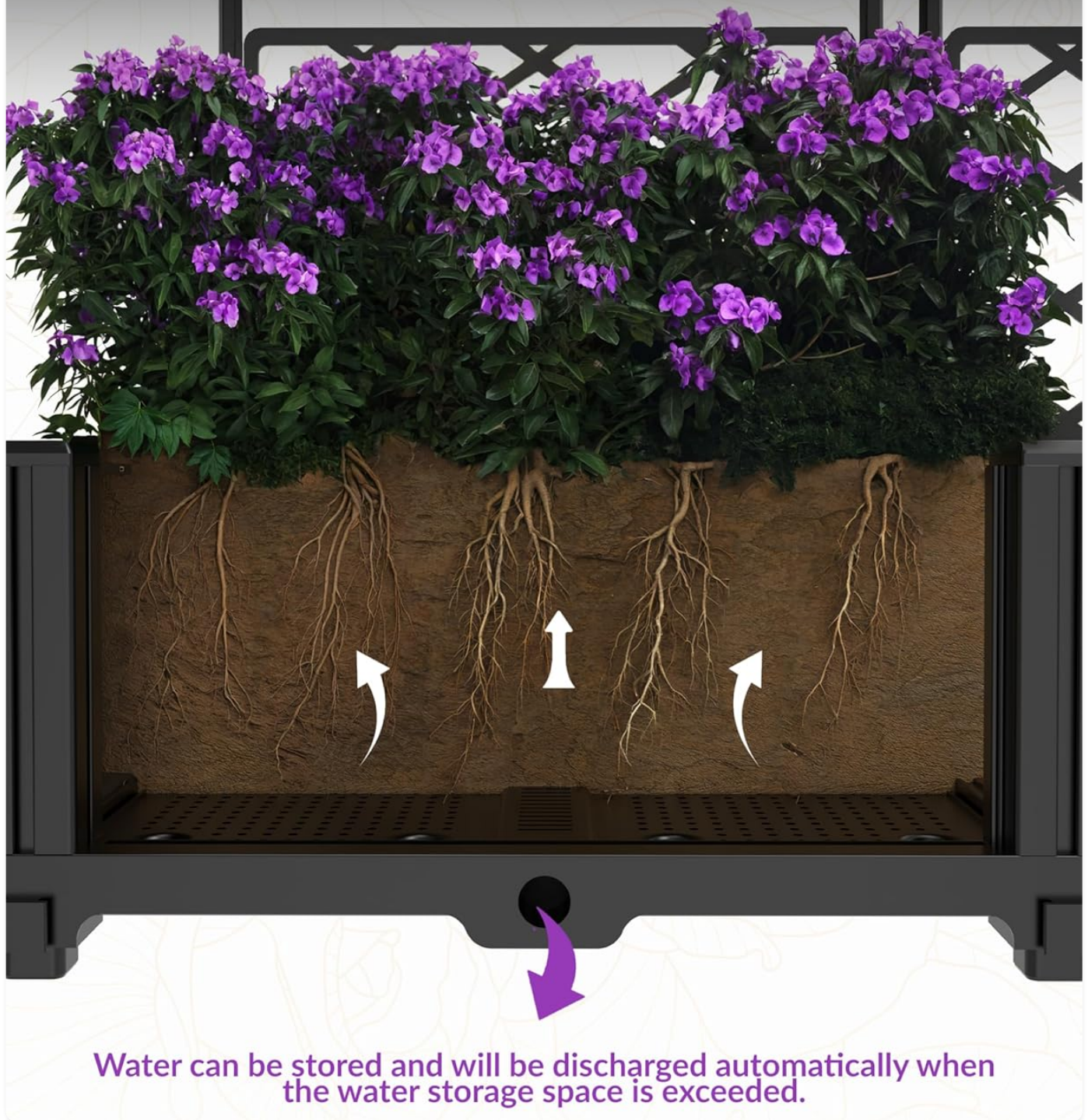
Figure 4.1: Planter box drainage system.

This image provides an enlarged detail view of the planter box, showing a cross-section of the soil and plant roots. Arrows indicate how water can be stored at the bottom of the planter and will be discharged automatically through a drainage hole when the water storage space is exceeded, ensuring proper moisture levels for plants.