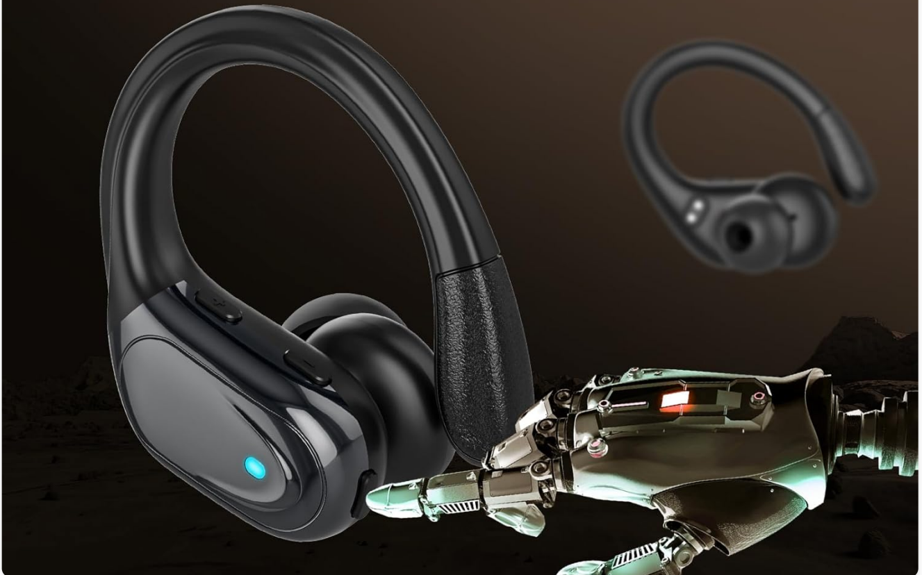
Image: Overview of earbud physical button controls.