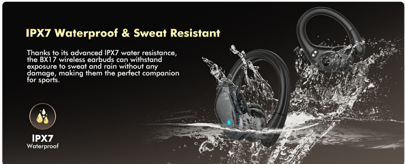
Image: HAORYUYAN BX17 Earbuds demonstrating IPX7 waterproof and sweat-resistant features.