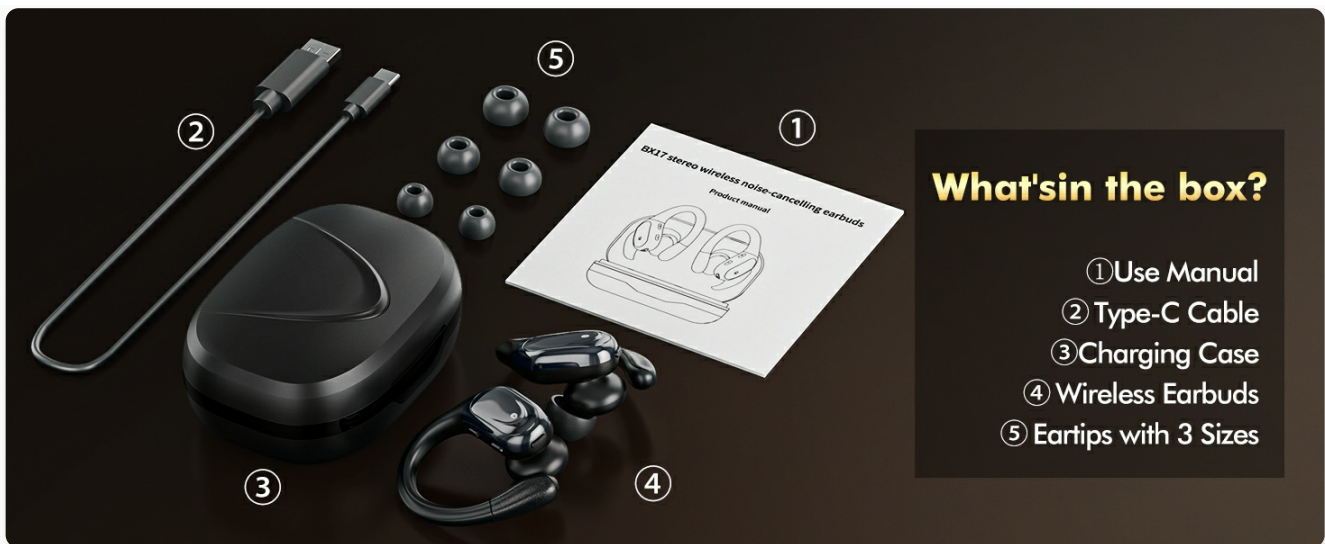
Image: Package contents of the HAOYUYAN BX17 Wireless Earbuds.