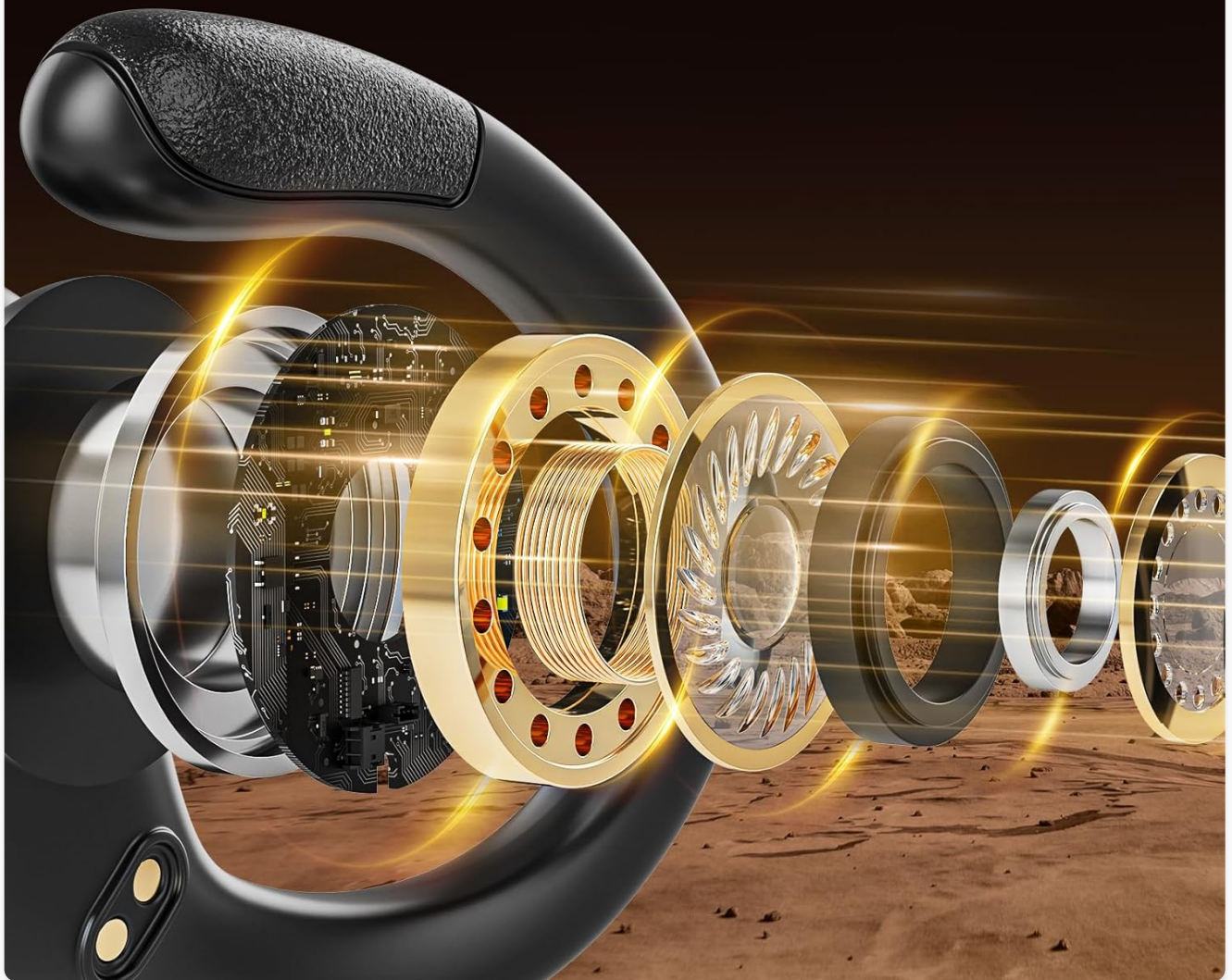
Image: Internal structure of the earbud, illustrating the 14.3mm dynamic driver.