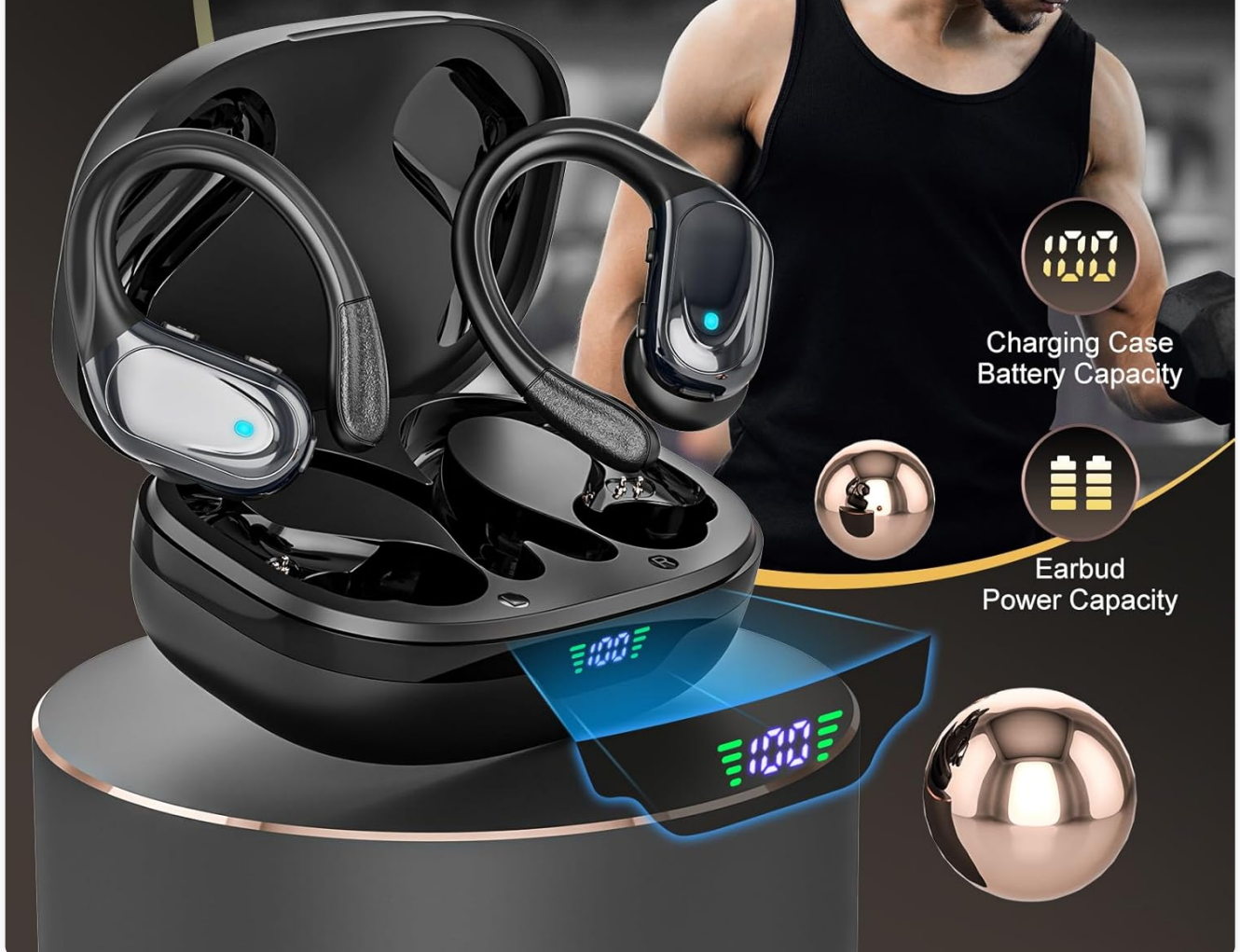
Image: LED Power Digital Display on the charging case.

Easily Check The Remaining Battery and Charging Status at Any Time