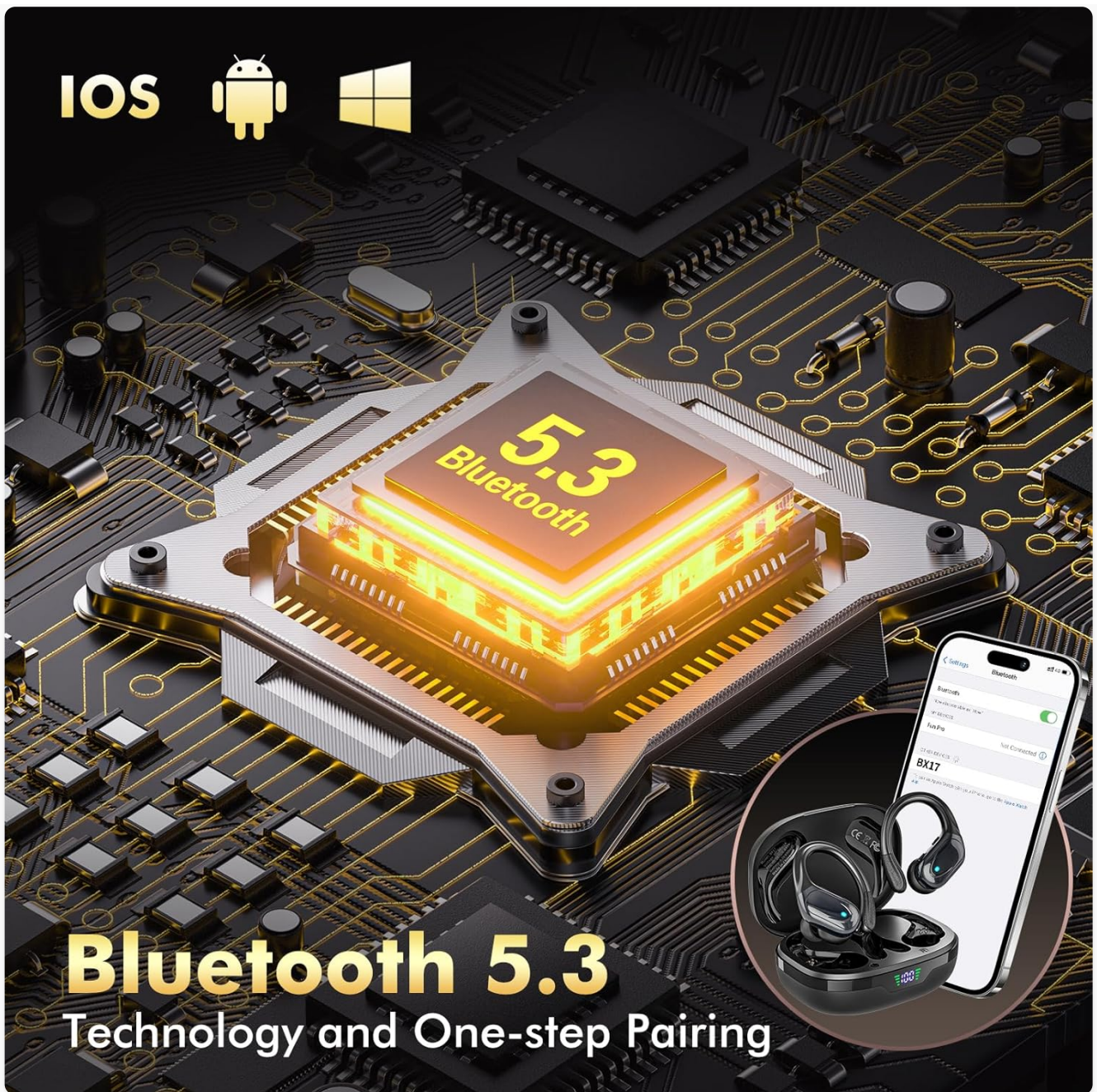
Image: Bluetooth 5.3 technology and one-step pairing.