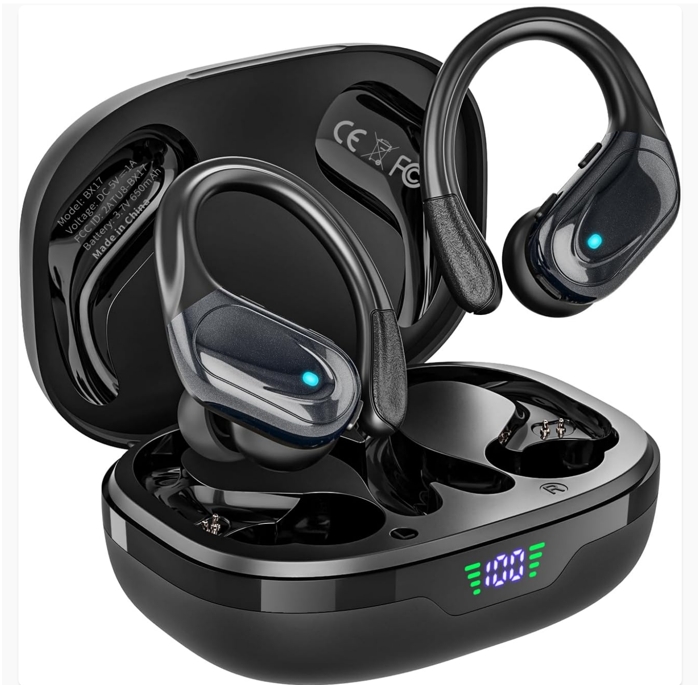
Image: HAOYUYAN BX17 Wireless Earbuds and Charging Case.