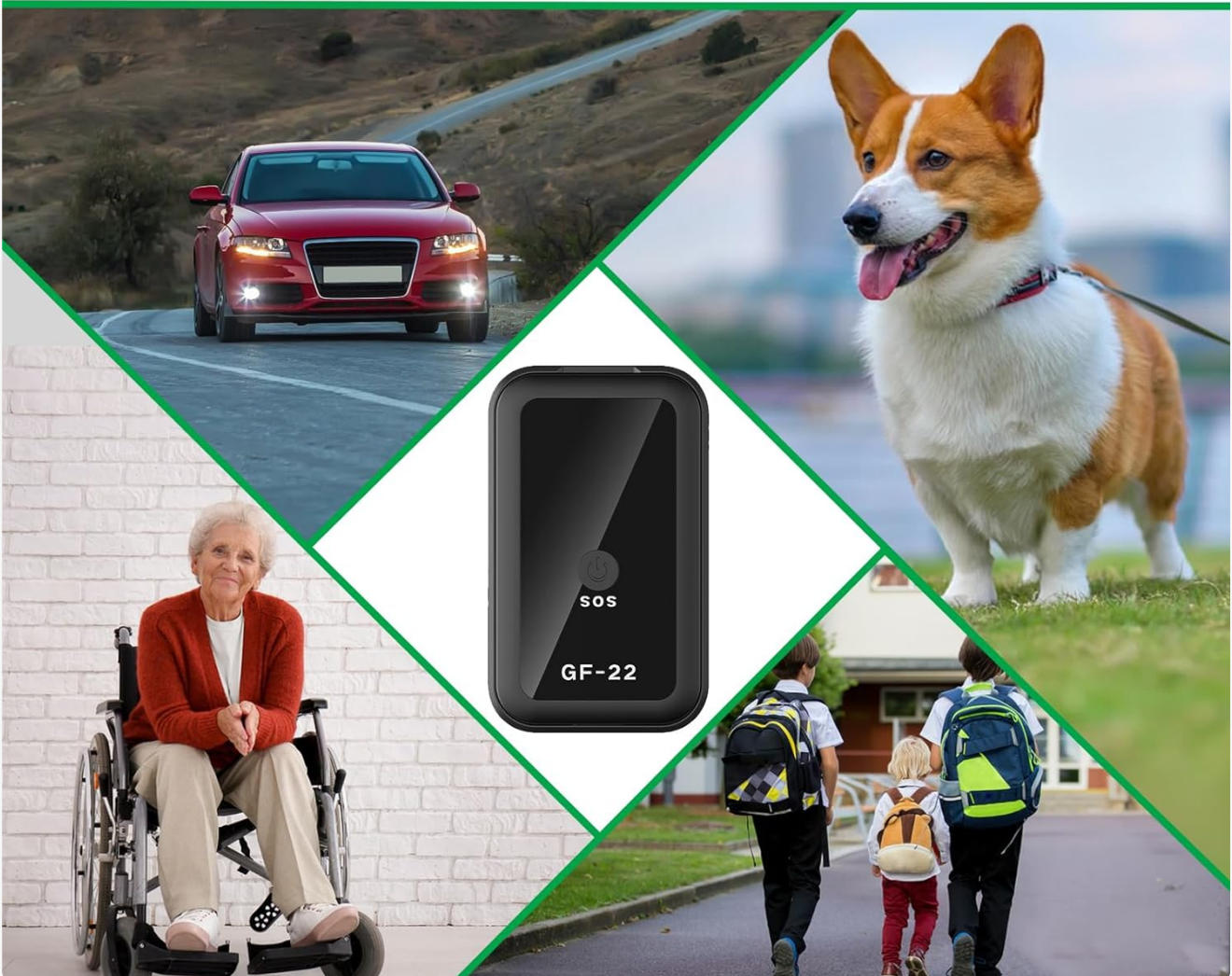
Image 2.1: The GF22 tracker demonstrating its versatility for tracking vehicles, pets, elderly individuals, and children.

Powerful function and wide scope of application