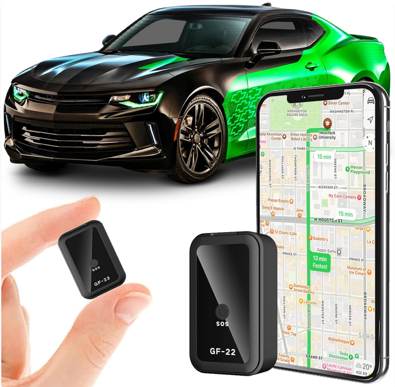
Image 1.1: The NGXDFL Mini GPS Tracker GF22, shown next to a car and a smartphone displaying its tracking capabilities on a map.