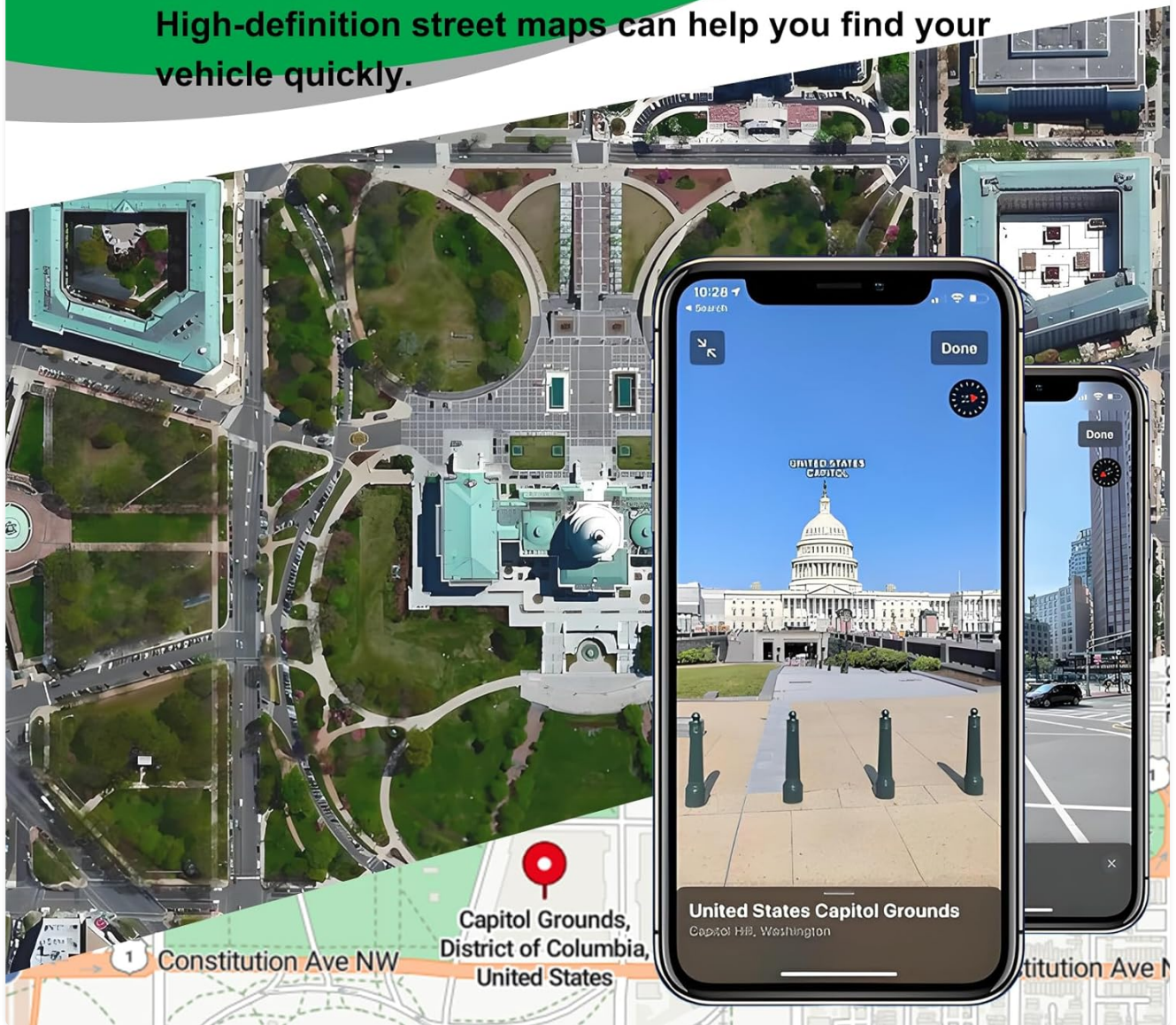
Image 6.1: A smartphone displaying a high-definition street map, illustrating the precision of the GPS tracking feature.

High-definition street maps can help you find your vehicle quickly.