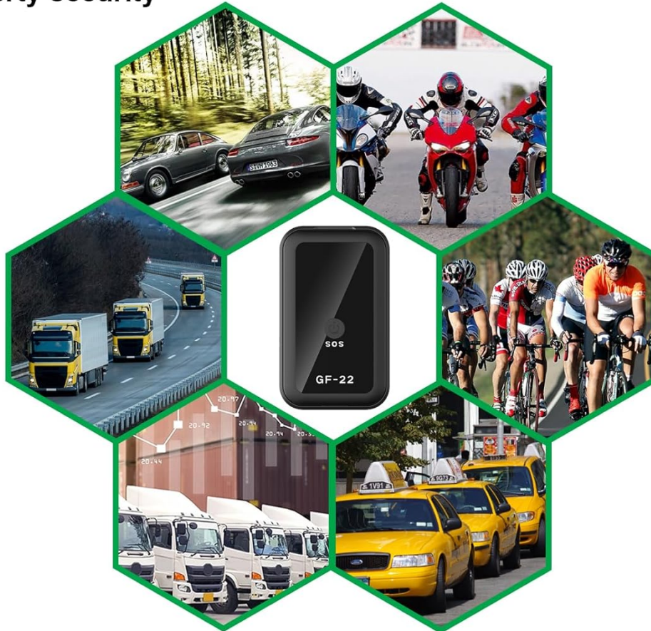
Image 7.2: The GF22 tracker illustrating its capability for multi-vehicle and multi-item localization, including cars, motorcycles, trucks, and taxis.

GPS locator can be bound to multiple vehicles or items at the same time, any place, any number of real-time grasp of the movements of multiple items, all-round protection of your property security