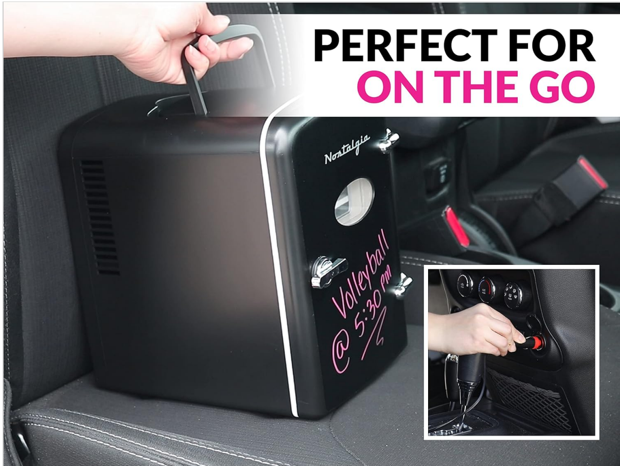
Image: The mini fridge shown with its DC power adapter, demonstrating its portability for use in a car.