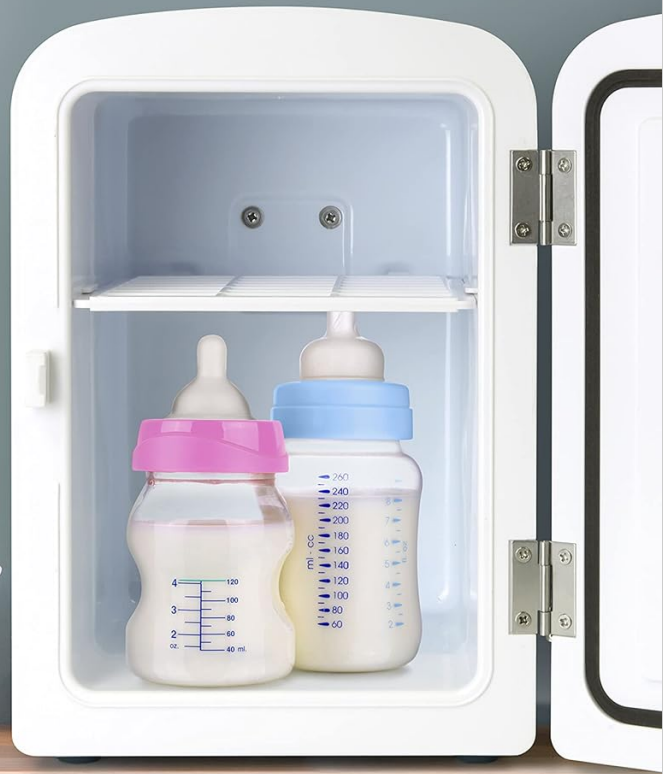
Image: The mini fridge interior configured to warm baby milk bottles.