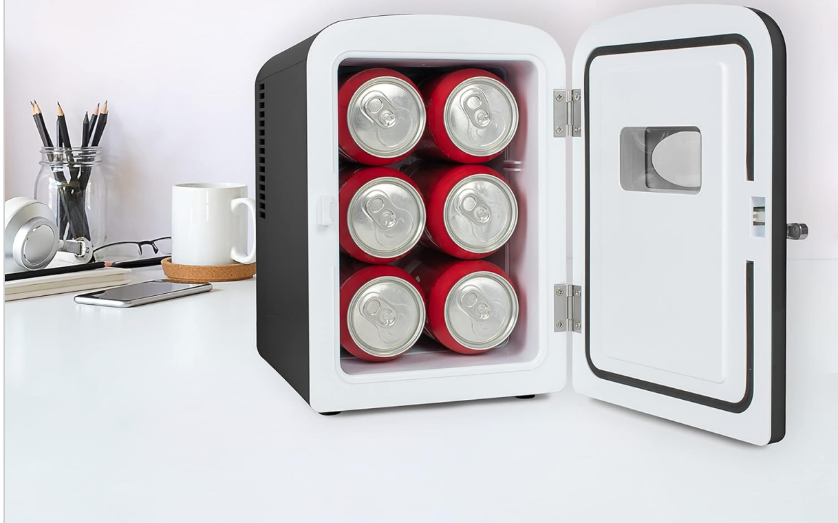
Image: The interior of the mini fridge demonstrating its capacity to hold six 12-ounce cans.