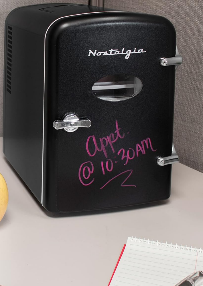
Image: Overview of the Nostalgia Retro Mini Fridge highlighting its compact, portable, adjustable, eco-friendly, and convenient features.

INCLUDES BOTH AC & DC PLUG-INS FOR HOME USE AND CAR USE; INCLUDES REMOVABLE SHELF