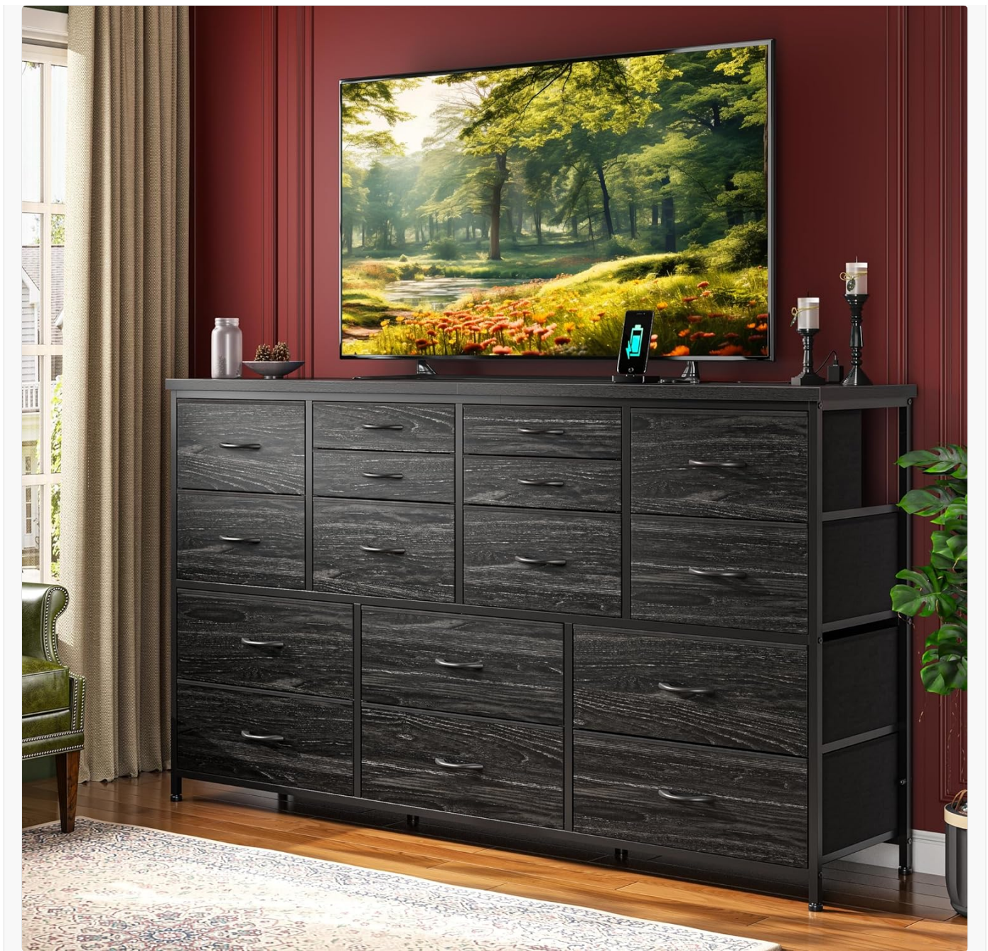
Image: Dresser as a TV Stand. This image shows the dresser functioning as a TV stand, supporting a large television and blending seamlessly into a living room environment.