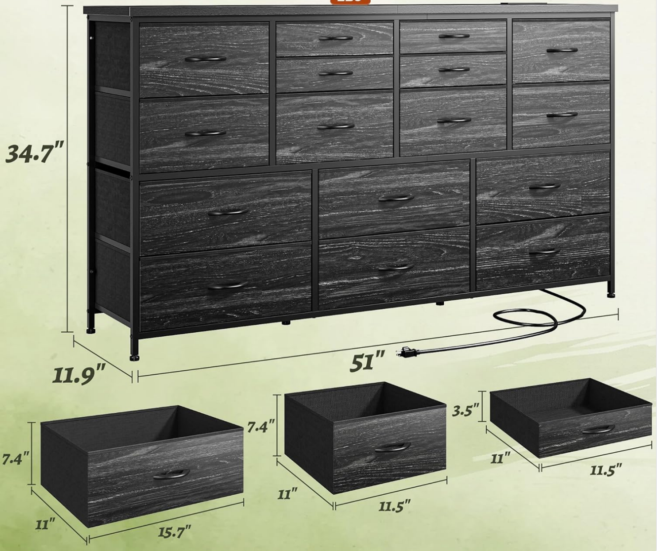
Image: Product Size and Drawer Dimensions. This image illustrates the overall dimensions of the dresser and the varying sizes of its 16 fabric drawers.