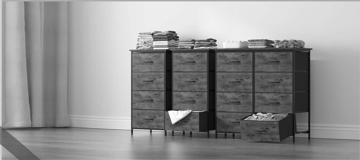
Image: Sturdy Construction & Safety Features. This image highlights the strengthening tendons, anti-tipping kit, and adjustable feet for enhanced stability and safety.