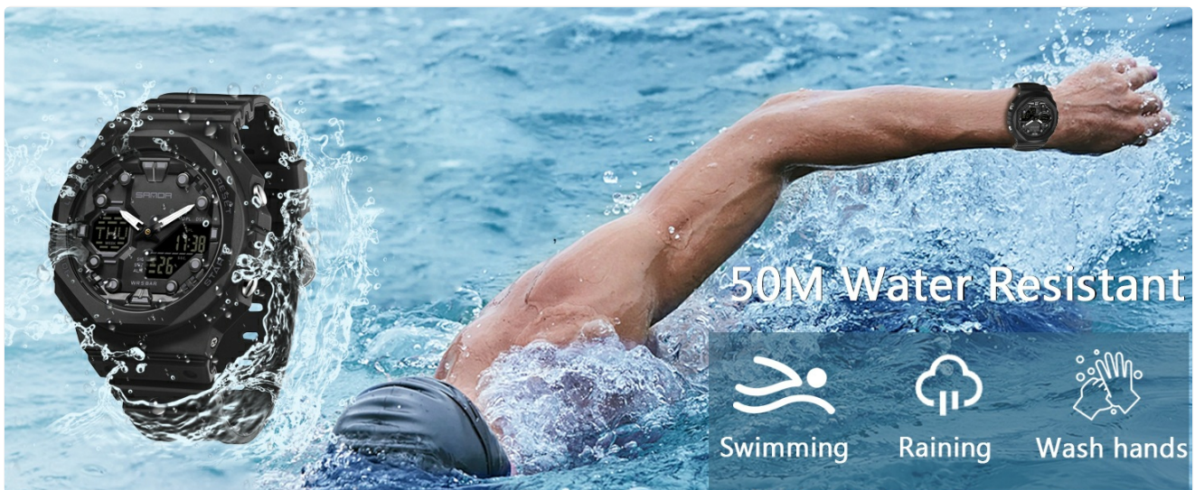
Image 4.1: Visual guide to the 50M water resistance, showing suitability for swimming, rain, and hand washing.