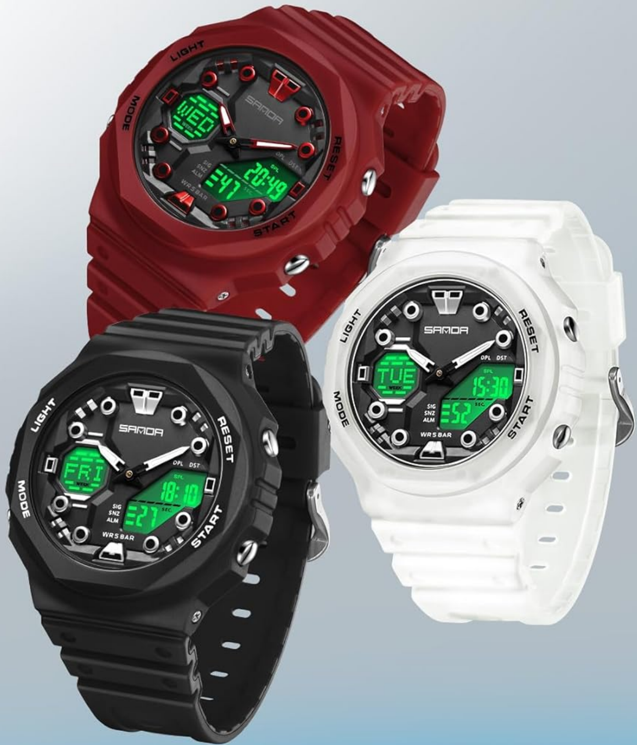
Image 2.1: Close-up of the watch face, highlighting the four control buttons: LIGHT, MODE, RESET, and START.