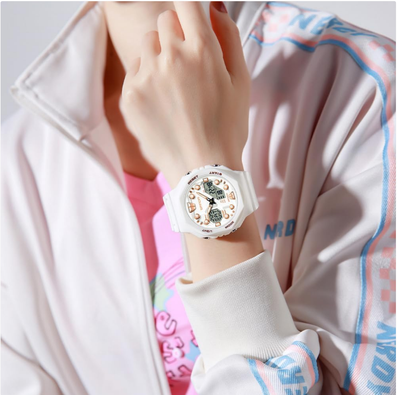
Image 1.3: The Gosasa Model 6016 watch worn on a wrist, showcasing its size and fit.