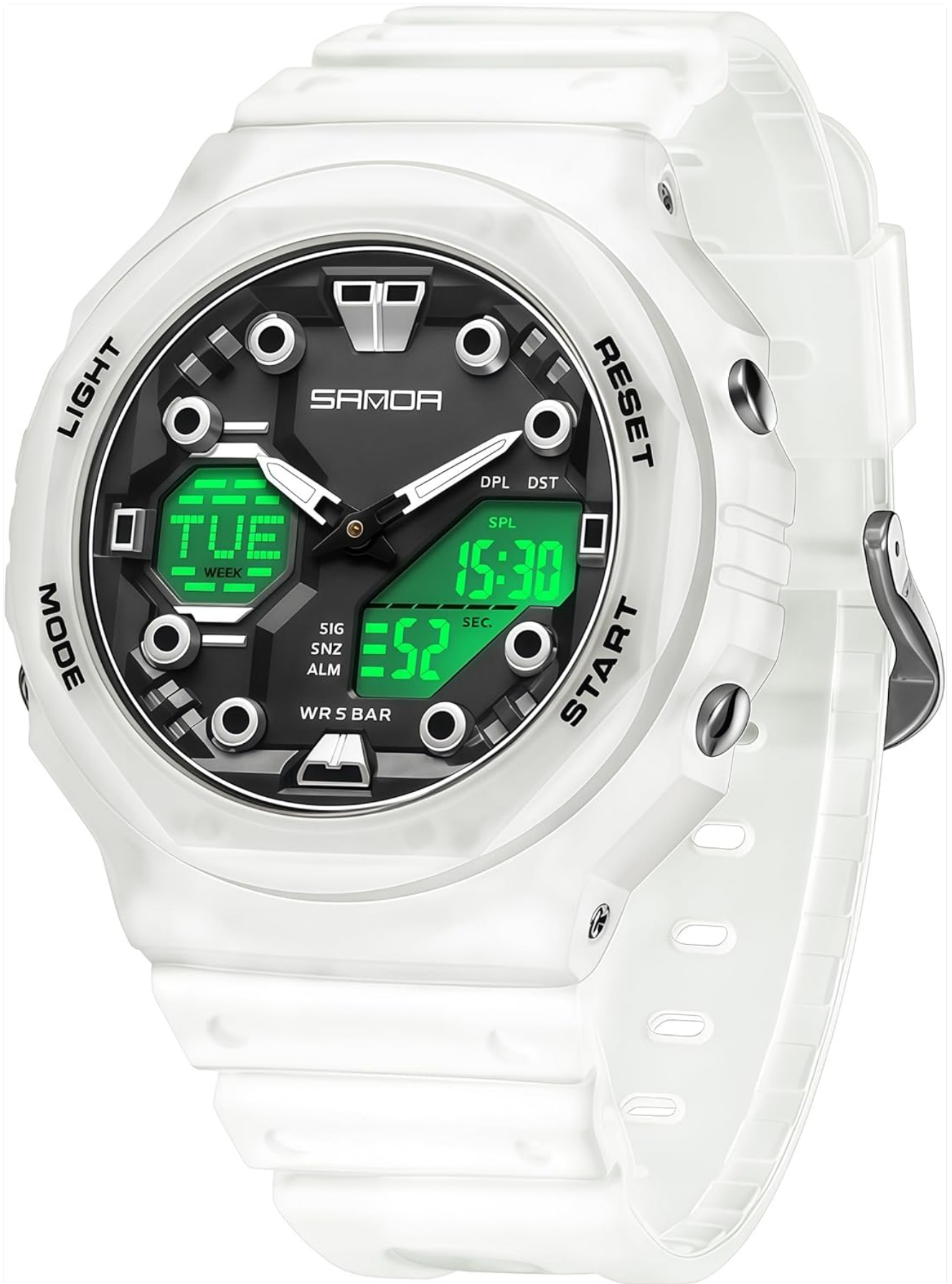
Image 1.1: Front view of the Gosasa Model 6016 Digital Sports Watch in transparent white.