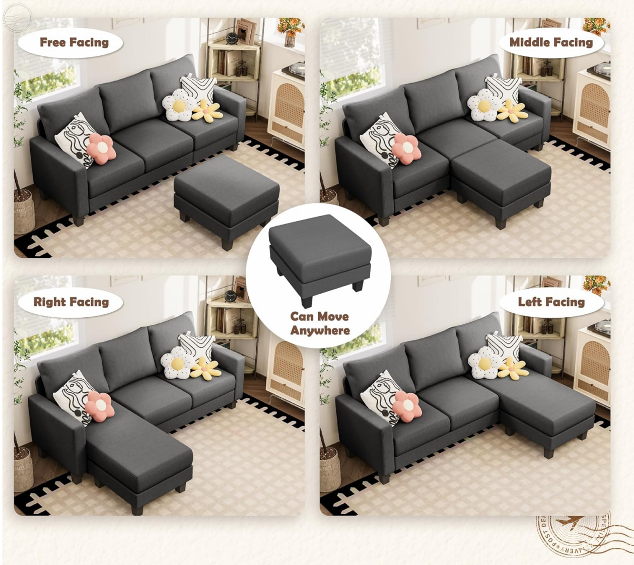
Image 5.1: Various configurations demonstrating the reversible ottoman placement.