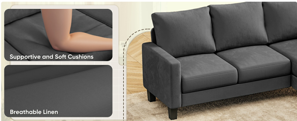
Image 6.1: Detail highlighting the supportive and soft cushions, and breathable linen material.