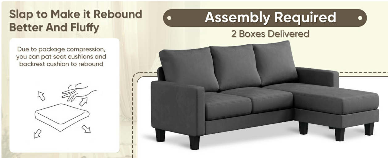
Image 4.1: Instructions for fluffing vacuum-compressed cushions and a reminder of two-box delivery.