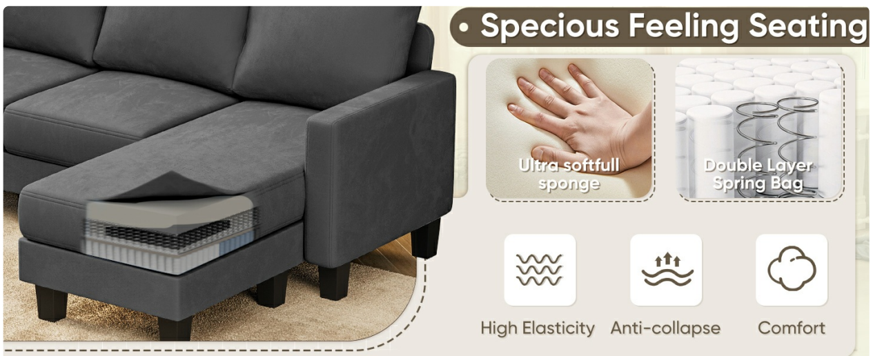
Image 5.3: Illustration of the seating construction, featuring ultra soft sponge and double-layer spring bag for comfort and elasticity.