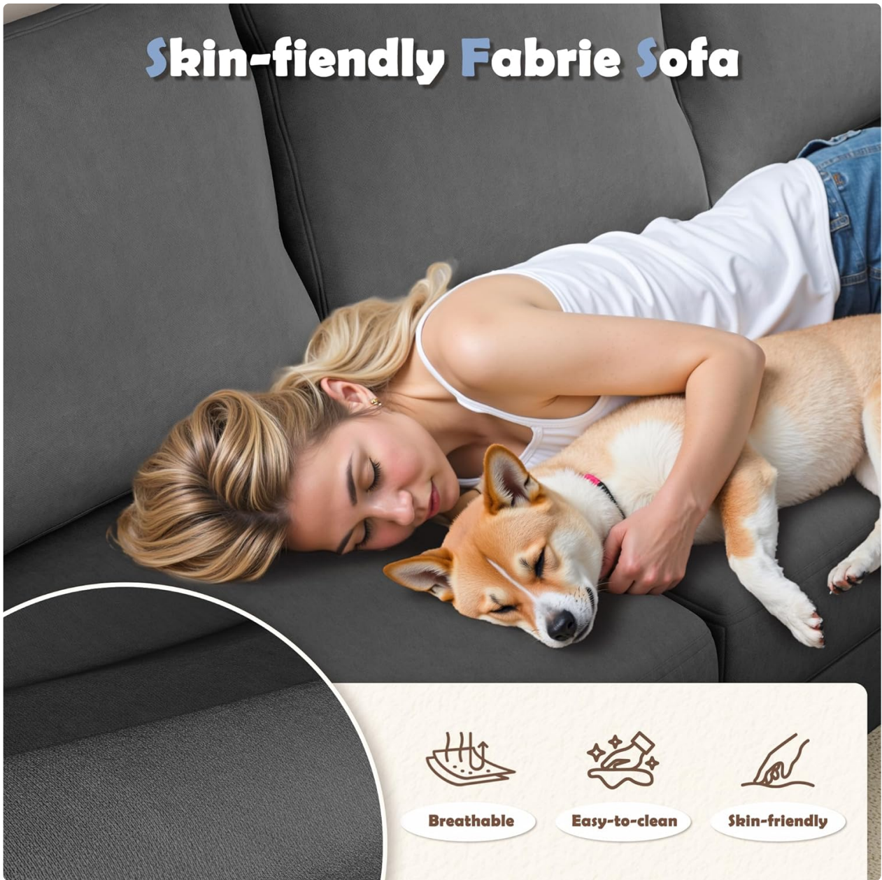
Image 5.2: Detail of the sofa's skin-friendly and breathable linen fabric.