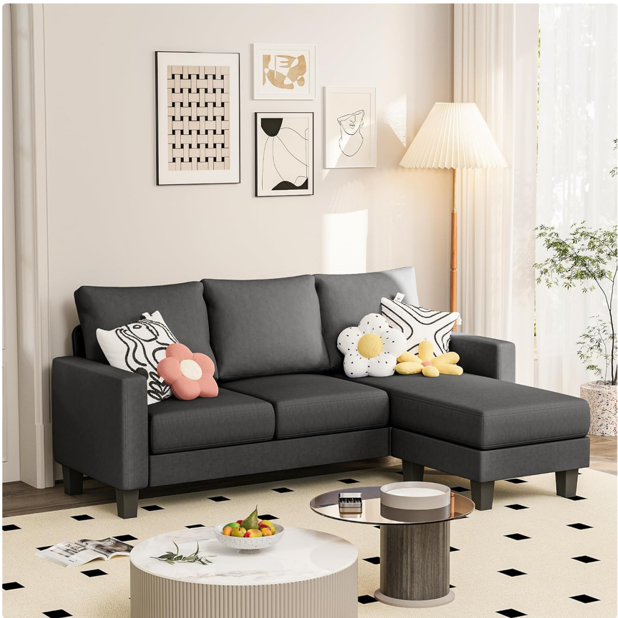
Image 1.1: The JUMMICO 73-inch Small L-Shaped Sofa with Reversible Ottoman in Dark Grey.