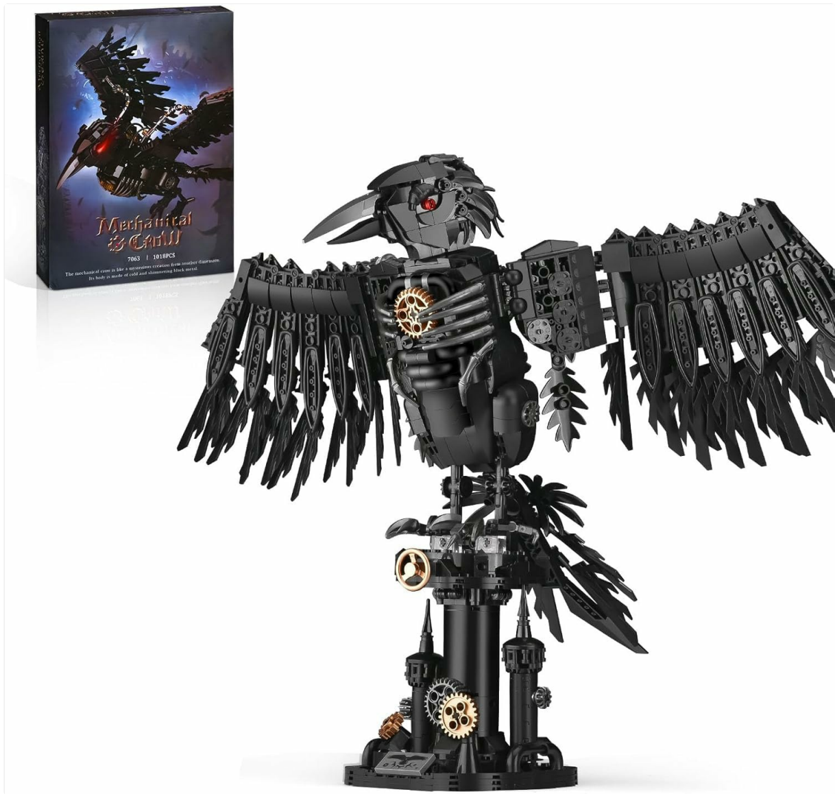
Figure 1.1: Fully assembled SATHIBI Mechanical Crow Building Set.