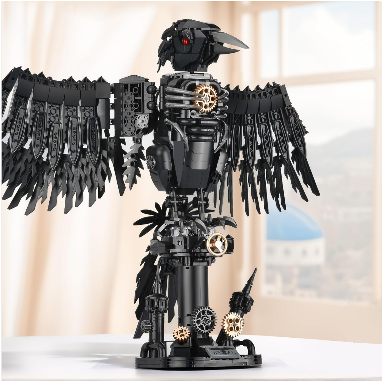
Figure 5.1: The crow model displayed as a decorative item.

Your browser does not support the video tag.