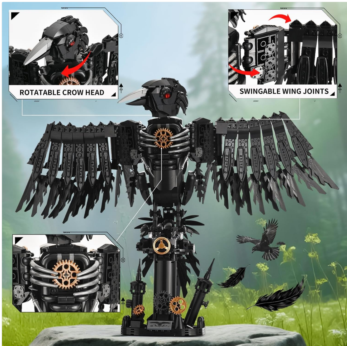
Figure 4.1: Details of the rotatable crow head and swingable wing joints.