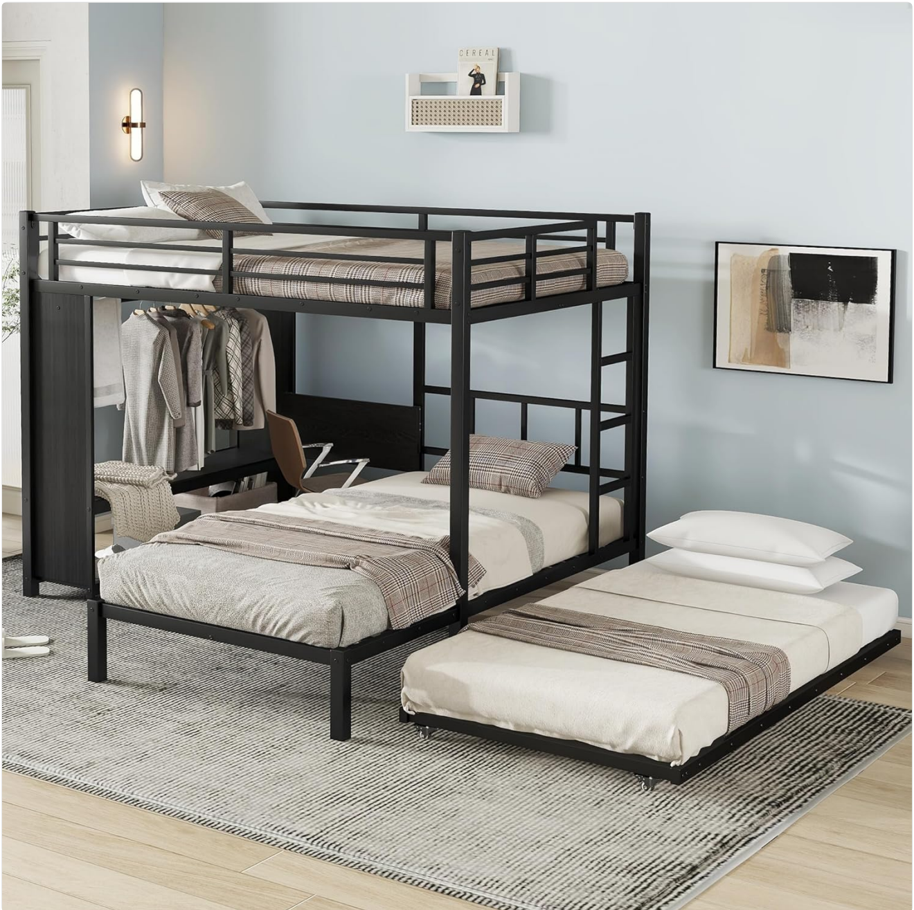
Image 3.2: The bunk bed with the trundle extended, demonstrating its space-saving capability.