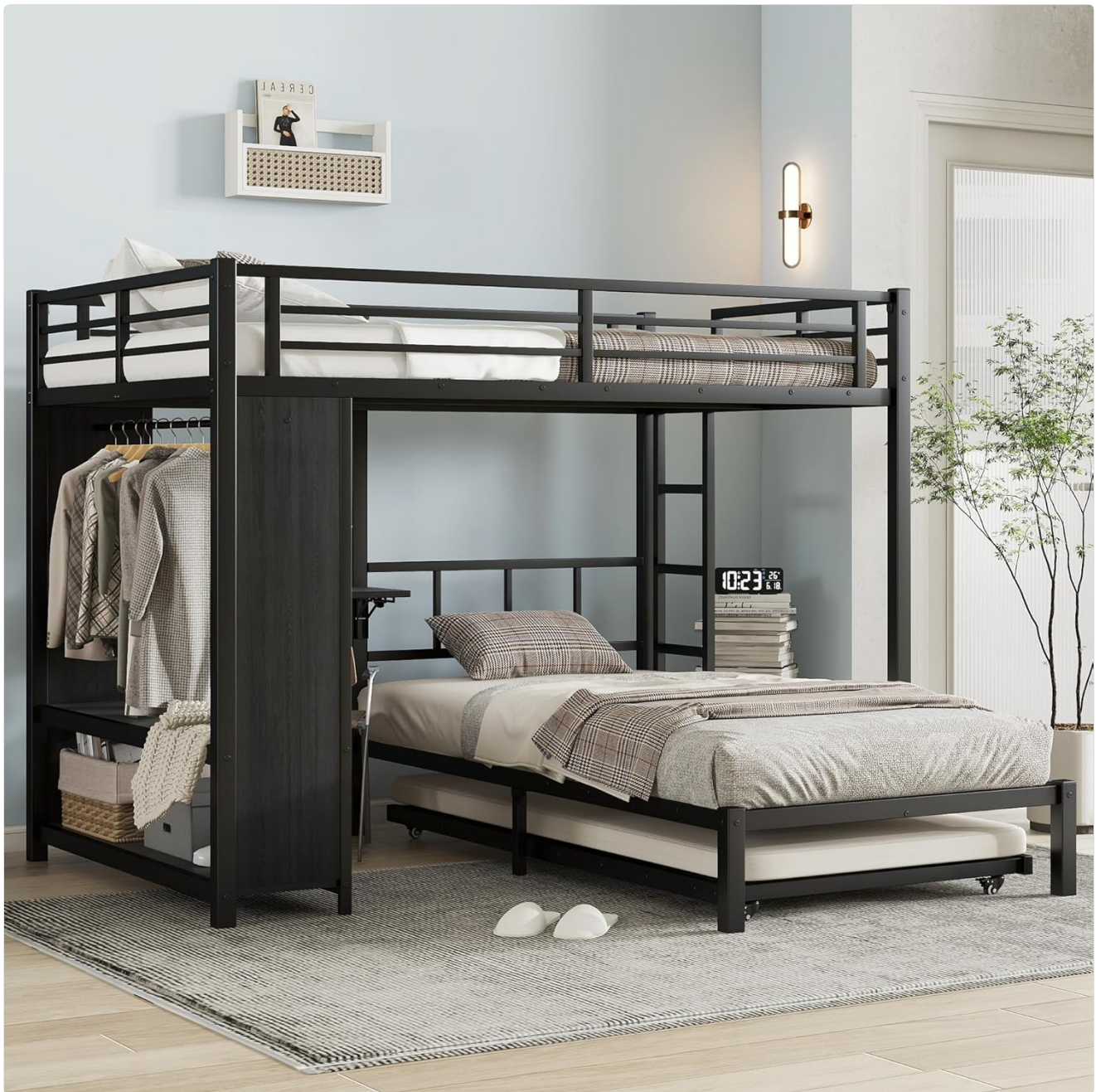
Image 1.1: Overview of the Polibi Full Over Twin Metal Bunk Bed, showcasing its integrated wardrobe, foldable desk, and trundle bed.