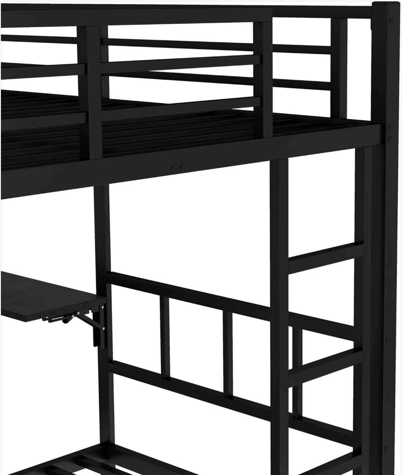
Image 7.1: Illustration of the various components that make up the Polibi bunk bed system.