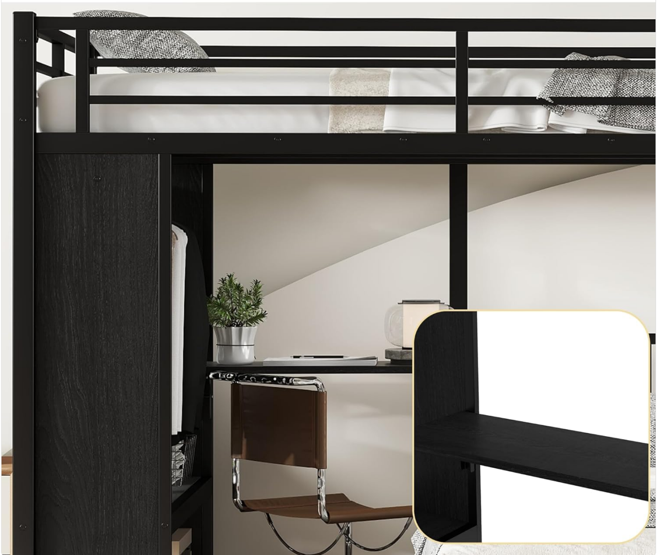
Image 4.3: A closer view of the foldable desk, highlighting its compact design when folded up.

Perfect for homework, reading, or as a nightstand.