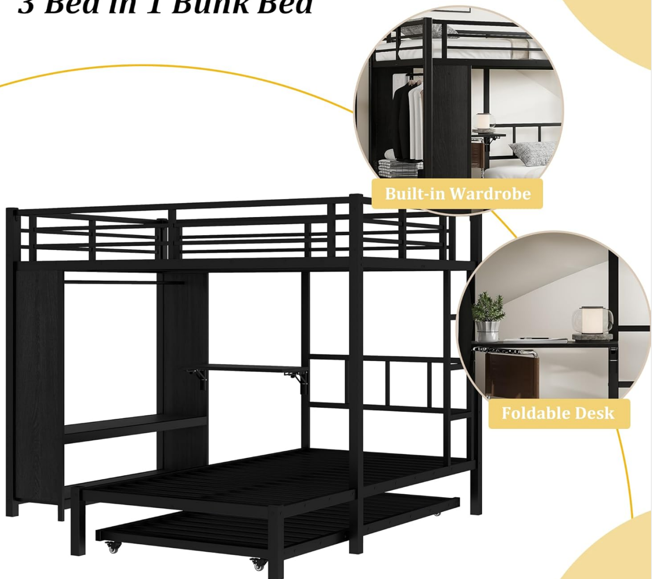
Image 4.1: Close-up view of the trundle bed mechanism, showing its wheels for easy movement.