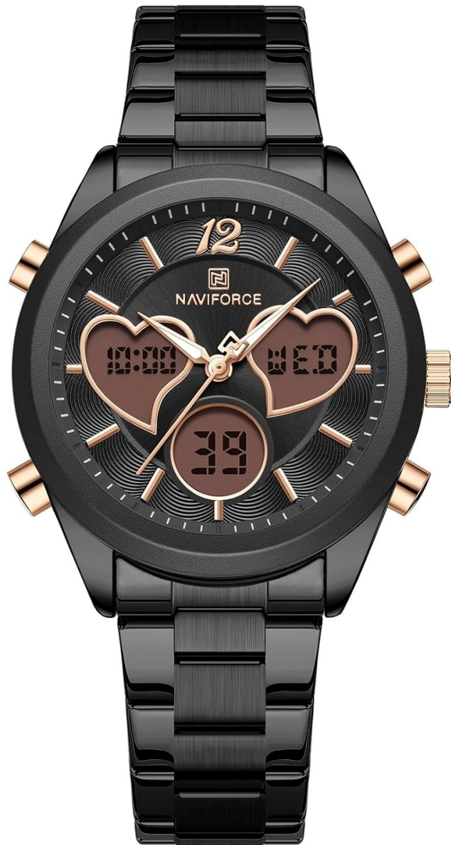
Image 1.1: Front view of the NAVIFORCE 5045S watch, showcasing its dual analog and digital display with heart-shaped elements.