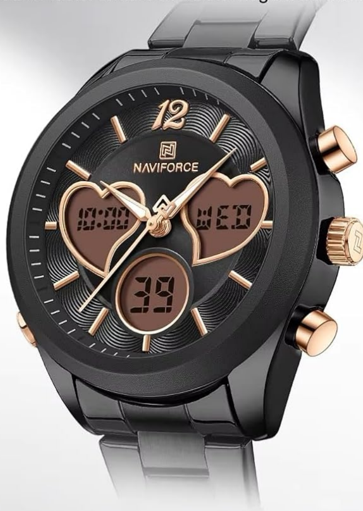
Image 2.2: The watch displaying its luminous mode, showing clear visibility of the digital time in darkness.

The metallic luster texture rivals the elegant aura of metal