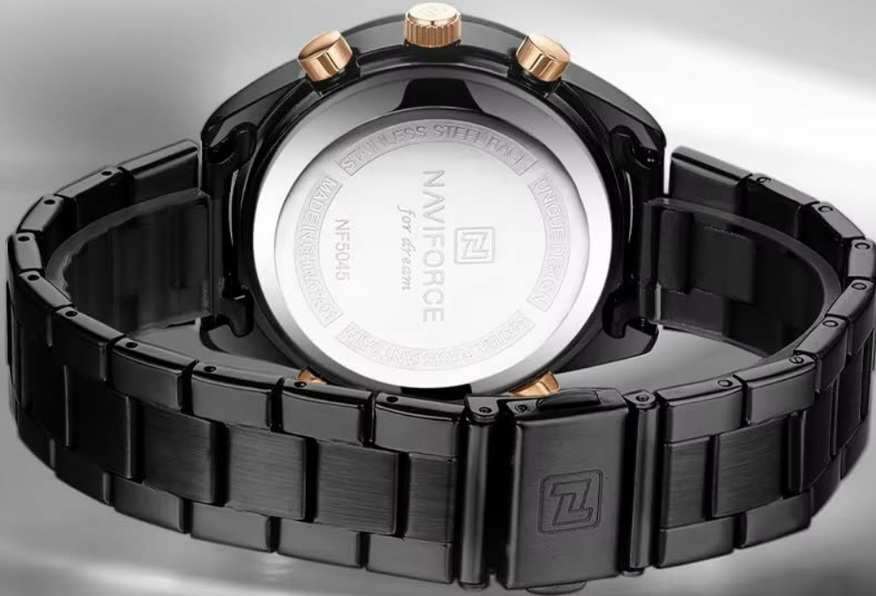
Image 7.1: Visual representation of key product dimensions and features.