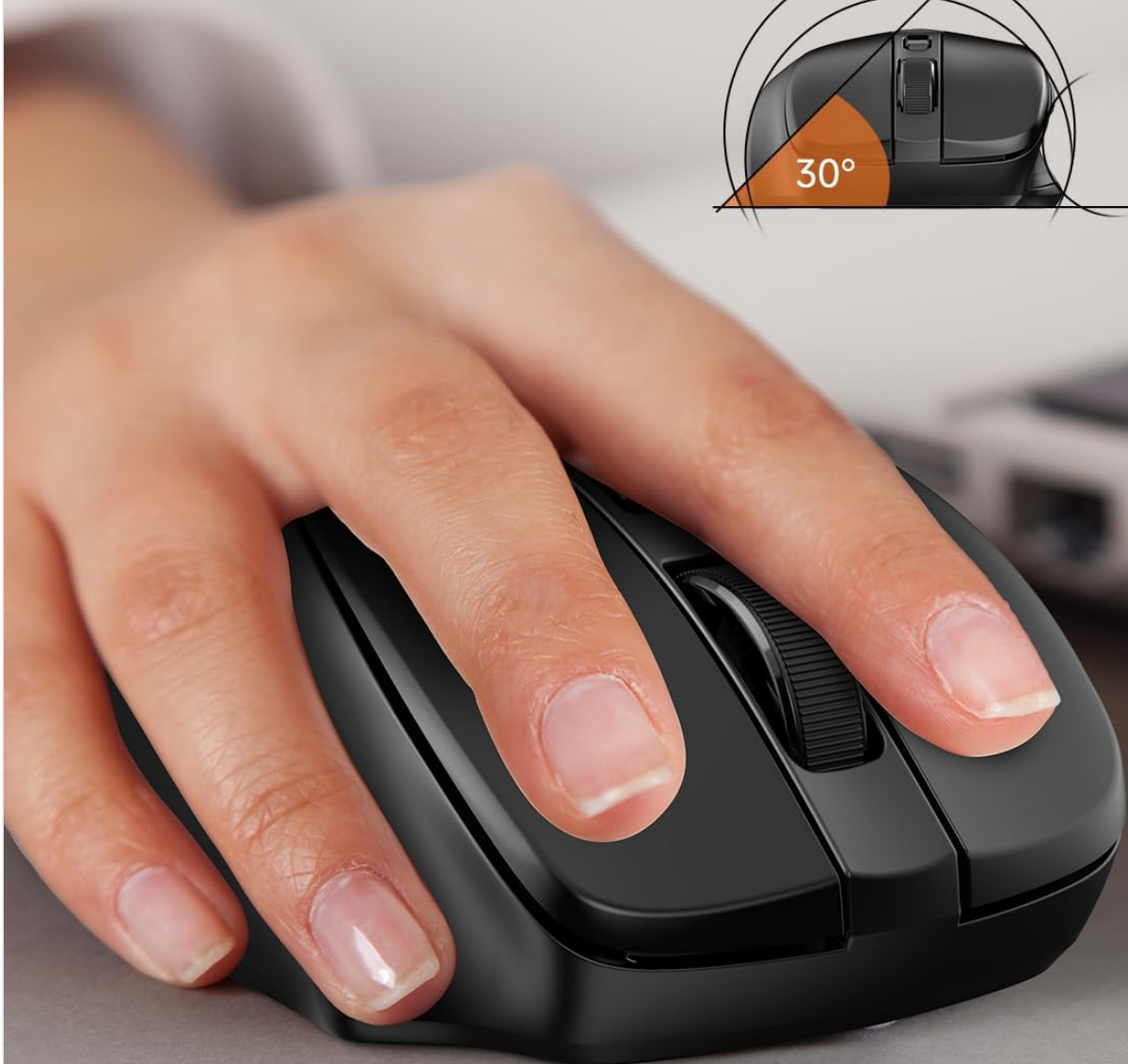
Image: A hand gripping the Redragon wireless mouse, demonstrating its ergonomic design with a 30-degree tilt for comfortable use and reduced muscle strain.