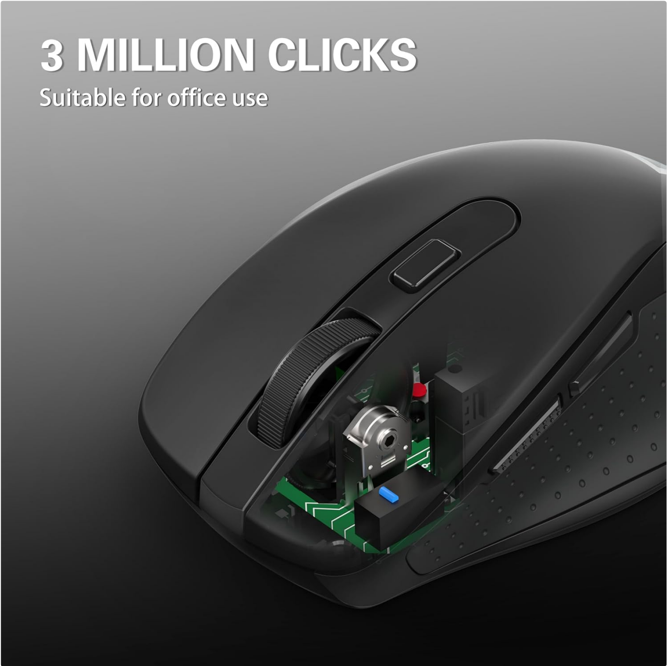
Image: An exploded view of the Redragon wireless mouse, illustrating its internal components and highlighting its lightweight construction at 68 ±5g.