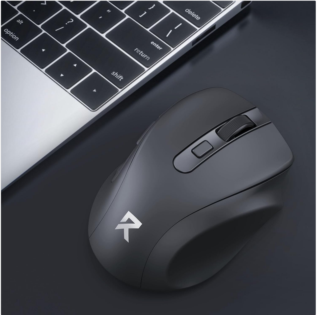
Image: The Redragon wireless mouse positioned next to a laptop, with the 2.4G USB receiver plugged into the laptop's USB port, illustrating the wireless connection.