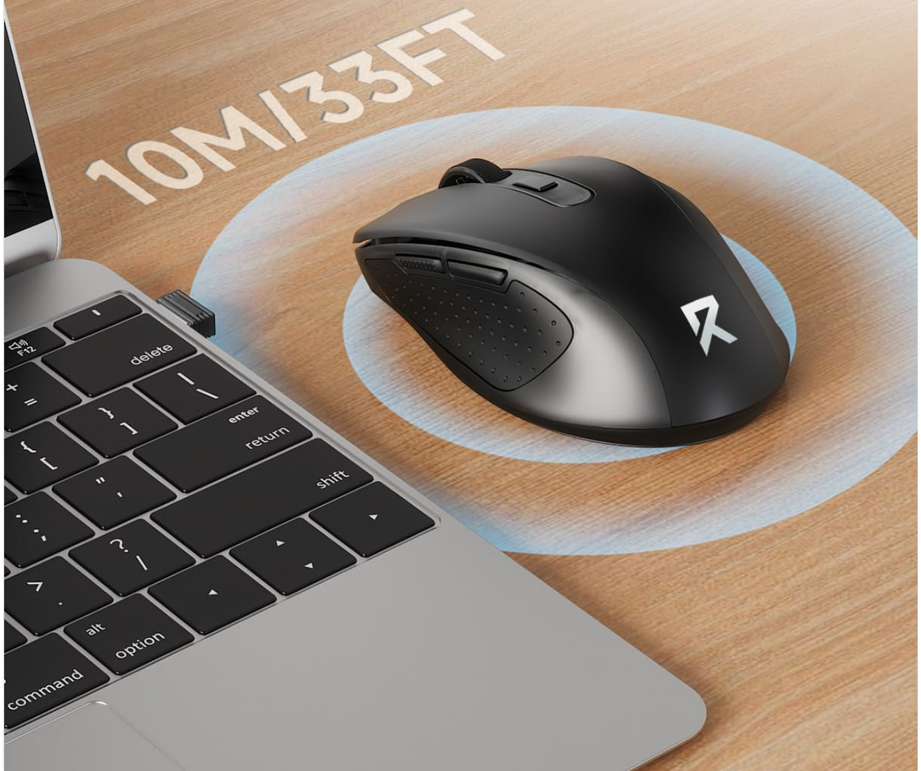
Image: The Redragon 2.4G Wireless Optical Mouse displayed on a desk, ready for use with a laptop.