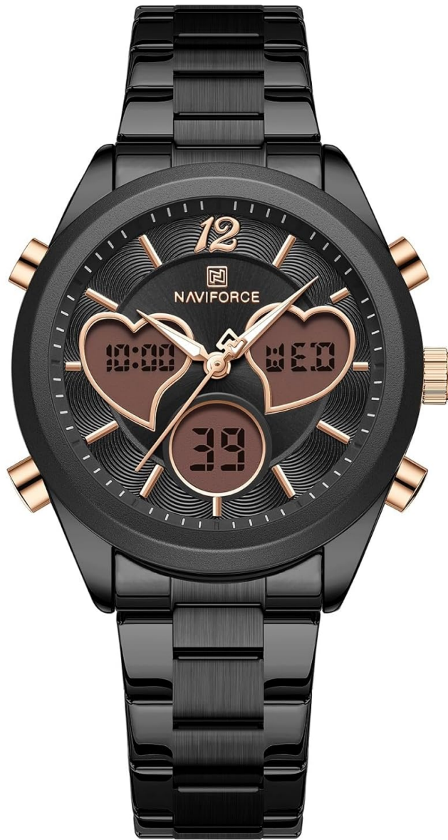
Front view of the NAVIFORCE 5045S watch, showcasing the black dial with rose gold accents, heart-shaped digital displays, and stainless steel strap.