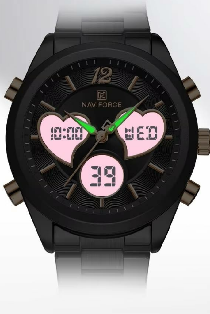
Image demonstrating the luminous display mode of the NAVIFORCE 5045S watch, showing the digital elements glowing in the dark.