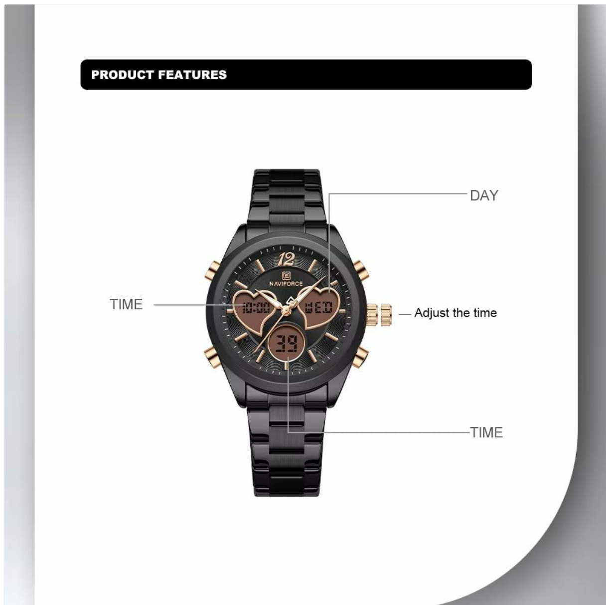
Diagram highlighting the watch's buttons and their functions for adjusting time and day on the digital display.

the diagram below for button identification.