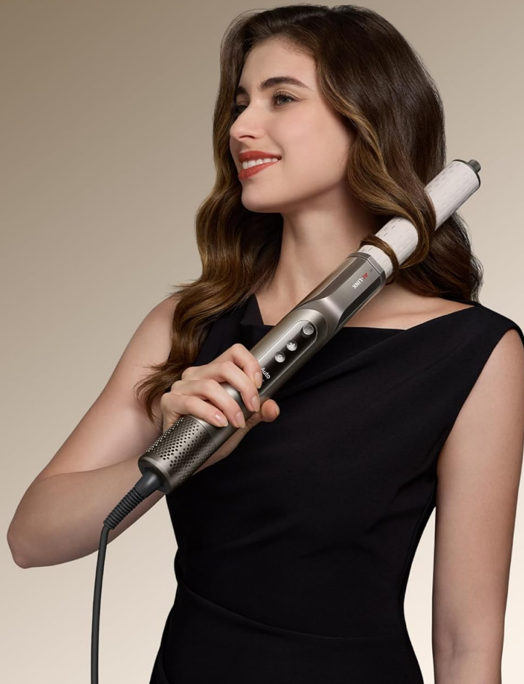
Image: Demonstrating the versatility of the styling options with different nozzles.

Your browser does not support the video tag.