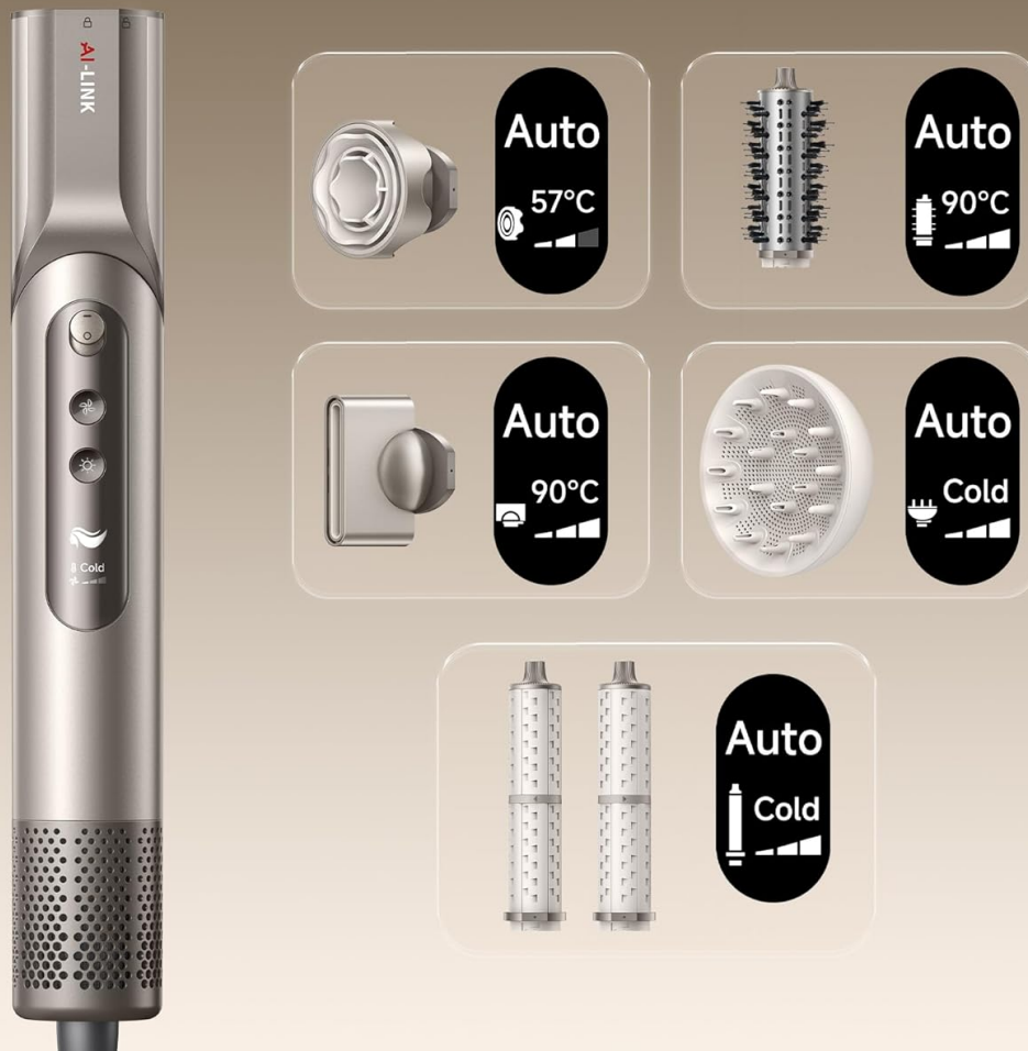
Image: Visual guide on attaching various nozzles to the main unit.