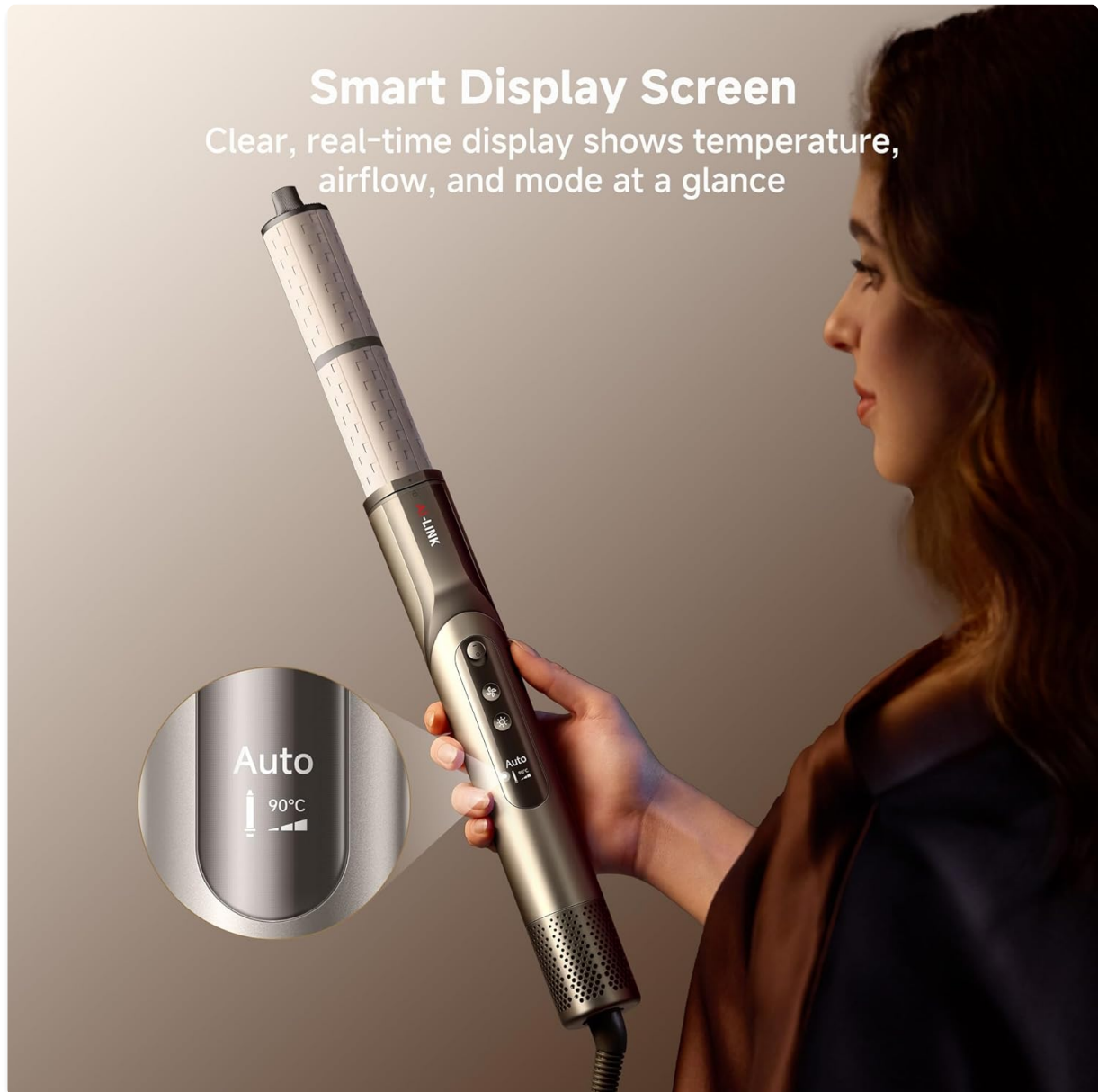
Image: The smart display screen indicating automatic settings.