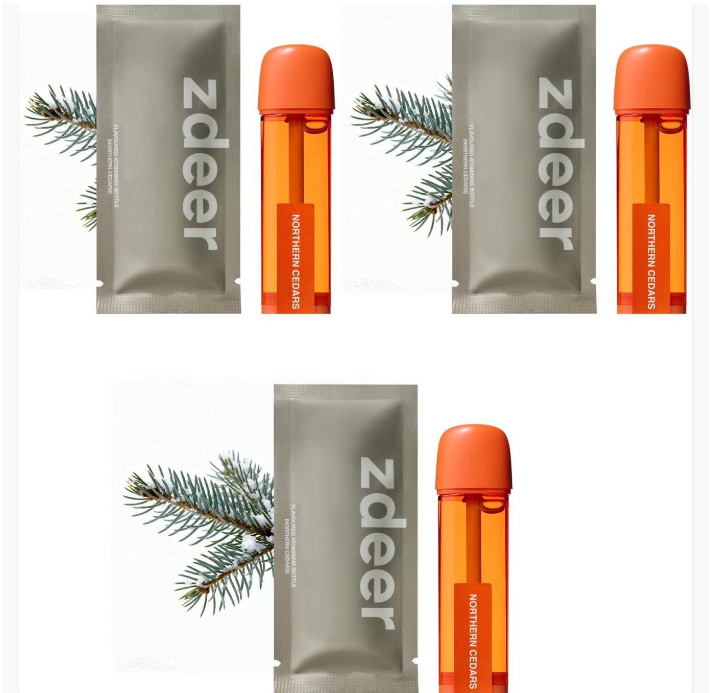
Image 2.1: ZDEER Smart Electric Oral Spray Refill 3-Pack (Northern Cedars).

The Northern Cedars flavor is formulated to deliver a clean, balanced freshness with each spray, contributing to a pleasant oral sensation.