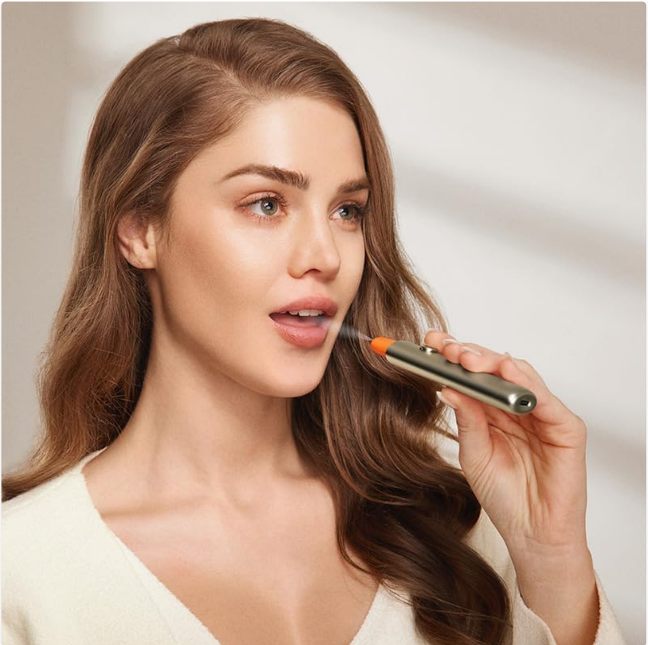
Image 5.1: Demonstrating the use of the ZDEER Smart Oral Spray device.