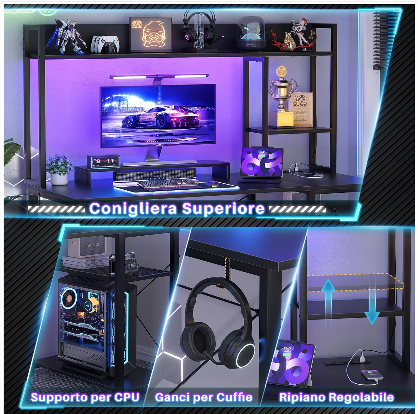
Image: A gaming desk setup featuring a monitor on the elevated stand, surrounded by vibrant RGB LED lighting from the integrated strips, enhancing the gaming atmosphere.