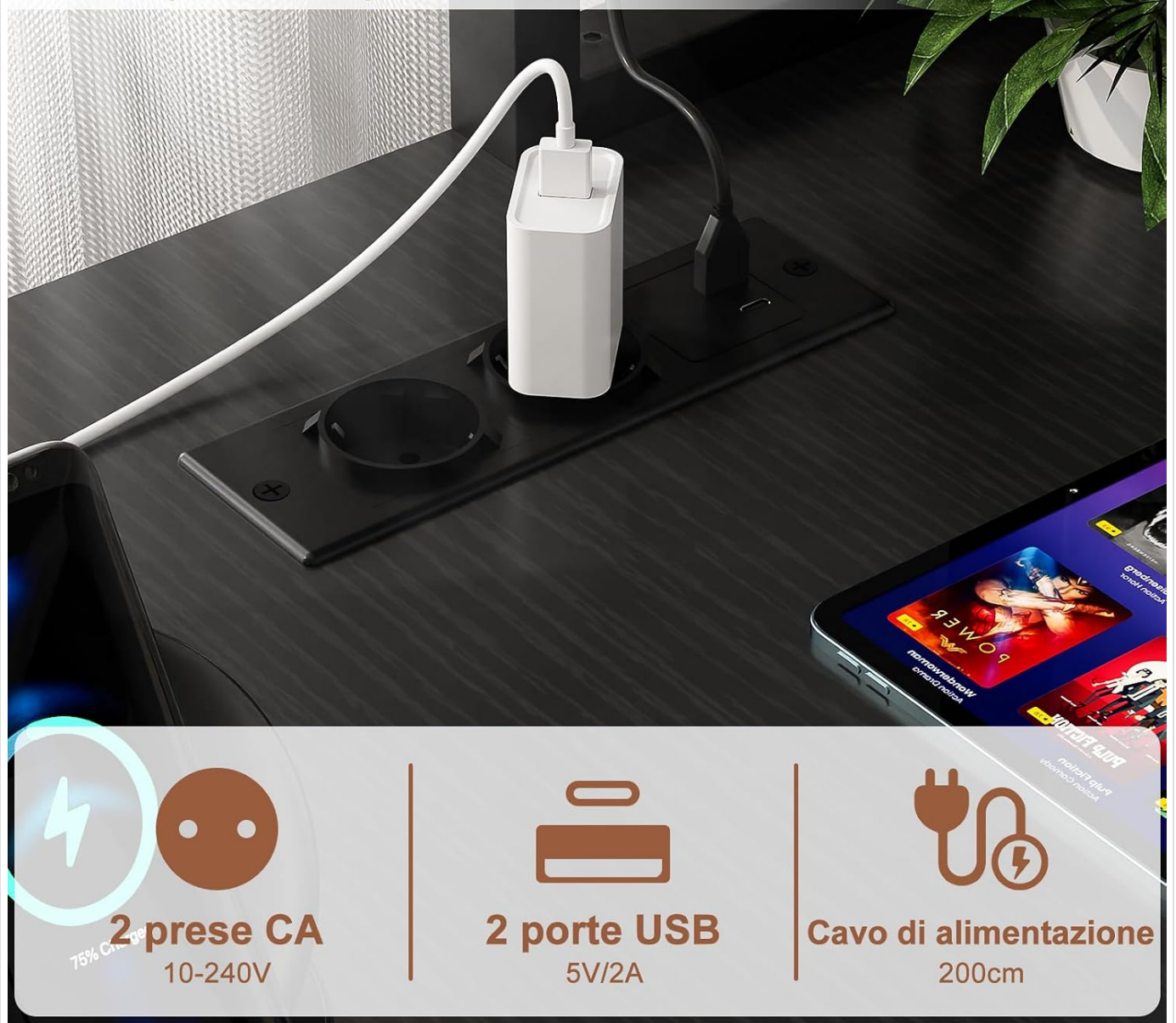
Image: A close-up view of the integrated power strip, showing two AC outlets and two USB ports, with devices plugged in for charging.