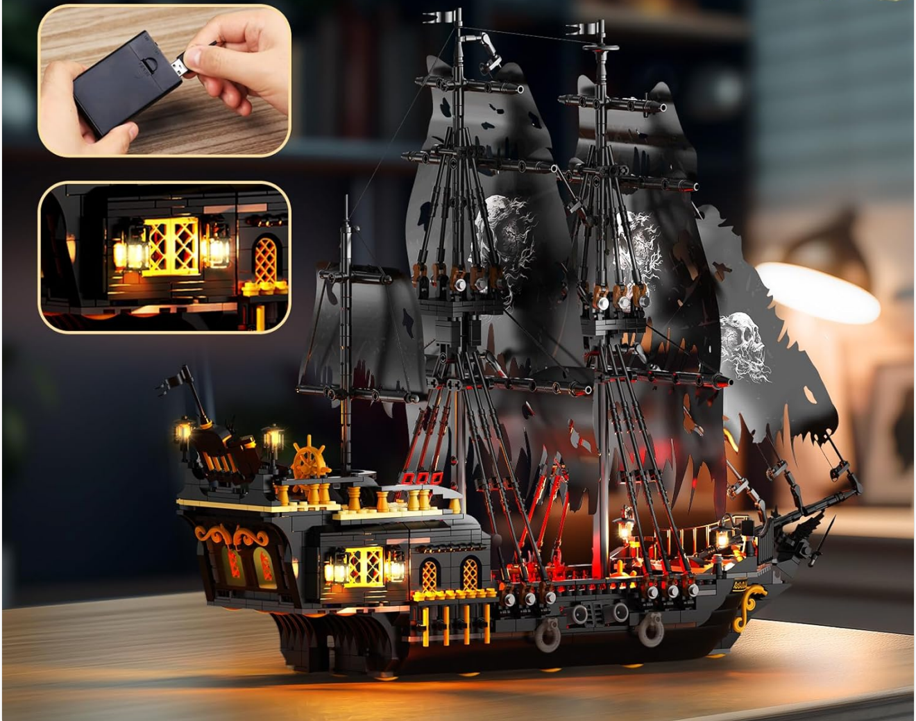
Image: Illustration of Model 40002's 11 LED lights being powered by USB via the battery box, which requires 3 AA batteries.