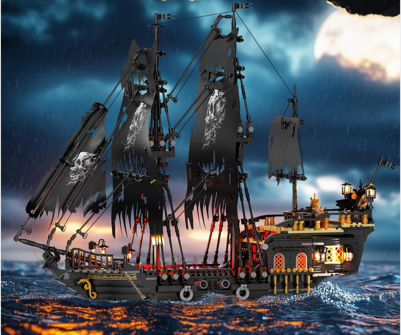
Image: JMBricklayer Model 40002, the Classic Black Pearl Pirate Ship, showcasing its charming warm LED illumination.