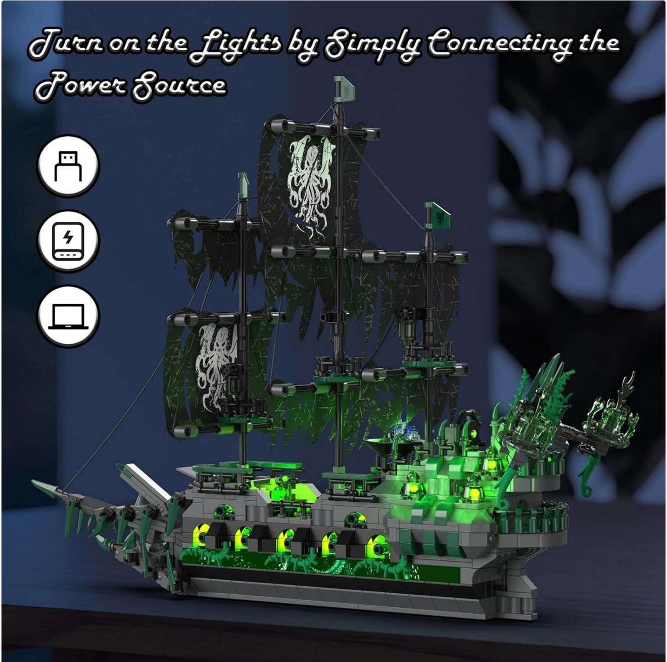
Image: Close-up of JMBricklayer Model 40001, illustrating the simple connection of the power source to activate the green LED lights.