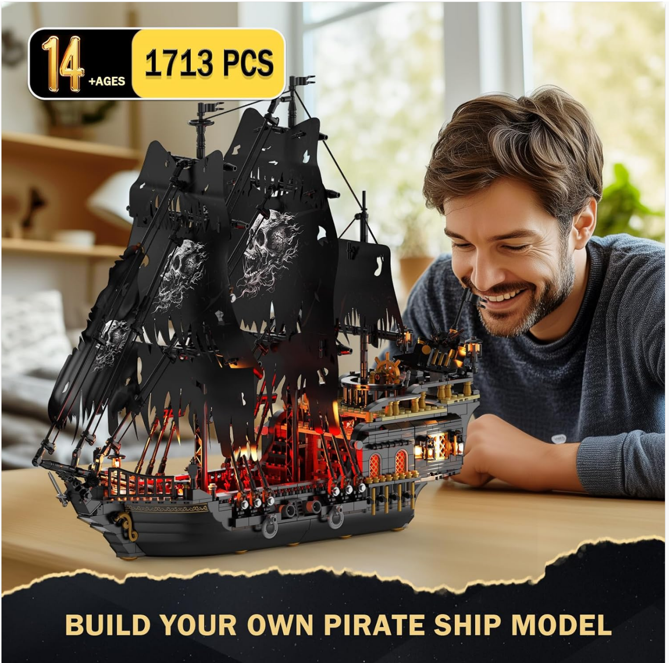
Image: JMBricklayer Model 40002, highlighting the recommended age of 14+ and the piece count of 1713+.