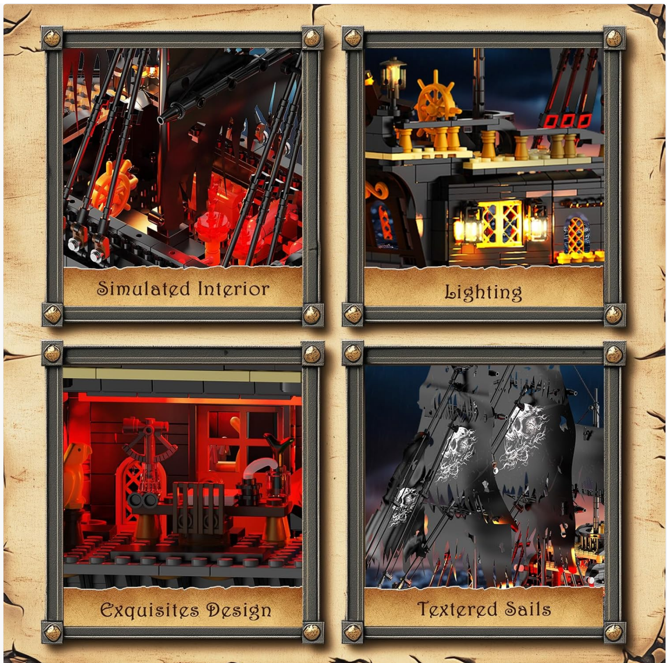
Image: Detailed views of Model 40002, highlighting the simulated interior, integrated lighting, exquisite design elements, and textured sails.