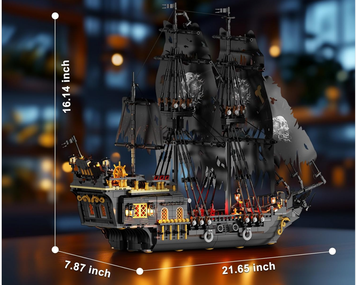
Image: Dimensional overview of JMBricklayer Model 40002.