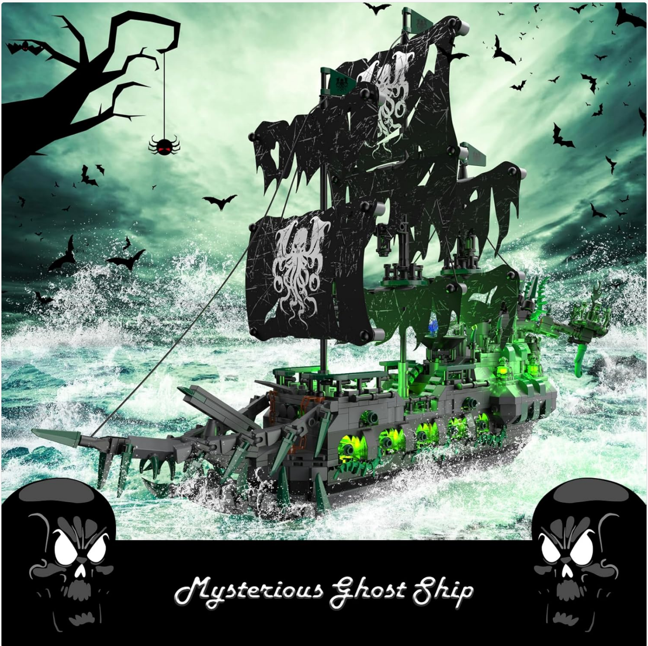
Image: JMBricklayer Model 40001, the Mysterious Ghost Ship, illuminated with its vivid green LED lights.

Model 40001 is equipped with 9 green LED beads. Integrate the LED wiring as indicated in the specific steps of your physical manual. The wiring is designed to be discreetly hidden within the model's structure.