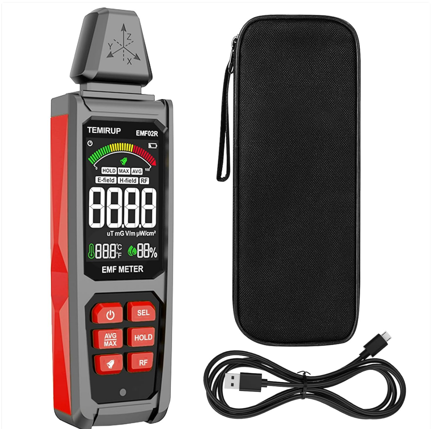
Figure 1: Contents of the TEMIRUP EMF02R package.