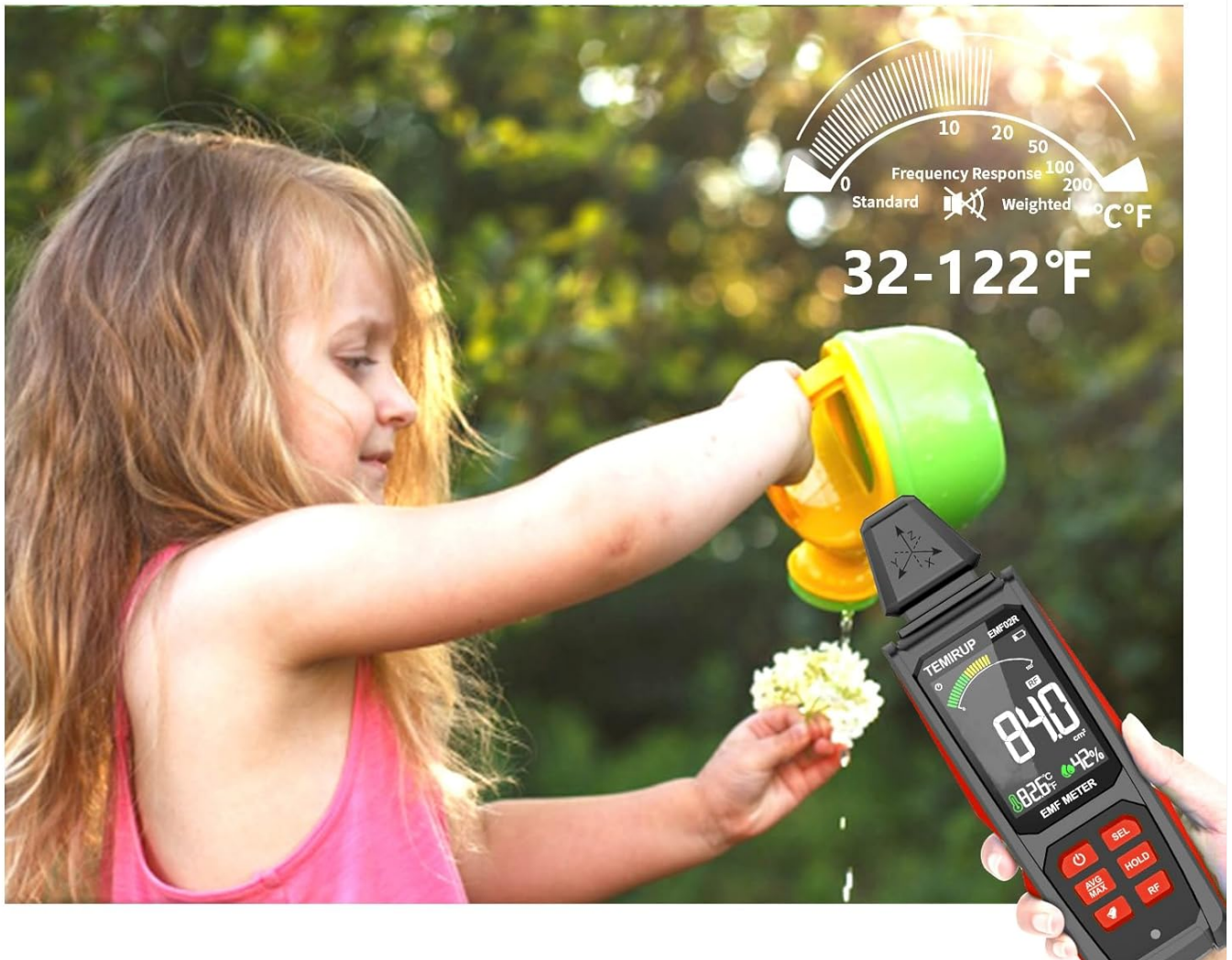
Figure 7: The EMF meter displaying ambient temperature and humidity.

When using this function, it needs to be placed at the current ambient temperature for more than 30 minutes to measure