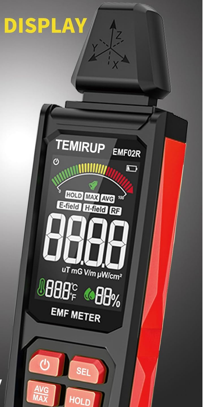
Figure 4: The device's display showing various measurement parameters and mode indicators.