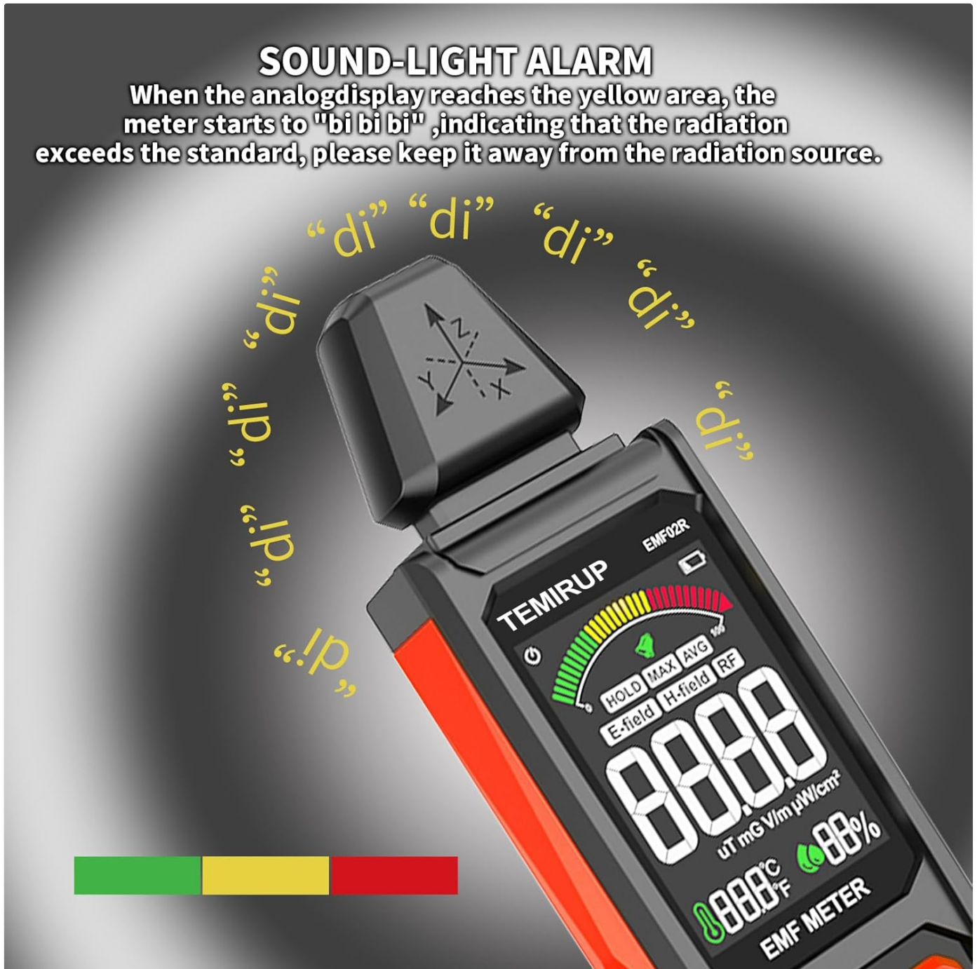
Figure 8: Visual representation of the sound-light alarm when radiation levels are high.