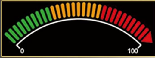
3 Color Analog Bar Display