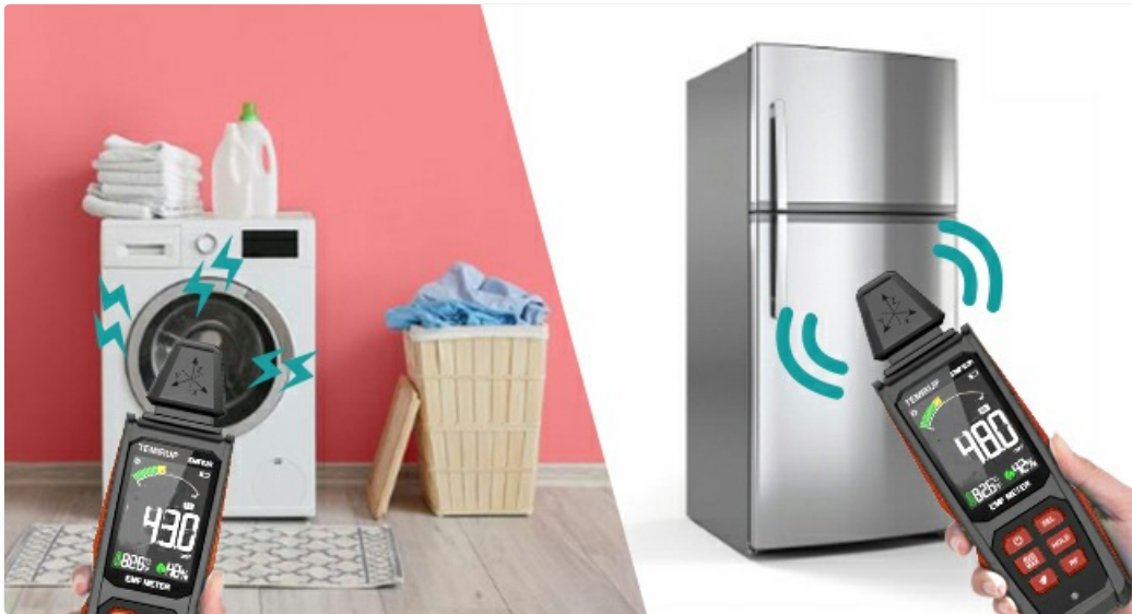
Figure 5: Measuring electric and magnetic fields from common household appliances.