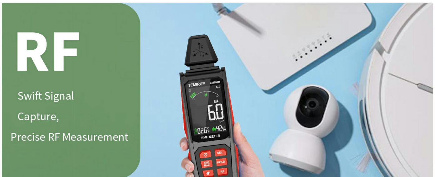
Figure 6: Measuring RF radiation from a WiFi router.

Your browser does not support the video tag.