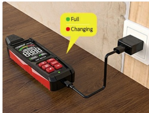
Figure 3: Charging the EMF Meter. A red indicator signifies charging, while a green indicator shows a full charge.

Before first use, fully charge the device using the provided USB Type-C cable and a compatible USB power adapter (not included). The battery indicator on the display will show charging status.